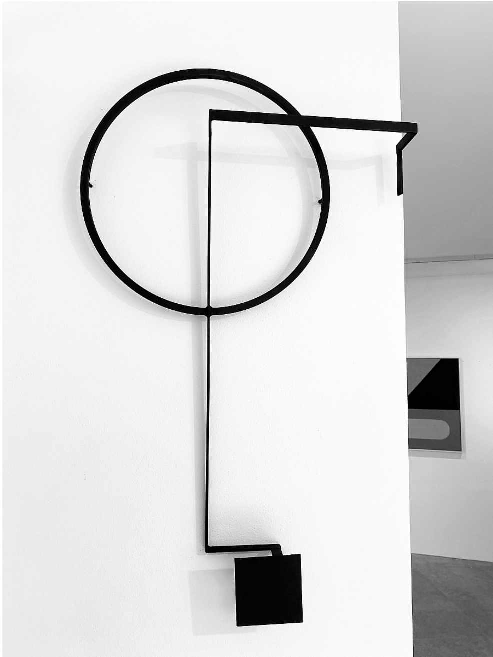
Caroline McGregor Fishing for Fallen Light , 2020 Steel and paint 110h x 10w x 67d cm A$ 2,200.00