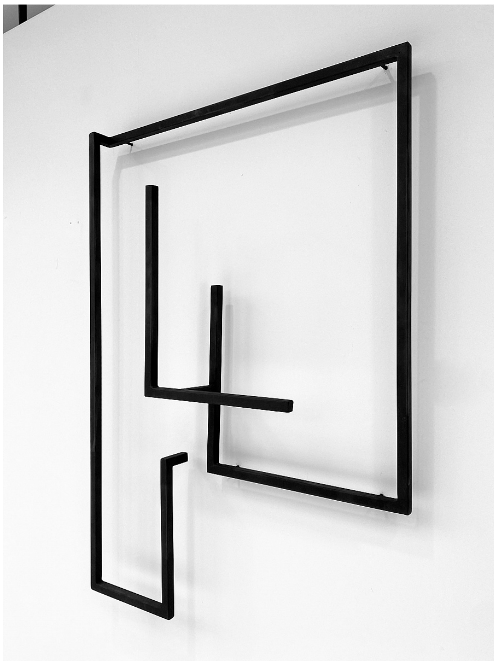
Caroline McGregor Inception , 2020 Steel and paint 110h x 75w x 12d cm A$ 2,800.00