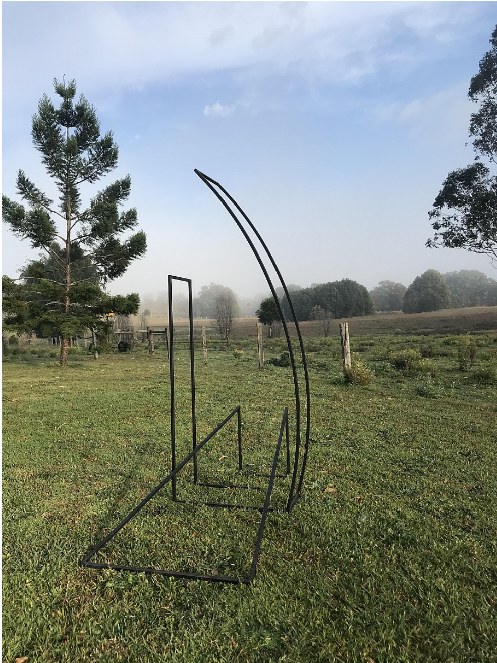
Caroline McGregor The Invitation , 2020 Steel and paint 233h x 91w x 194d cm A$ 15,000.00