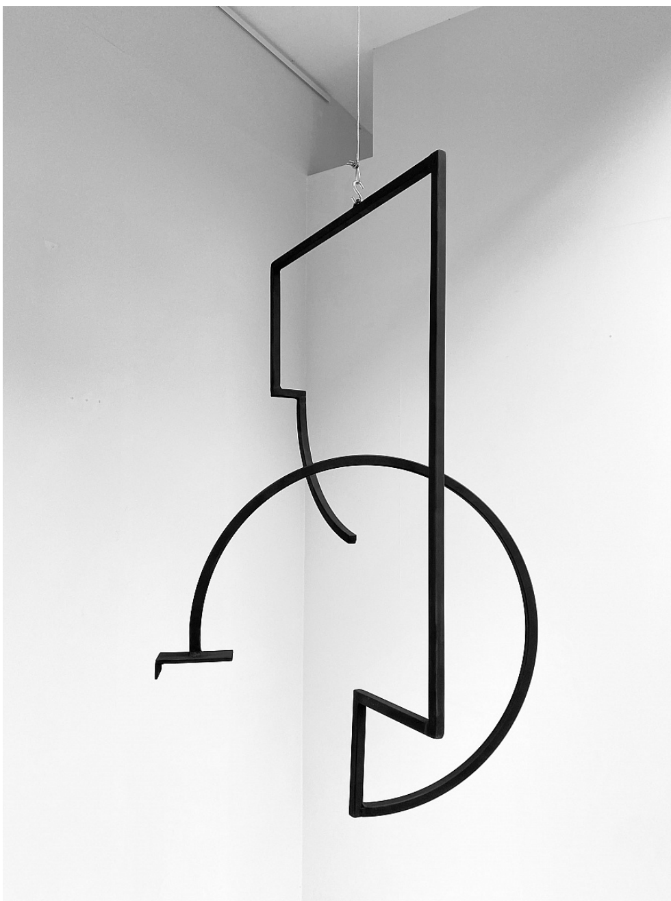
Caroline McGregor I Am Finding Out There Is No Other Way 1 , 2020 Steel and paint 85h x 46w x 52d cm A$ 2,200.00