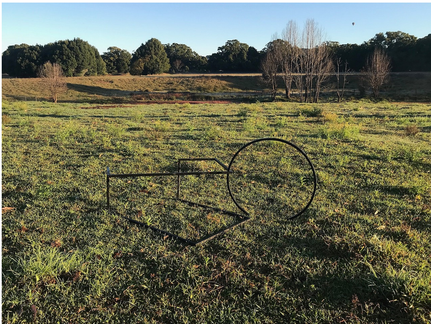
Caroline McGregor The Sweet Taste of Freedom , 2020 Steel and paint 74h x 125w x 184d cm A$ 7,500.00