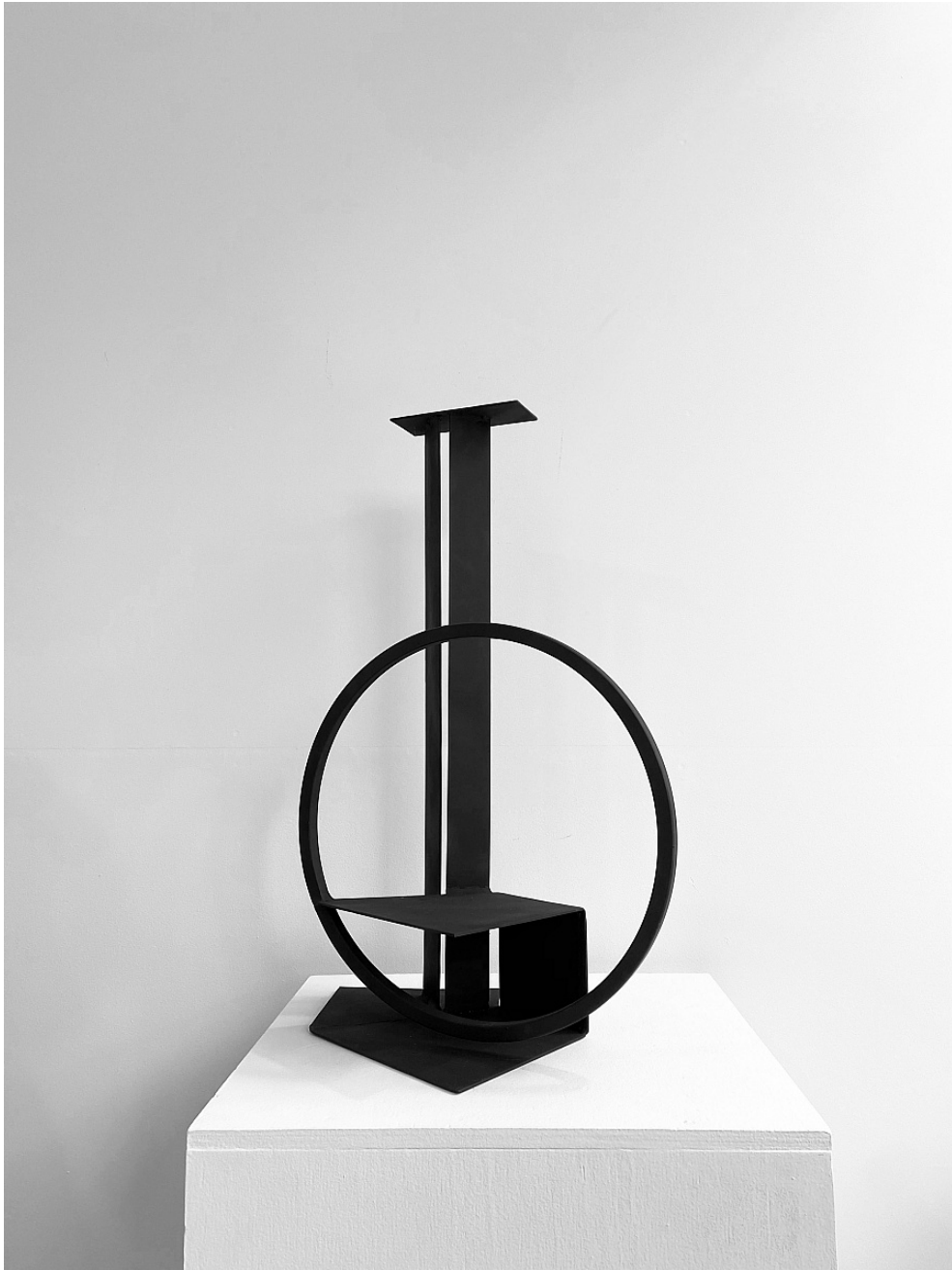
Caroline McGregor Untold Stories , 2020 Steel and paint 67h x 45w x 26d cm A$ 2,200.00