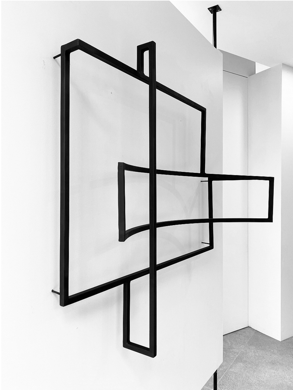
Caroline McGregor Coming Home , 2020 Steel and paint 113h x 127w x 38d cm A$ 3,300.00