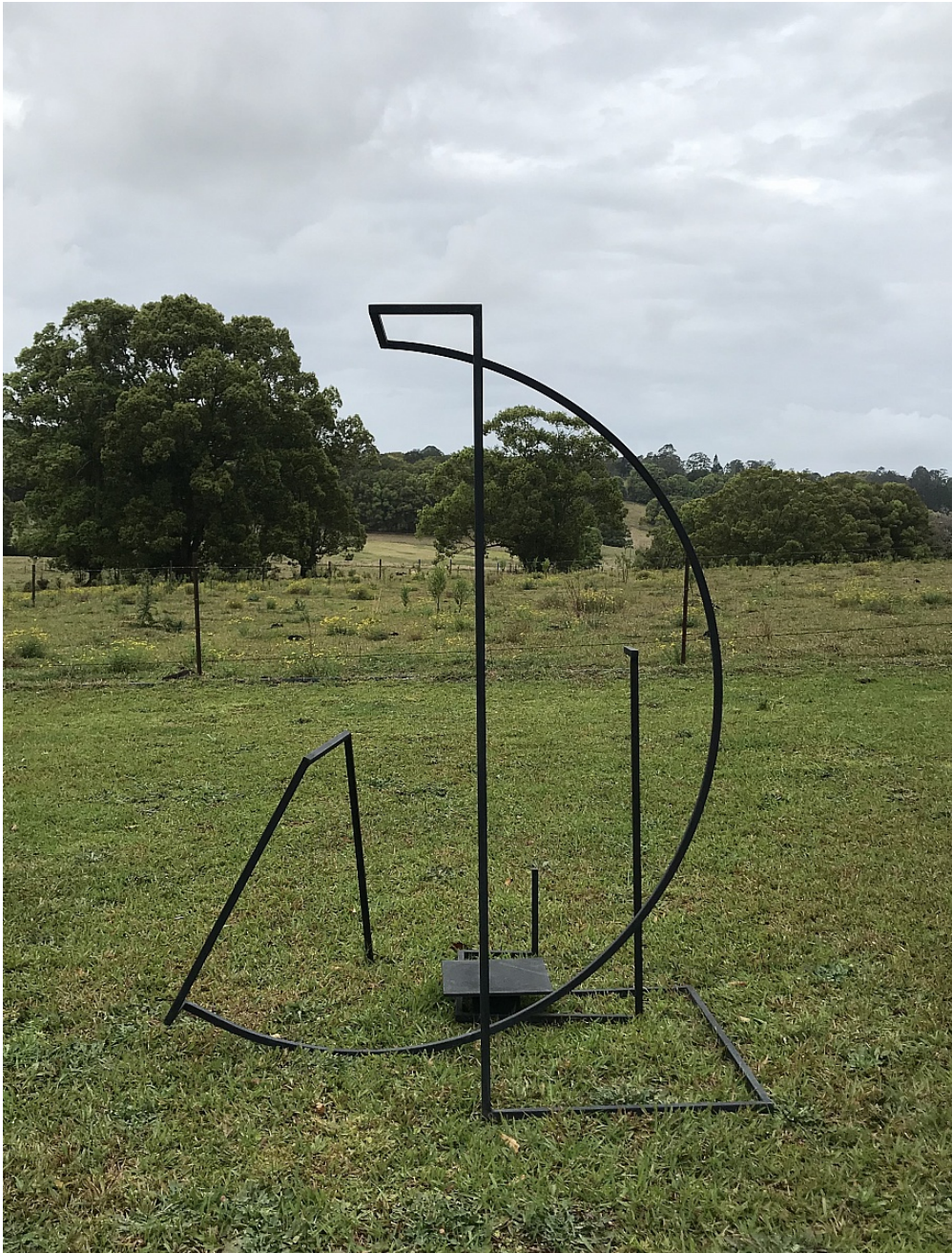
Caroline McGregor The Sum of My Parts , 2020 Steel and paint 185h x 134w x 147d cm A$ 18,000.00