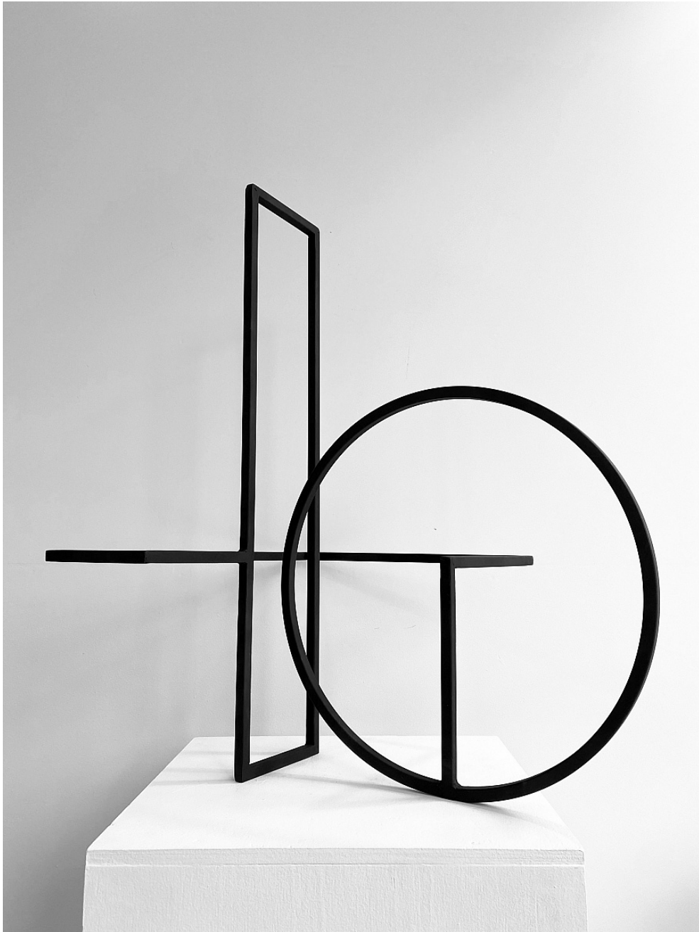
Caroline McGregor Theatre of Light , 2020 Steel and paint 84h x 54w x 70d cm A$ 2,500.00