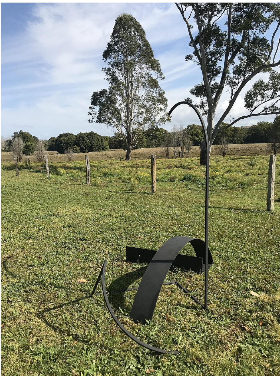
Caroline McGregor Moments of Grace , 2020 Steel and paint 185h x 193w x 144d cm A$ 15,000.00