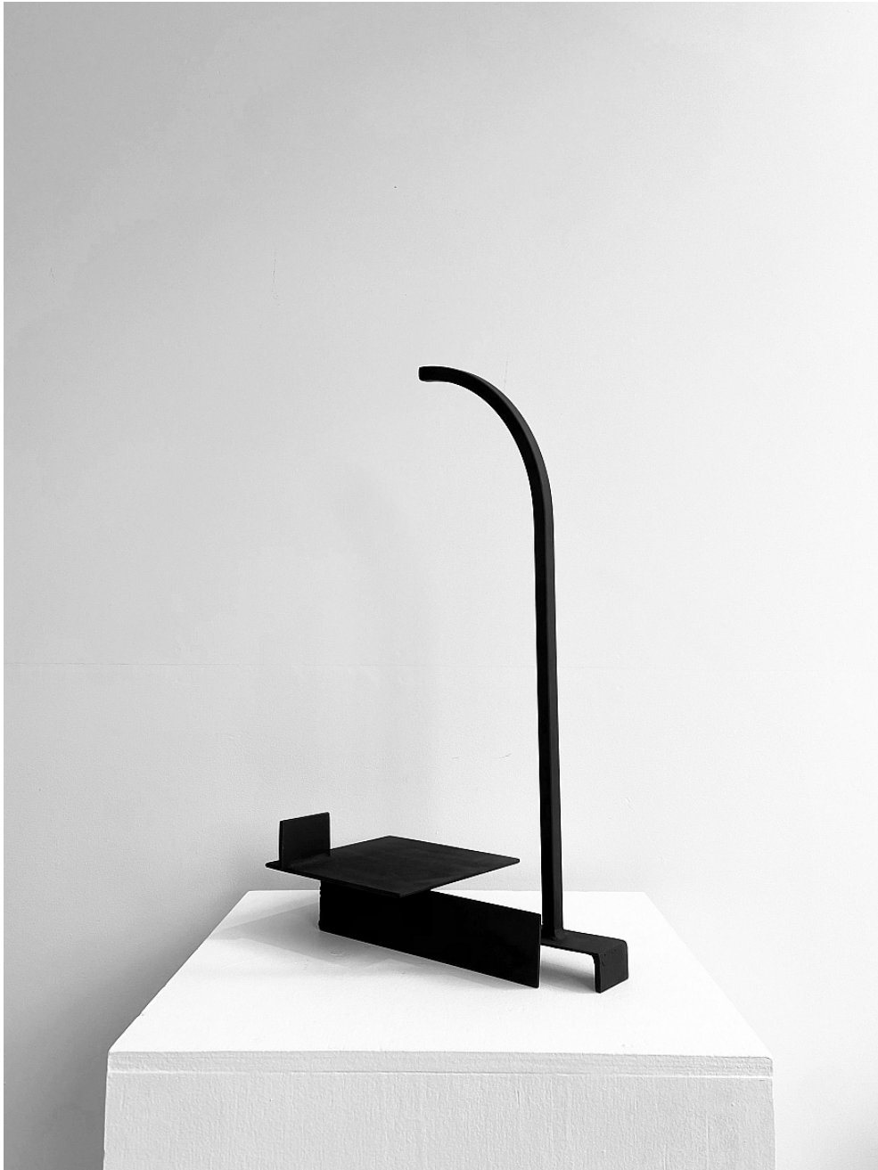
Caroline McGregor One Quiet Morning , 2020 Steel and paint 61.50h x 21.20w x 37.50d cm A$ 2,200.00