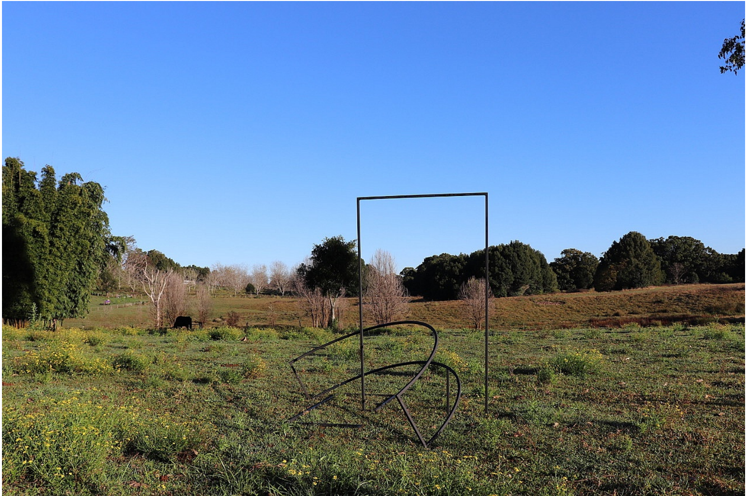
Caroline McGregor The Promise of a Soft Landing , 2020 Steel and paint 192h x 162w x 164d cm A$ 15,000.00