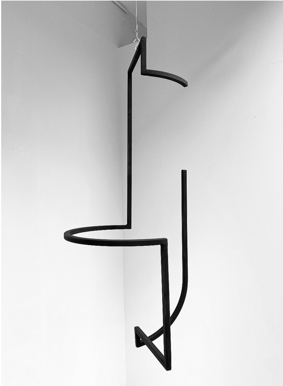
Caroline McGregor I Am Finding Out There Is No Other Way 2 , 2020 Steel and paint 94h x 41w x 37d cm A$ 2,200.00