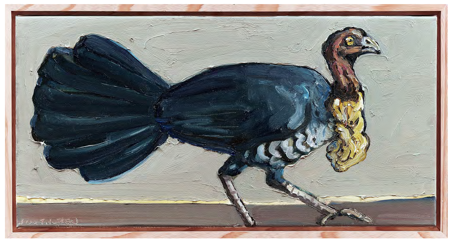
Jane Guthleben Brush turkey with bright wattle, 2020 Oil on Belgian linen 20h x 40w cm A$ 1,600.00