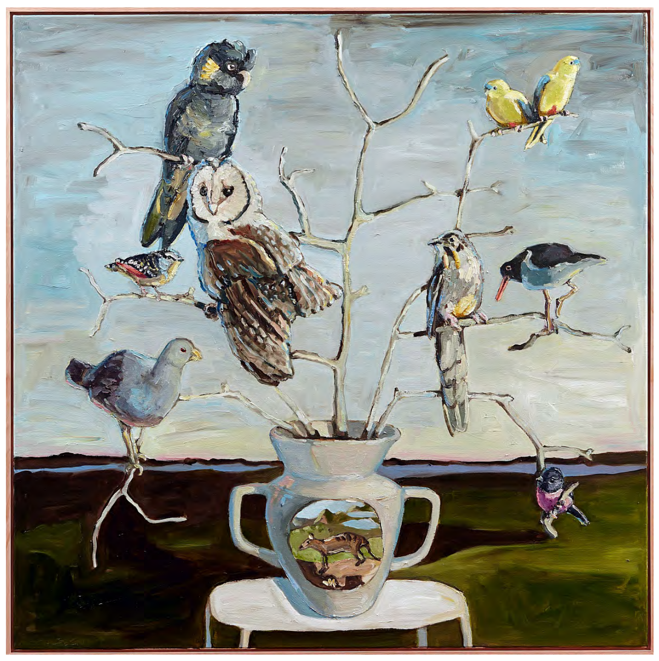
Jane Guthleben Tasmanian arrangement with thylacine, 2020 Oil on Belgian linen 100h x 100w cm A$ 6,000.00