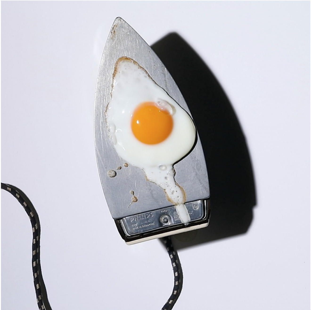
Josh Reeves Caged Egg on Iron , 2019 45h x 45w cm Photographic Print Edition 1-2 $440 Edition 3-4 $660 Edition 5-8 POA Unframed