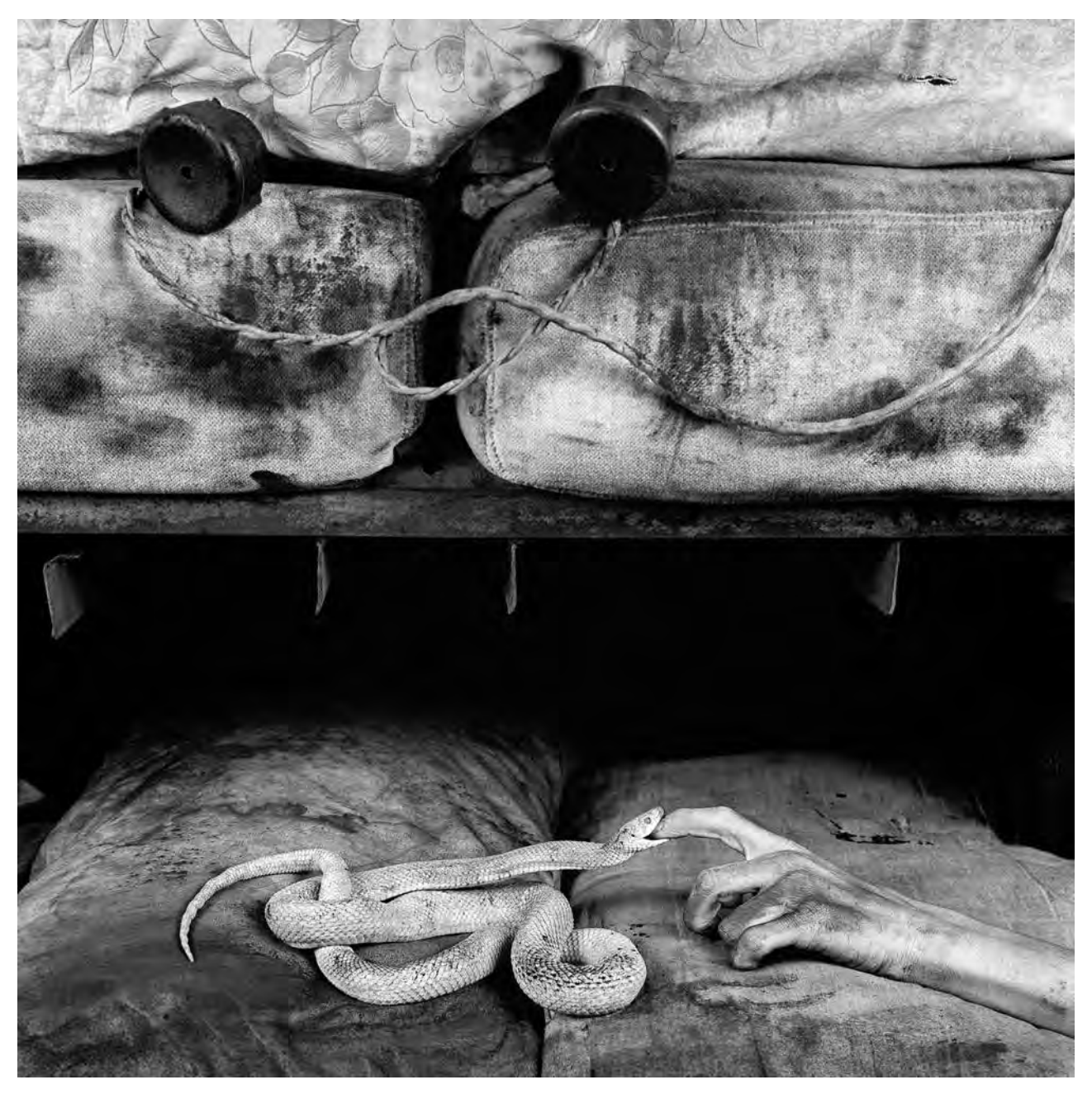
Roger Ballen Bite, 2007 Silver gelatin print Edition of 10 80 x 80 cm POA