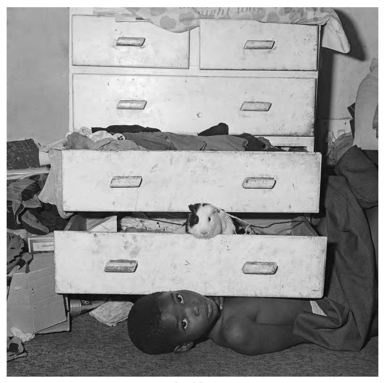
Roger Ballen Child Under Chest of Drawers, 2000 Silver gelatin print Edition of 35 40 x 40 cm POA