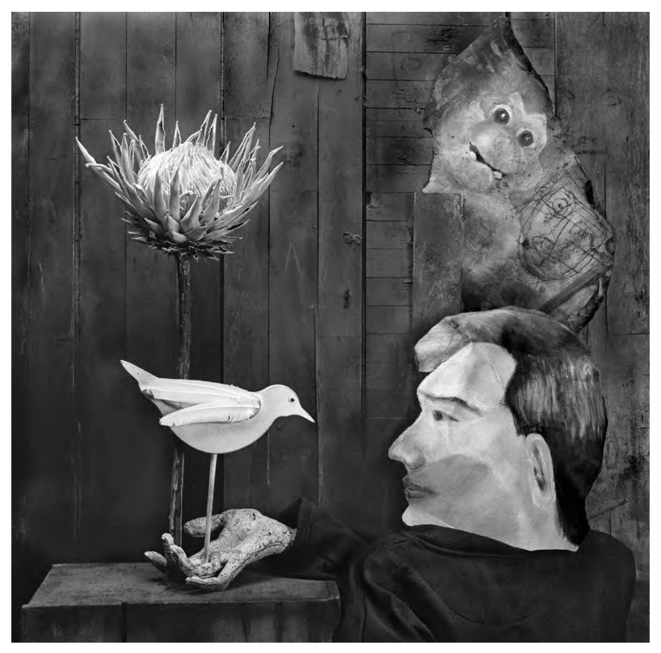
Roger Ballen Eye to Eye, 2011 Hahnemuhle pigment print Edition of 5 91 x 91 cm POA