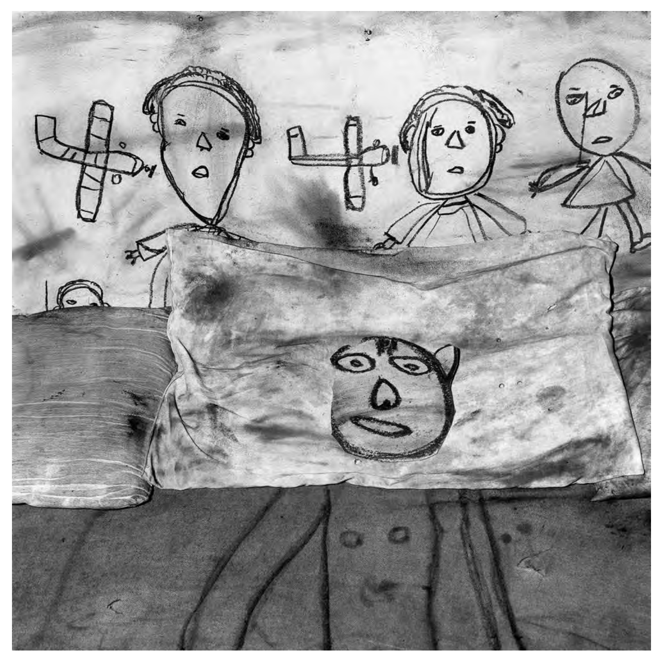
Roger Ballen Collision, 2005 Silver gelatin print Edition of 10 50 x 50 cm POA