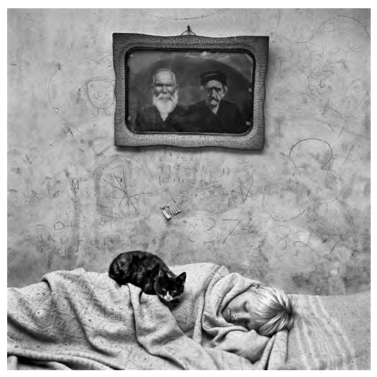
Roger Ballen Portrait of Sleeping Girl, 2000 Silver gelatin print Edition of 35 40 x 40 cm POA