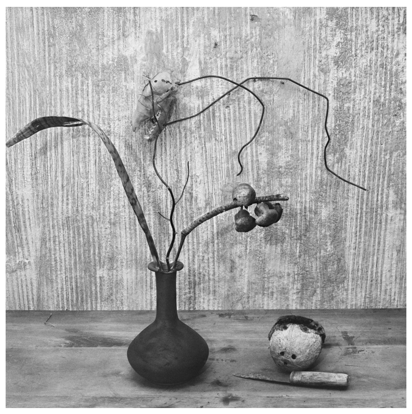
Roger Ballen Vase and Skull, 2005 Silver gelatin print Edition of 10 50 x 50 cm POA