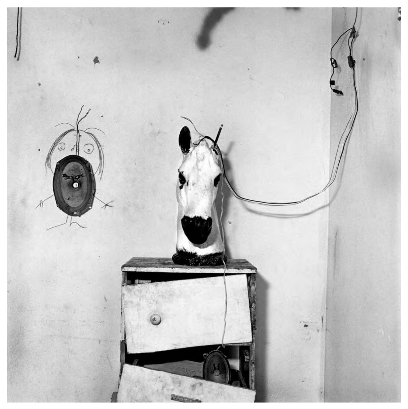
Roger Ballen Horse Head on Drawers, 1998 Silver gelatin print Edition of 10 40 x 40 cm POA