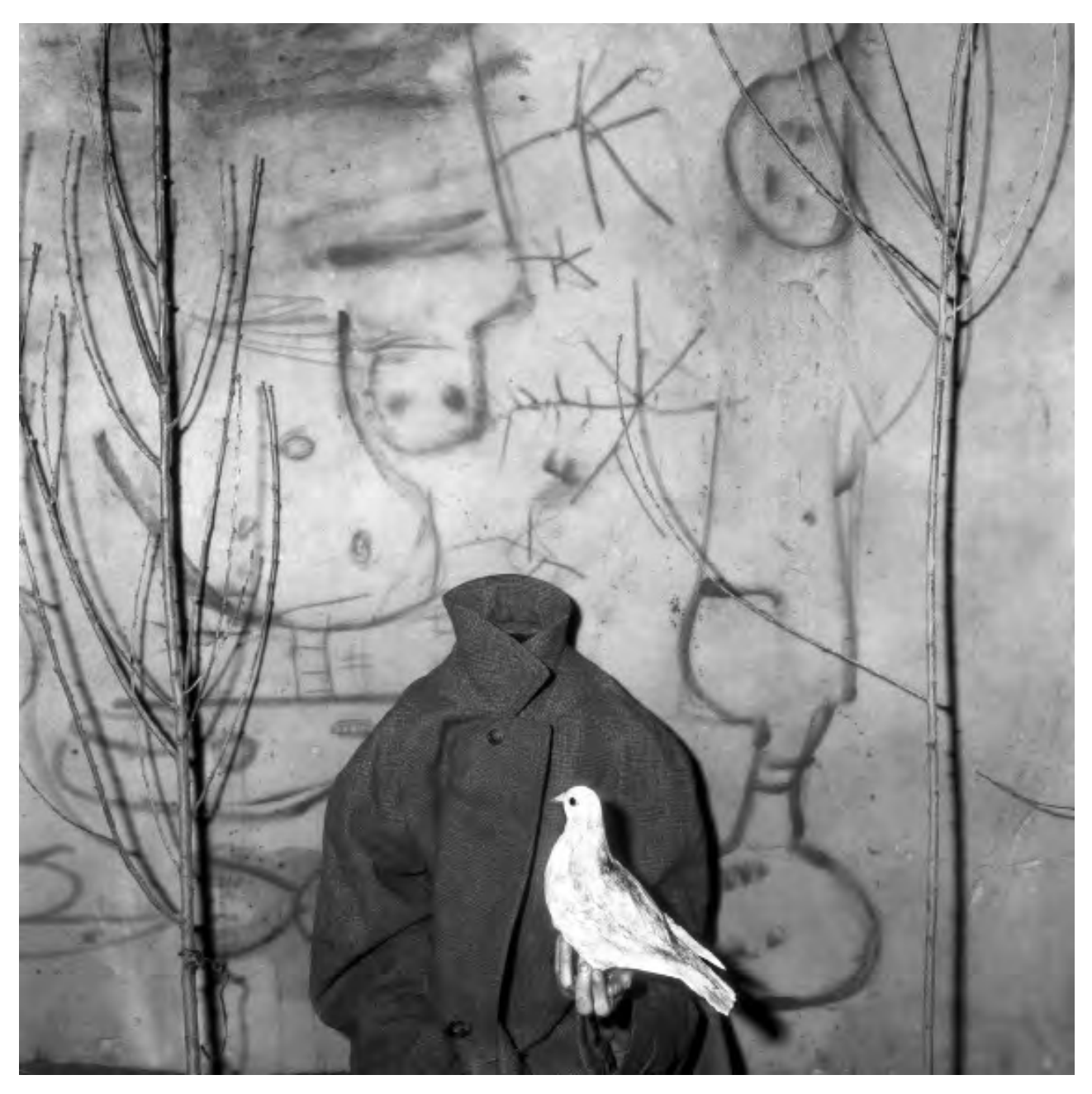
Roger Ballen Headless, 2006 Hahnemuhle pigment print Edition of 20 91 x 91 cm POA