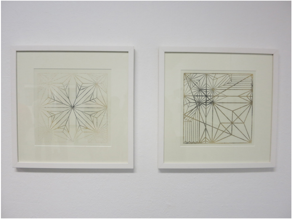
Origami Crease Patterns , 2013 Screen print., sand, pink Himalayan rock salt, icing sugar, metal dust $150 Each