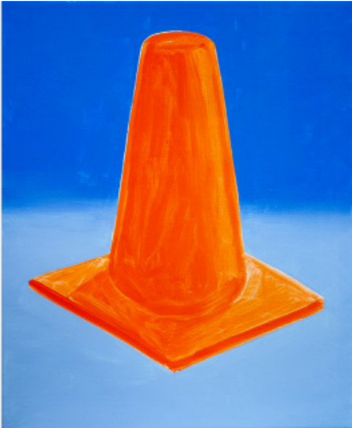
Cone #2 , 2014 oil on canvas 56 x 46.5cm $340