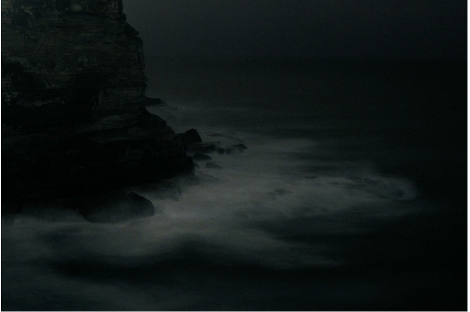
Obscurity , 2014 Photograph 84.1 x 118.9 cm $400 each