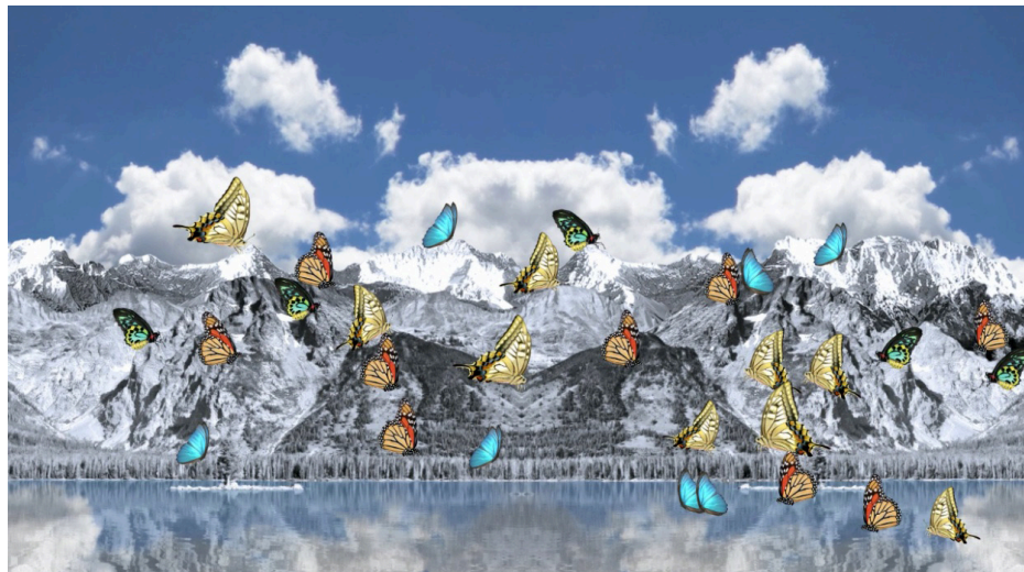
A Sea of Stories , 2014 projected video/animation Edition of 30 $30