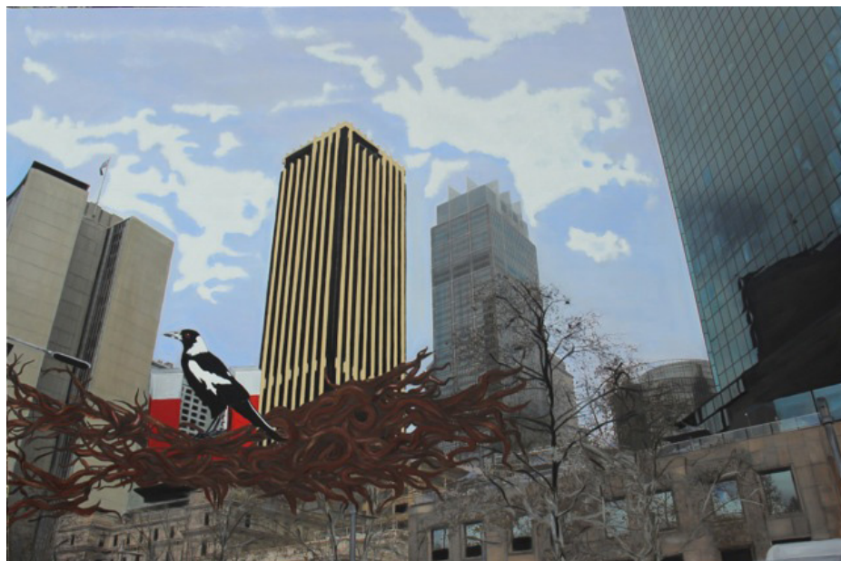
Untitled, The Manufactured Dialect in the World of Reason II, 2014