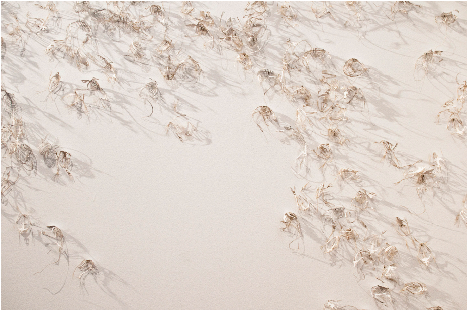
Symptoms (detail view), 2014 paper, site-specific installation 3.5 x 3.6m POA