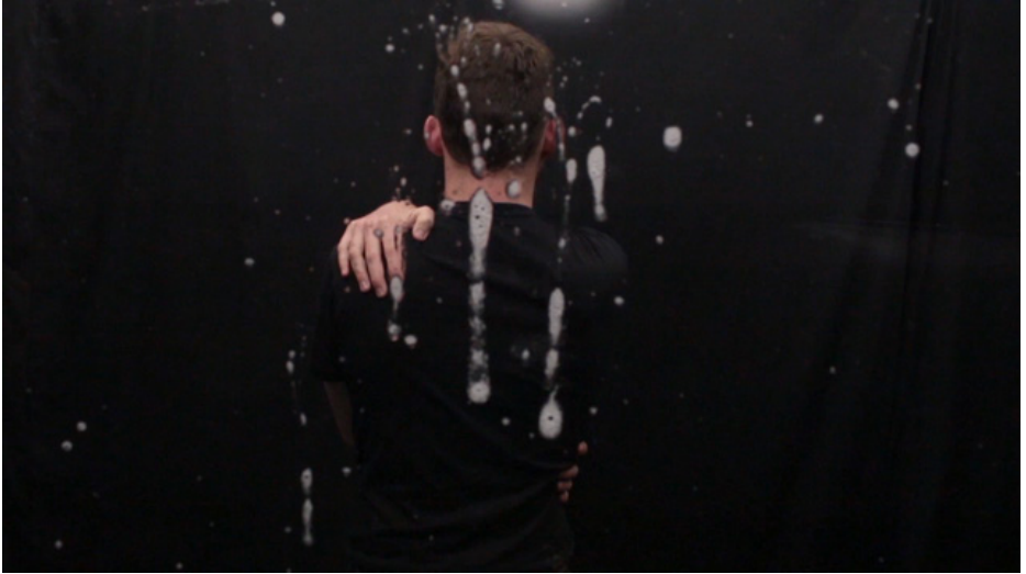
Spit Tips Triptych , 2014 video, multi-channel installation 9 mins 34 secs Edition of 4 $110