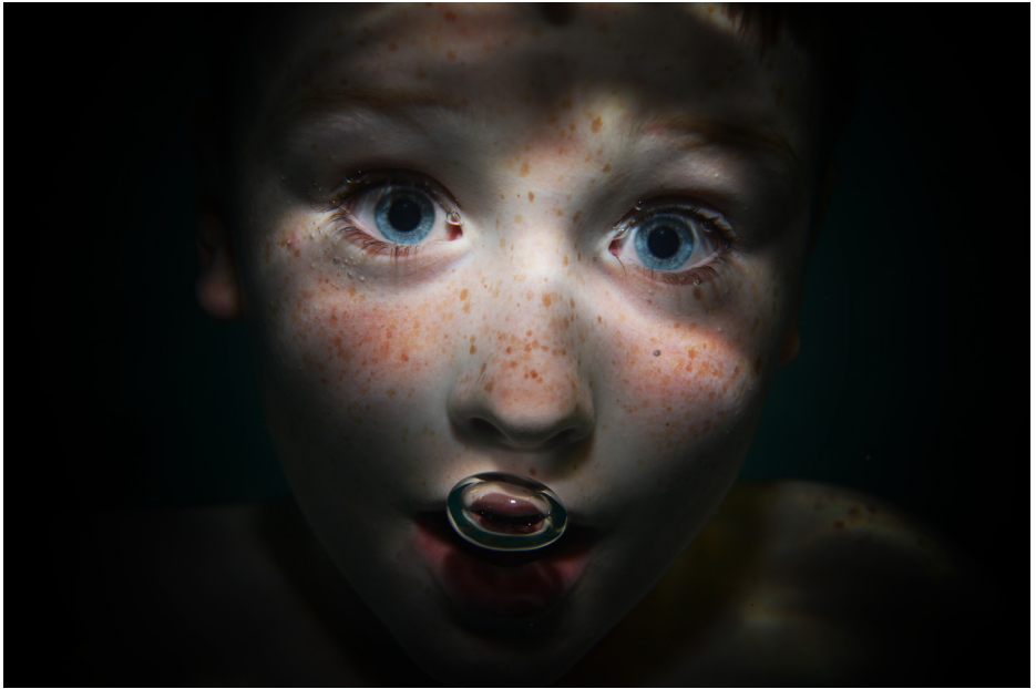
Boy , 2014 Photomedia 3000 x 3000 cm2 $3,000