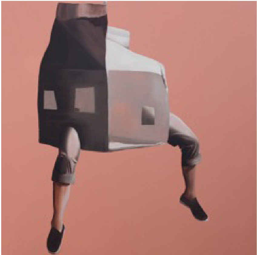
Use by 2030 , 2013 oil on canvas 122 x 122 cm $950