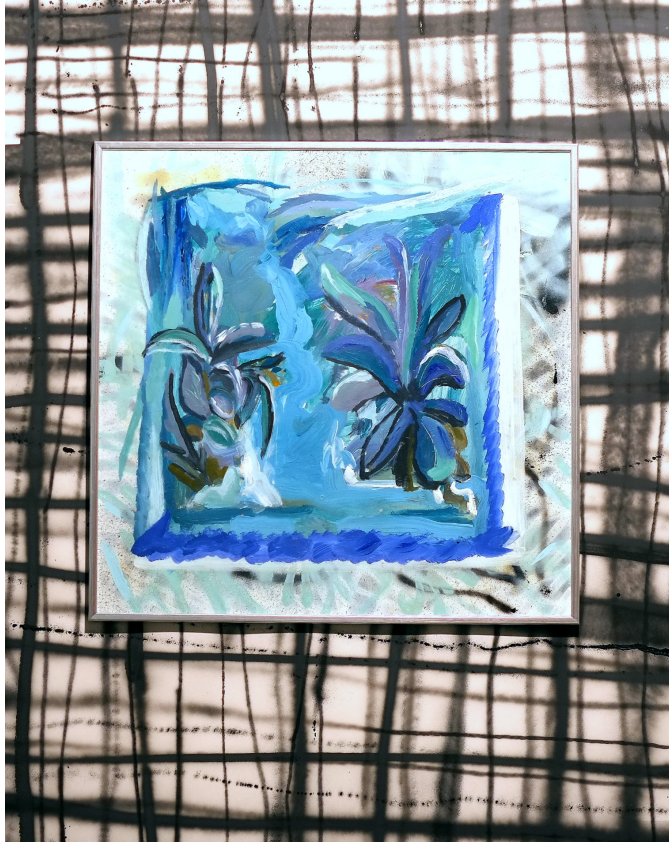
Inset Falls , 2014 acrylic and enamel on board 60 x 60 cm $500