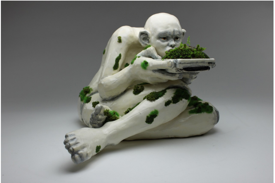
Earth Song , 2014 ceramic, acrylic and dried lichen 60 x 35 x 28 cm $1200