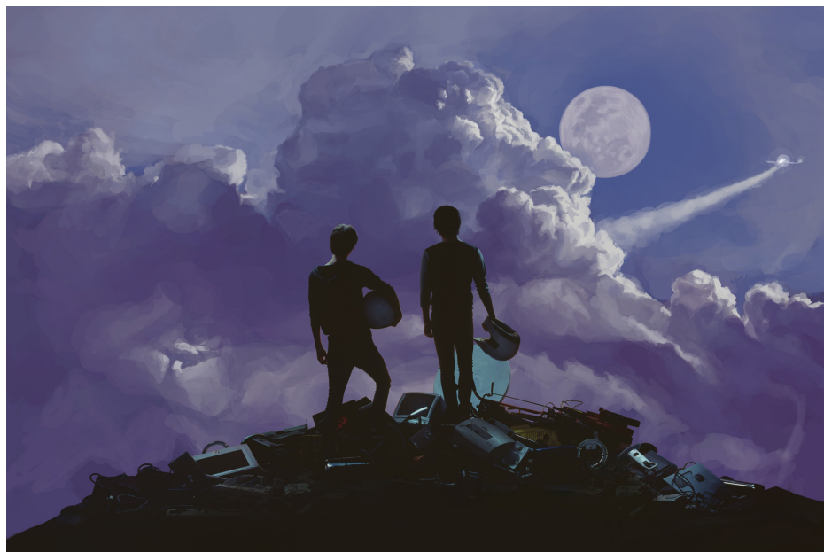
Athanasia , 2014 photography and digital painting 144 x 90 cm $1000