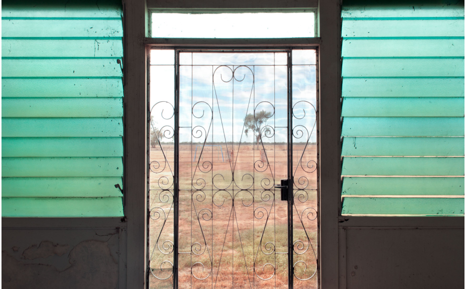
The Other from the series Badlander , 2014 Pigment print dry-mounted on Aluminum Edition of 4 + AP 50 cm x 80 cm $600