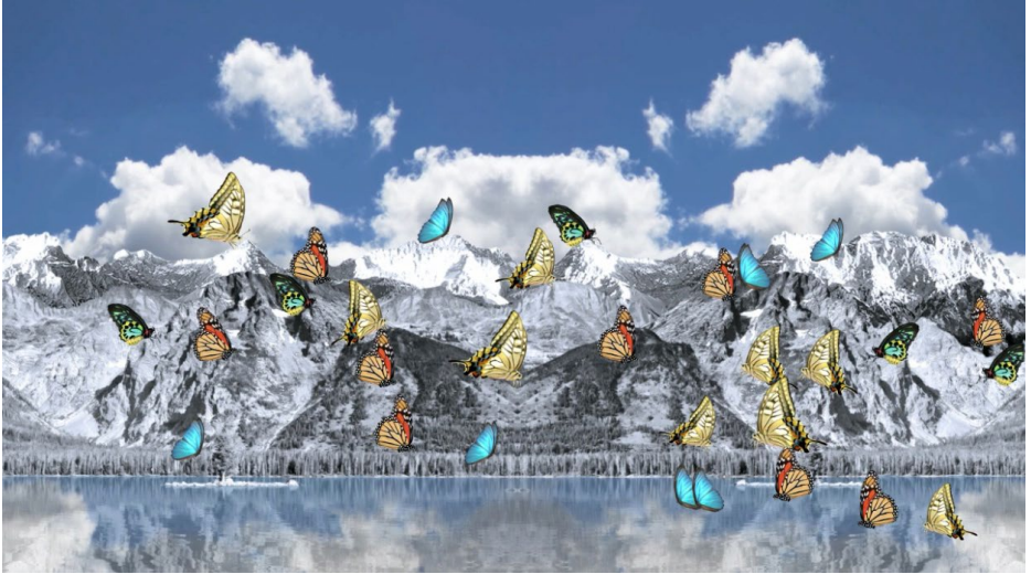
A Sea of Stories , 2014 projected video/animation Edition of 30 $30