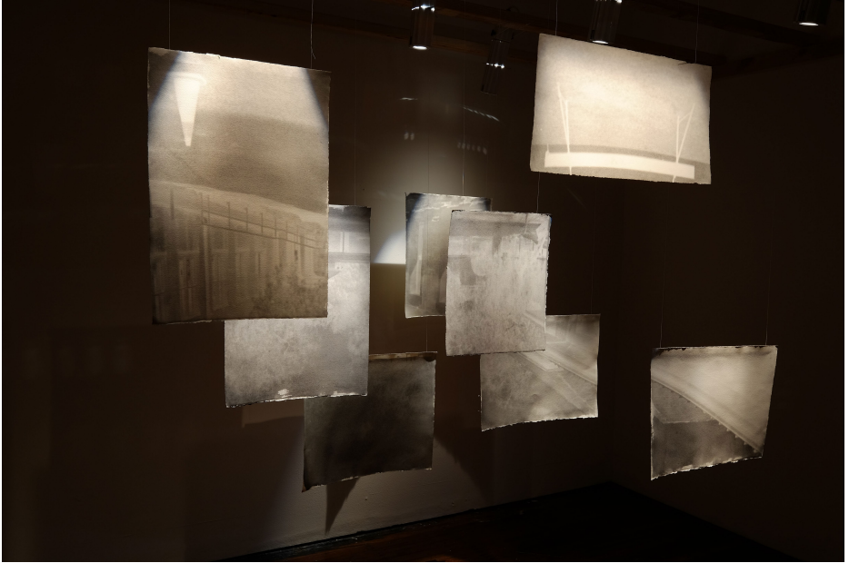
Window View Fragment (#5) , 2014/15 Unique Silver Gelatin print on Arches Velin, 300gsm cotton rag paper. 80cm x 110 cm $1800