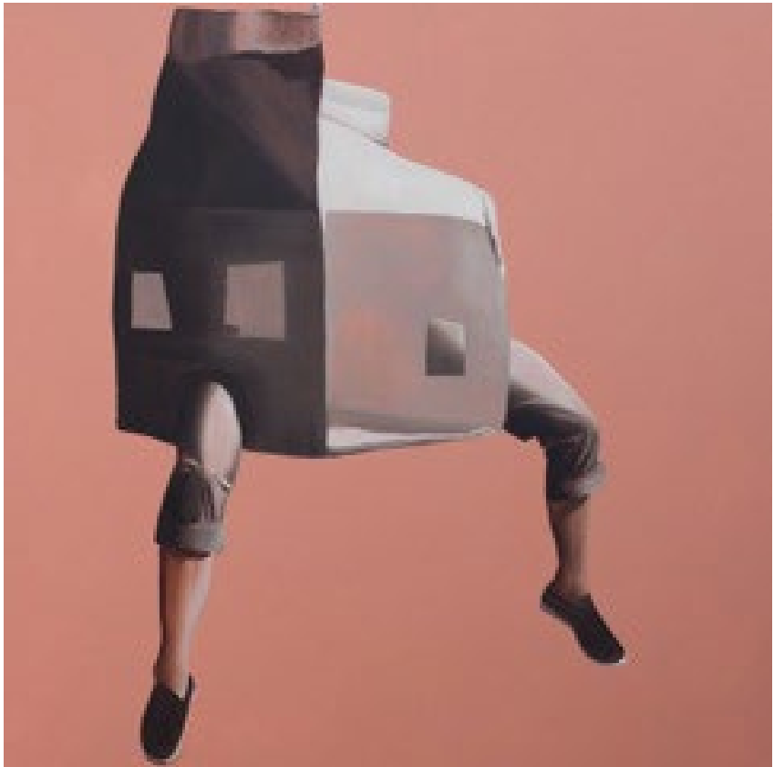
Use by 2030 , 2013 oil on canvas 122 x 122 cm $950