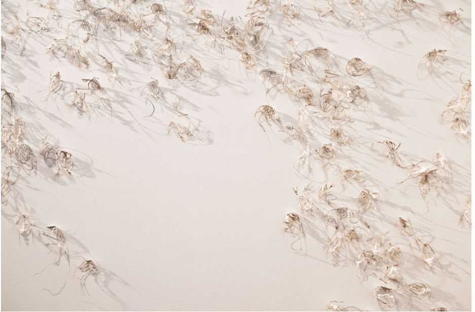
Symptoms (detail view), 2014 paper, site-specific installation 3.5 x 3.6m POA