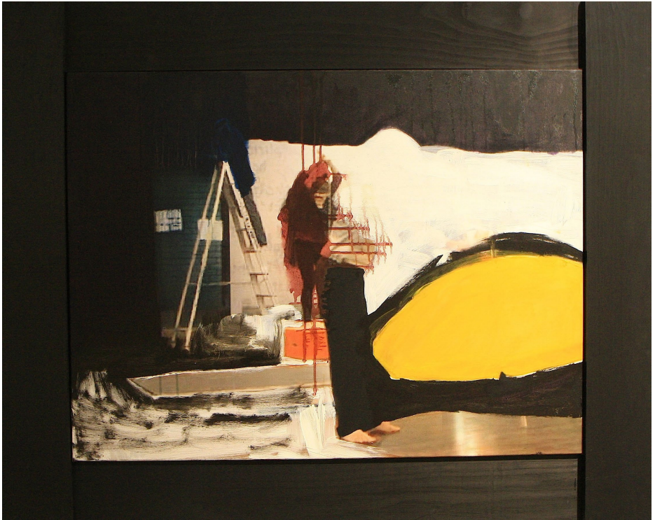
Staging 1 , 2014 oil and acrylic on printed canvas 103 x 128 cm $800