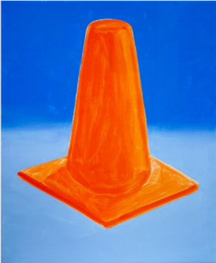
Cone #2 , 2014 oil on canvas 56 x 46,5cm $340