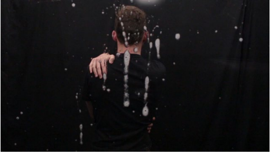
Spit Tips Triptych , 2014 video, multi-channel installation 9 mins 34 secs Edition of 4 $110