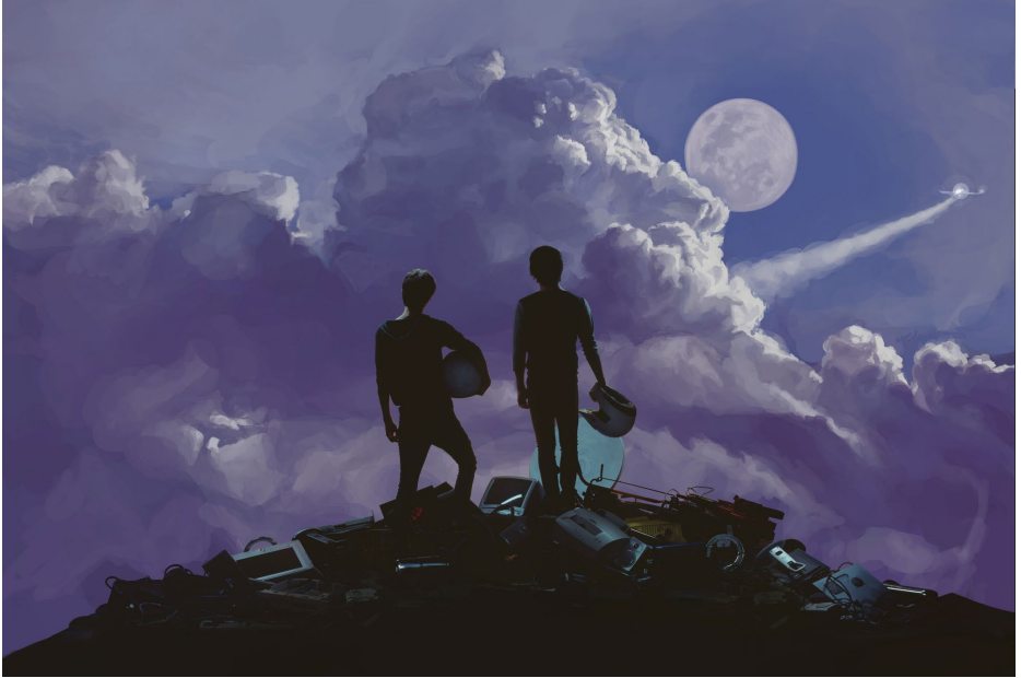
Athanasia , 2014 photography and digital painting 144 x 90 cm $1000