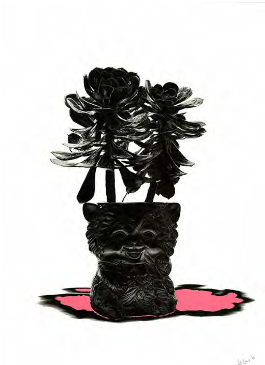
Matt Coyle Pot Cat , 2015 Felt tip pen, coloured pencil, gouache on paper 71 x 52 cm