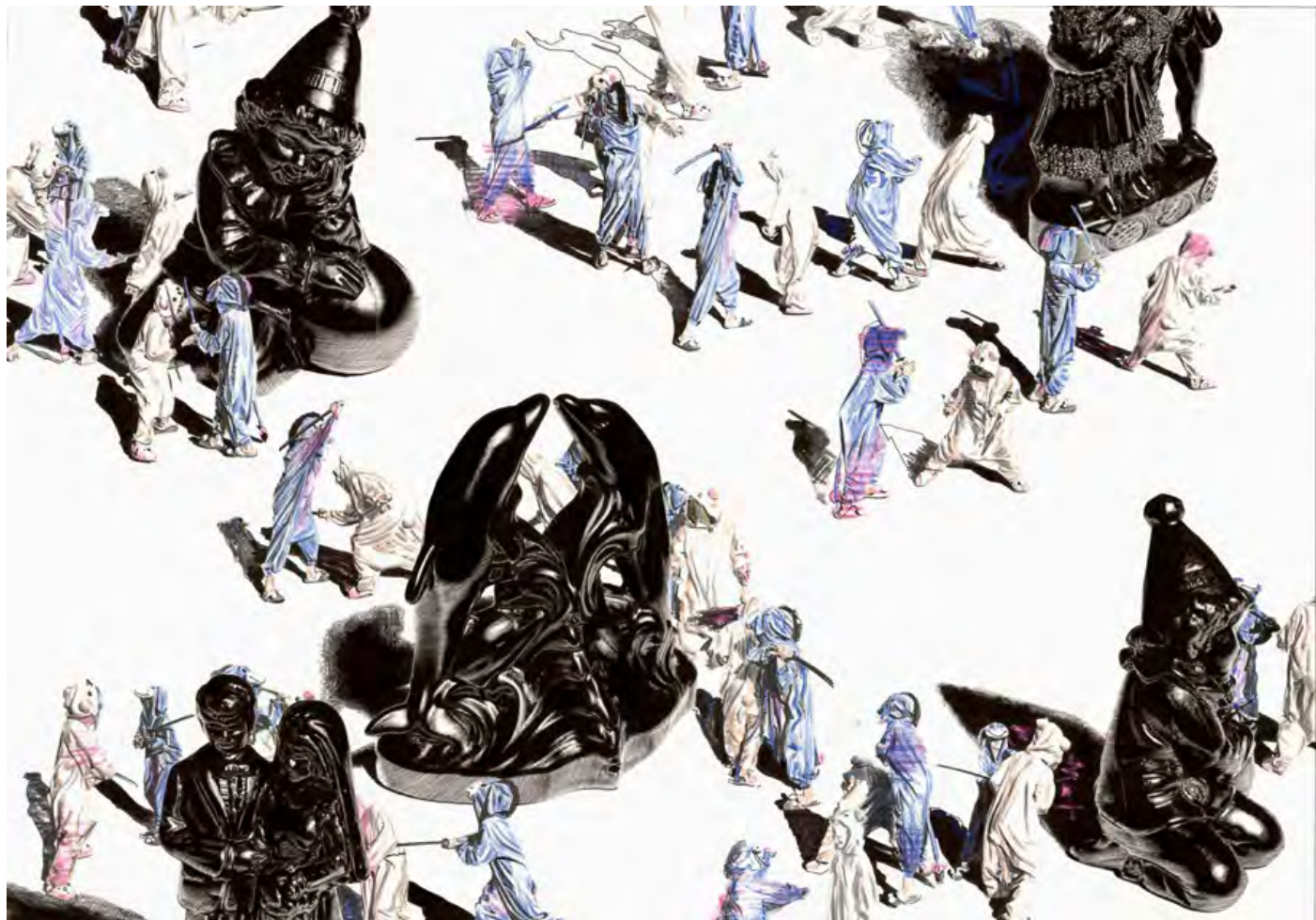
Matt Coyle To the Death (1) , 2014 Felt tip pen, coloured pencil on paper 42 x 60 cm