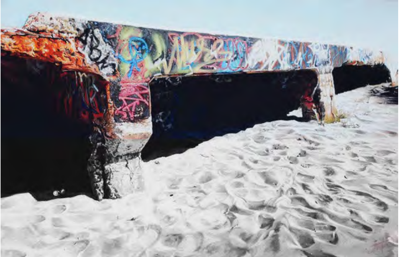
Amber-Rose Hulme Endurance , 2016 Pastel on paper 122 x 84 cm