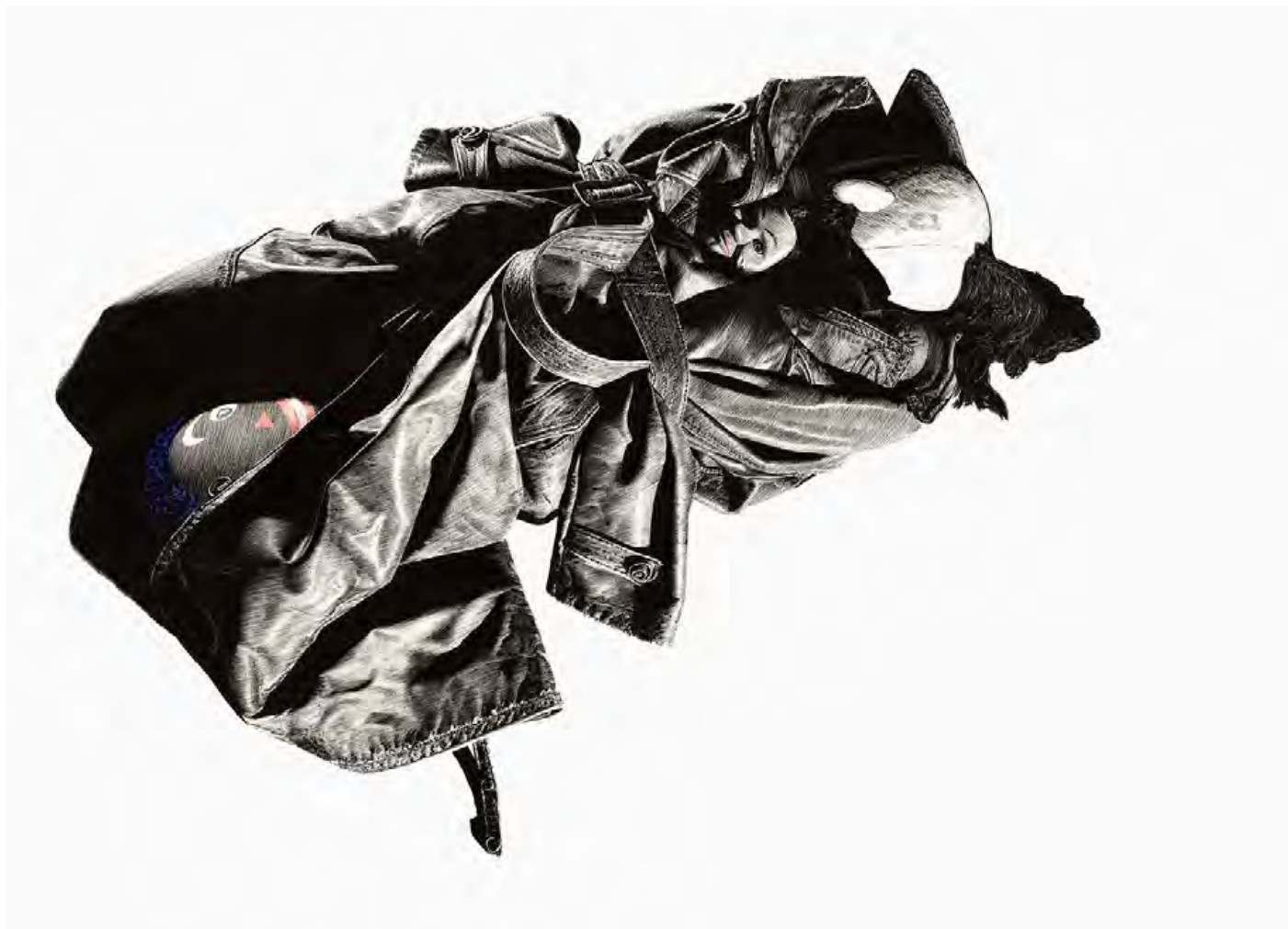
Matt Coyle Get a Wriggle On , 2015 Felt tip pen, coloured pencil on paper 53 x 64 cm