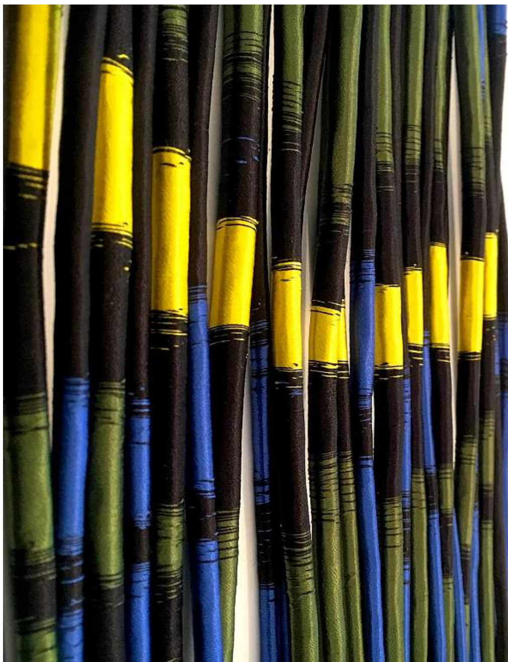
Liron Gilmore Brightness Hidden , 2017 Silk thread and found branches 56 x 31 cm