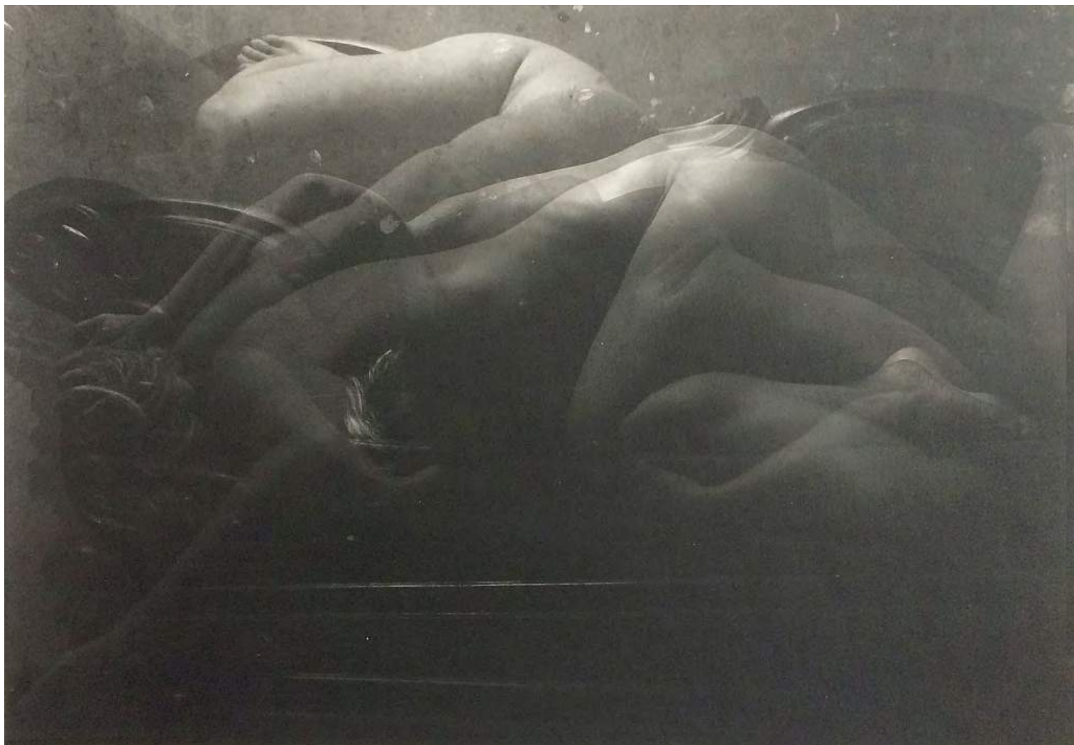
Laura Ellenberger Landscape III , 2017 Archival silver fibre photographic print 24h x 30.40w cm Edition 1/10 (unframed)