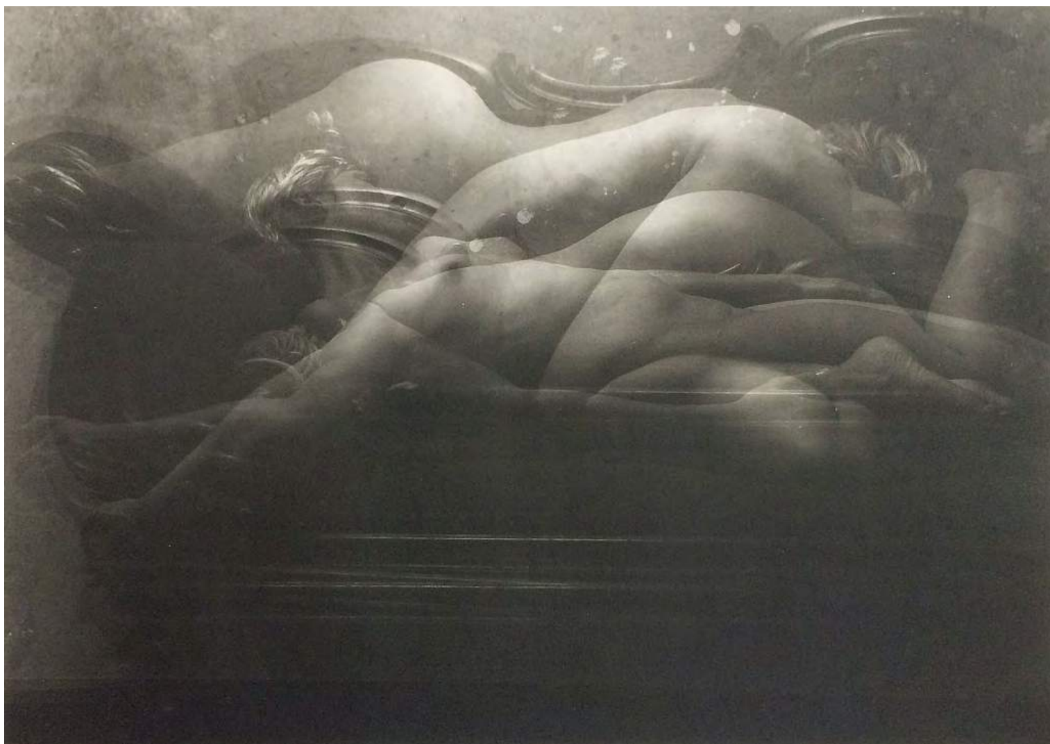
Laura Ellenberger Landscape II , 2017 Archival silver fibre photographic print 24h x 30.40w cm Edition 1/10 (unframed)