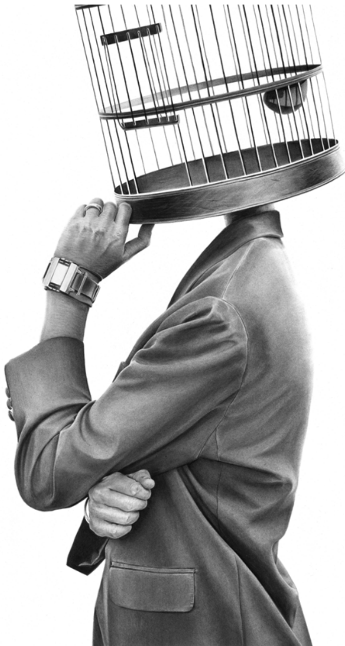
Adam Cusack Inception , 2017 Charcoal on paper 75 x 57 cm