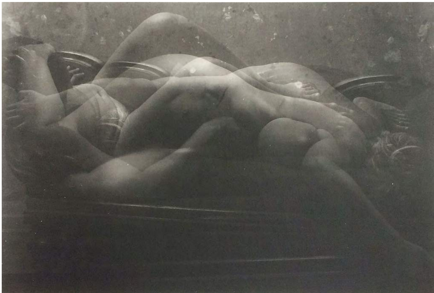
Laura Ellenberger Landscape IV , 2017 Archival silver fibre photographic print 24h x 30.40w cm Edition 1/10 (unframed)