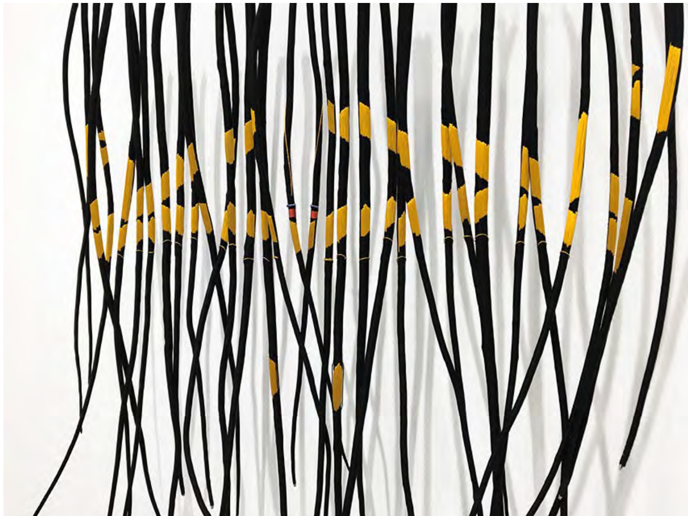
Liron Gilmore Sema , 2016 Silk thread and found branches 100 x 100 cm