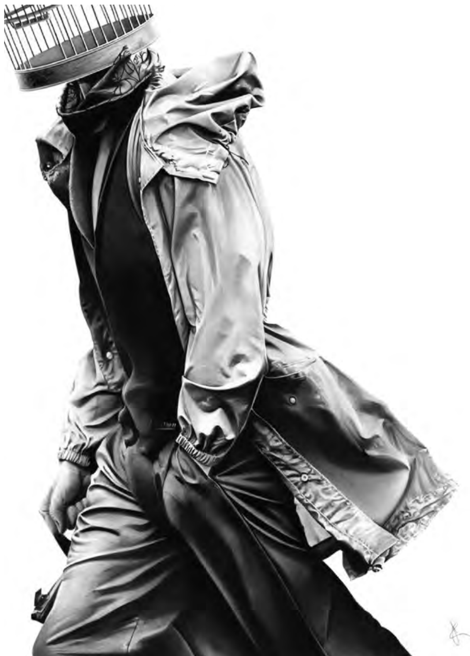
Adam Cusack That's No Way To Leave , 2017 Charcoal on paper 75 x 57 cm