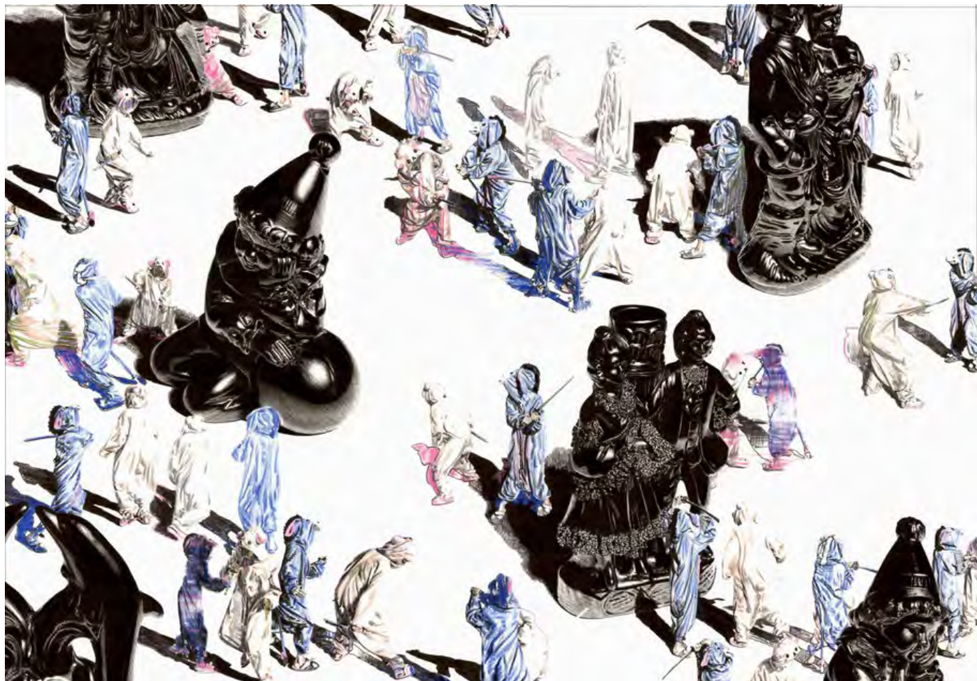
Matt Coyle To the Death (2) , 2014 Felt tip pen, coloured pencil on paper 42 x 60 cm