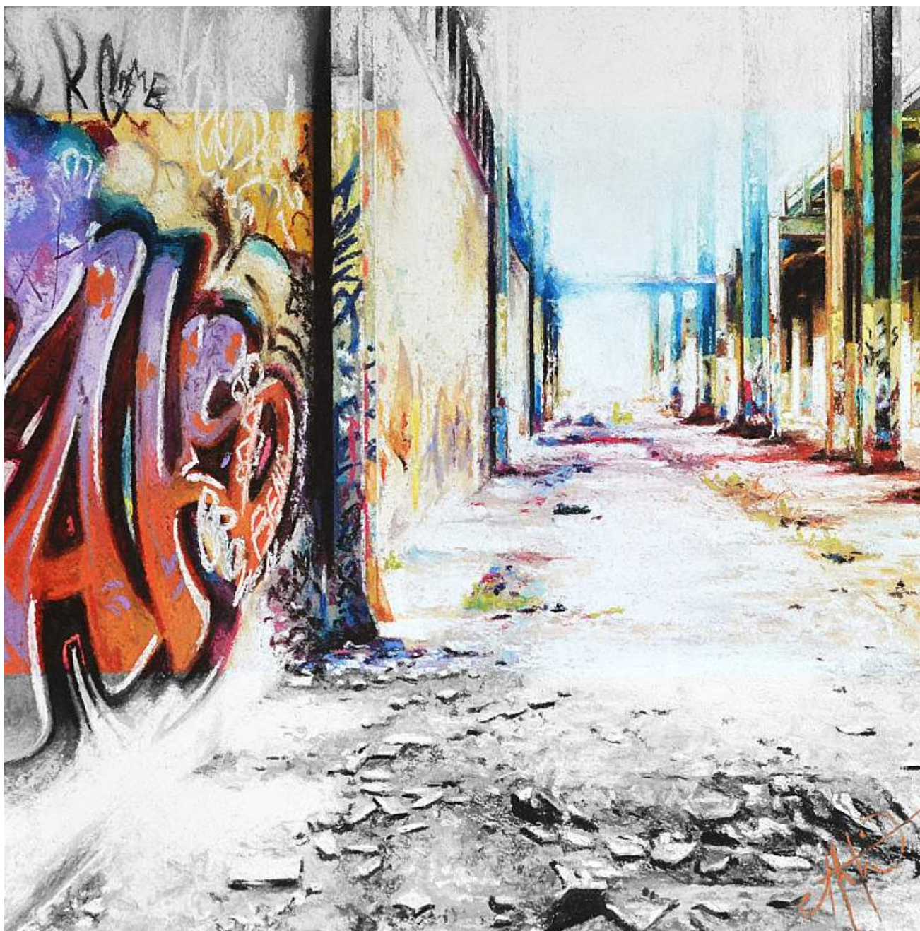
Amber-Rose Hulme Silent , 2017 Pastel on paper 50 x 50 cm