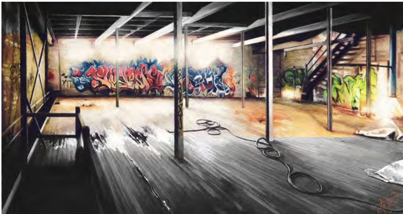
Amber-Rose Hulme Hush , 2017 Pastel on paper 74 x 122 cm