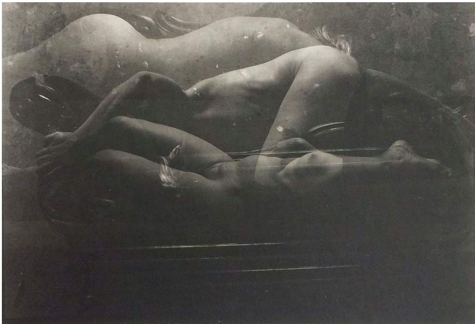
Laura Ellenberger Landscape I , 2017 Archival silver fibre photographic print 24h x 30.40w cm Edition 1/10 (unframed)