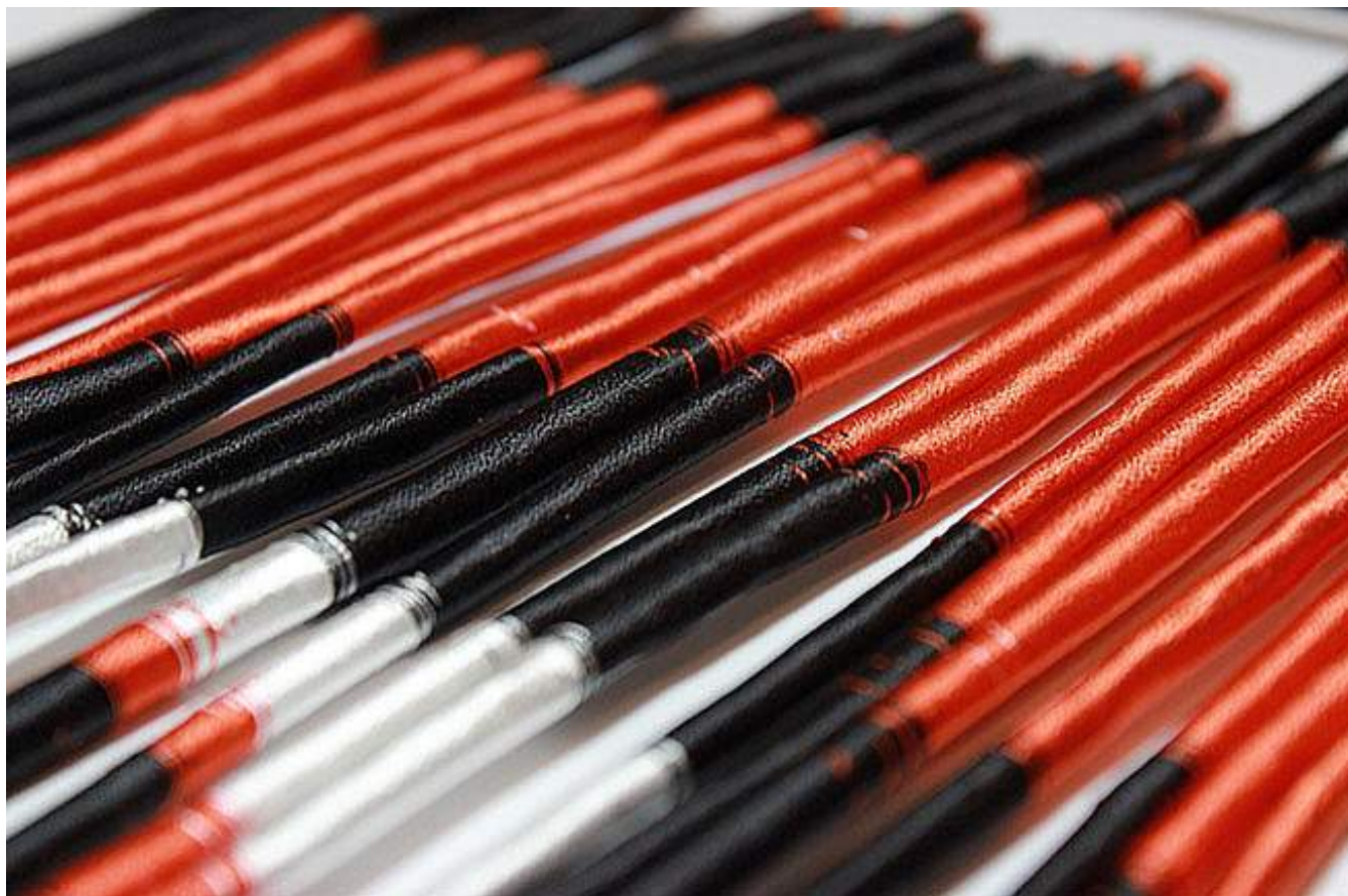
Liron Gilmore Heliconious , 2017 (detail) Silk thread and found branches 30 x 40 cm