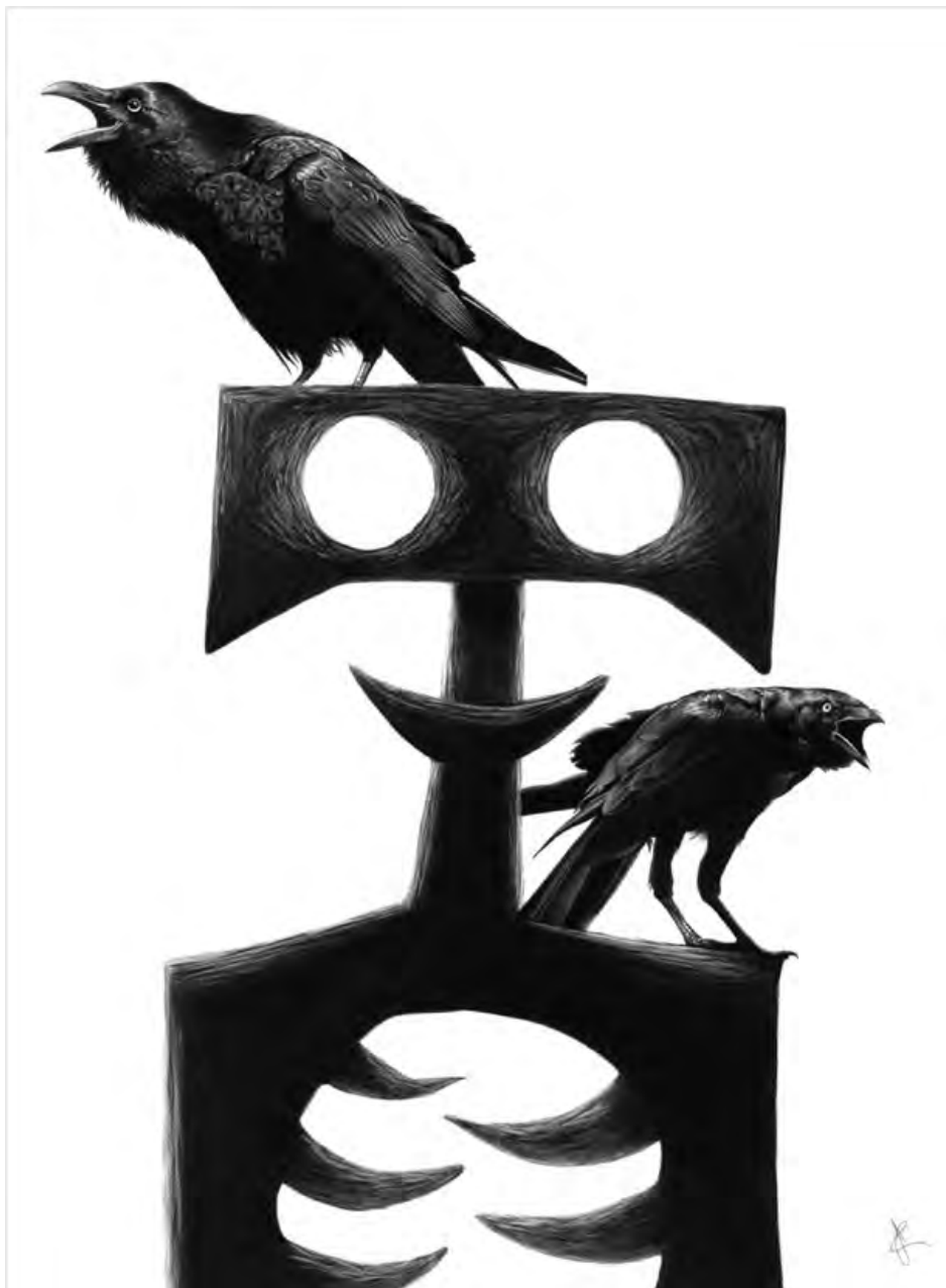
Adam Cusack Intruder Interrupted , 2017 Charcoal on paper 75 x 57 cm