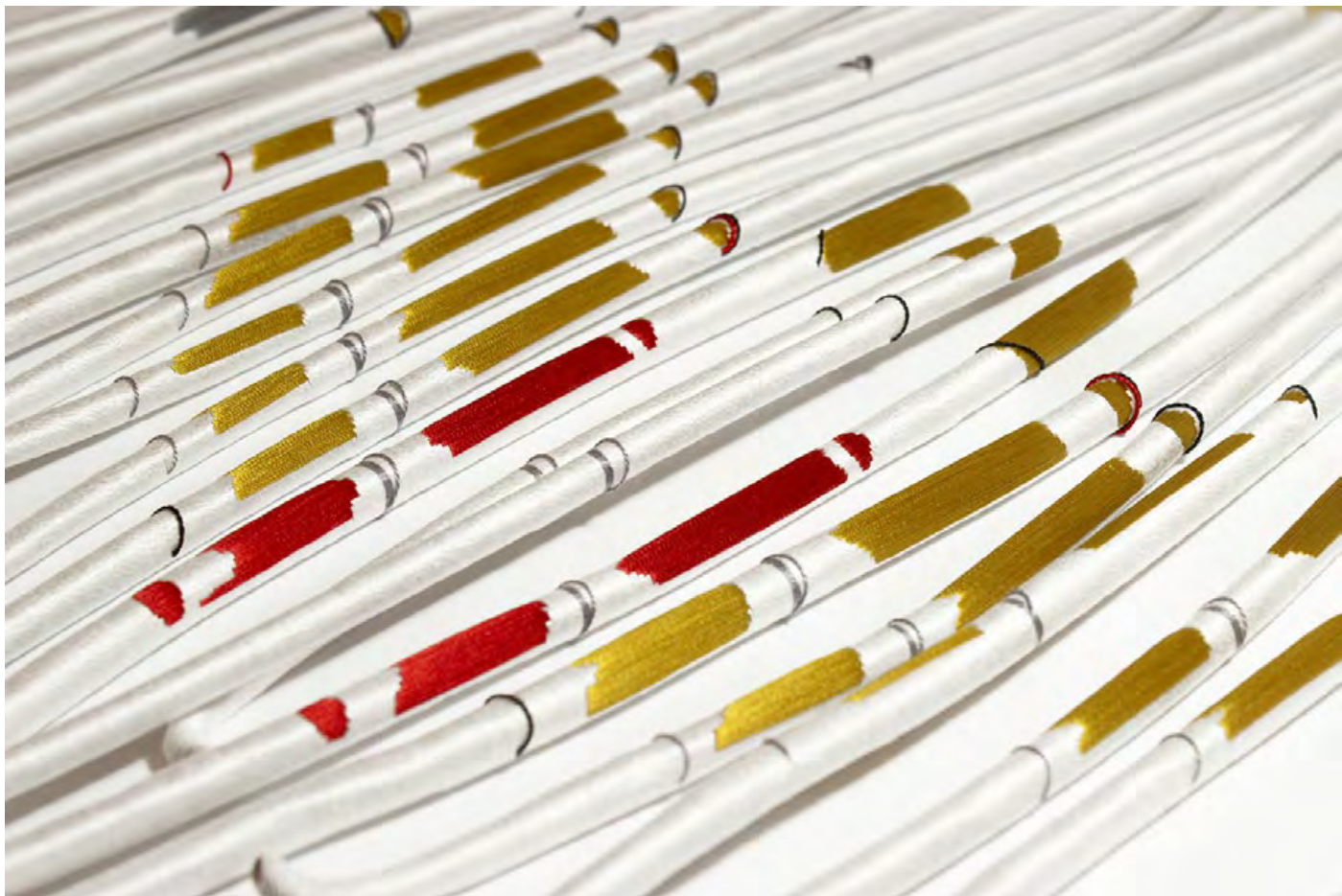
Liron Gilmore Delphi , 2017 Silk thread and found branches 70 x 70 cm