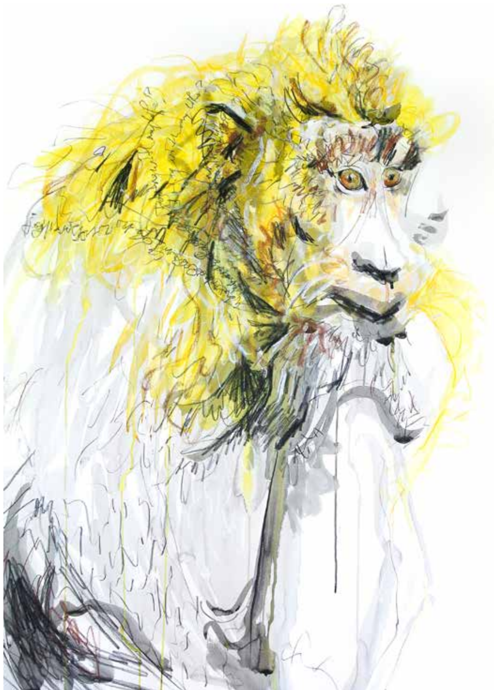
A monkey questions her life choices, 2017 Watercolour, ink and charcoal on paper. 114 x 80 cm