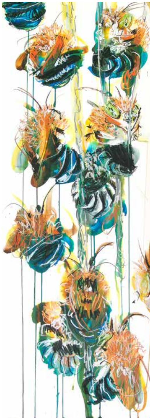
Blue Banded Bees 3 , 2017 Watercolour, ink and charcoal on paper. 114 x 45 cm