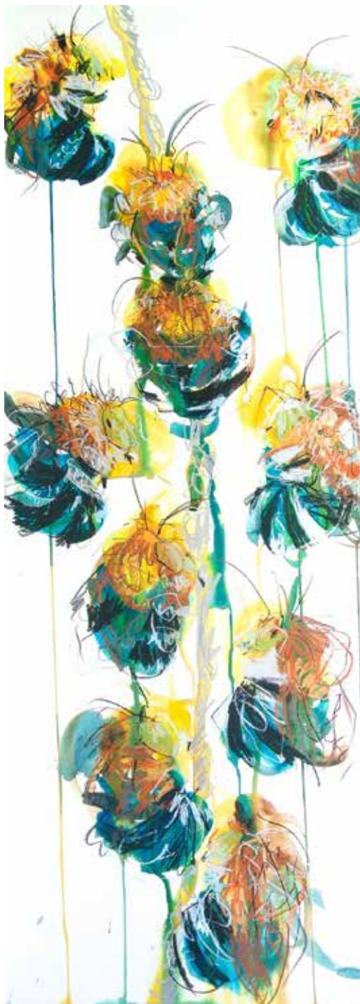
Blue Banded Bees 2, 2017 Watercolour, ink and charcoal on paper. 114 x 45 cm