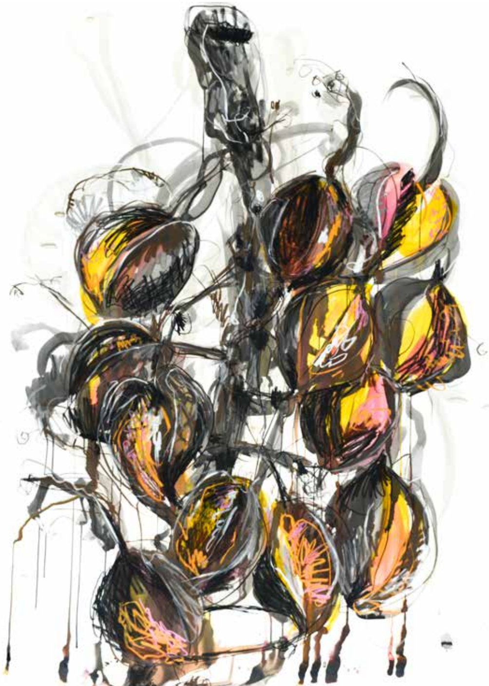
Silky Oak Seed Pods , 2017 Watercolour, ink and charcoal on paper. 150 x 114 cm