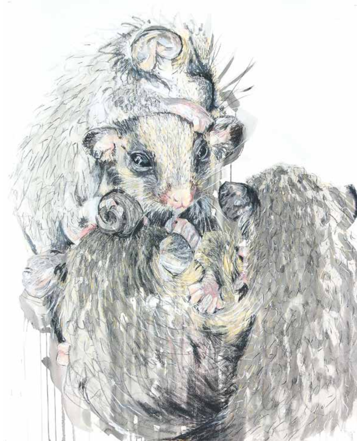
Eastern Pygmy Possums , 2017 Watercolour, ink and charcoal on paper. 136 x 108 cm