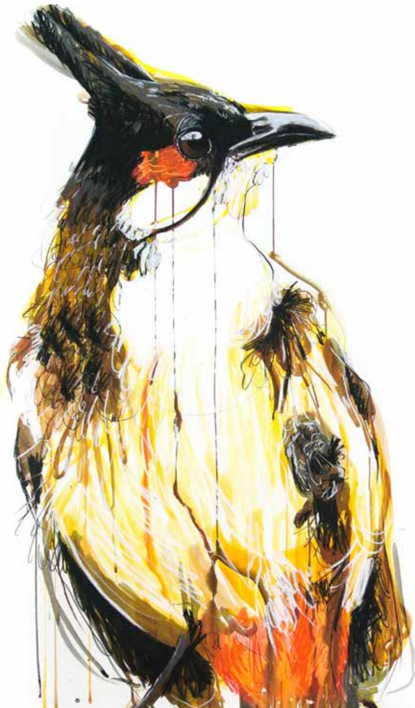
Bul Bul , 2017 Watercolour, ink and charcoal on paper. 120 x 80cm