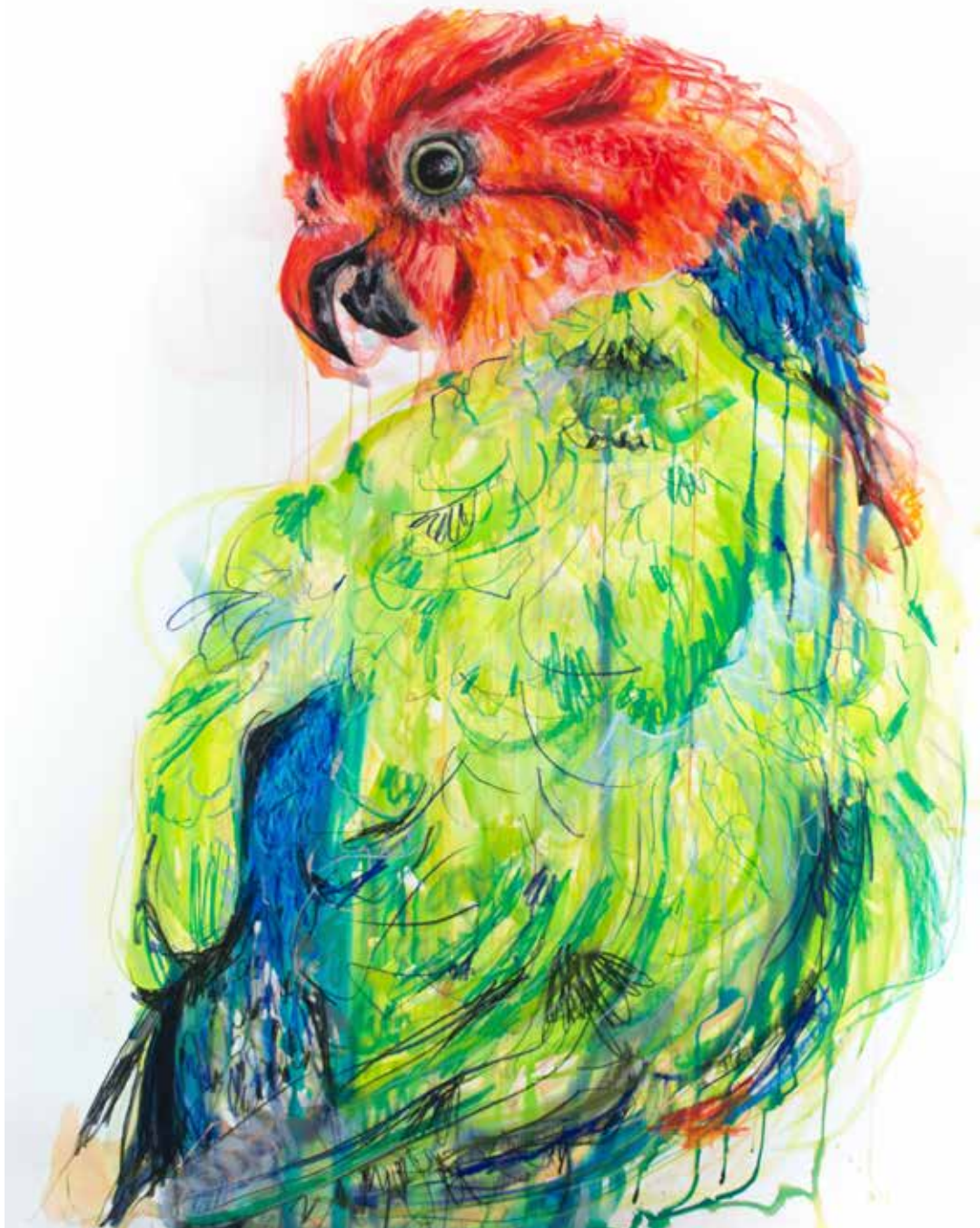
King Parrot , 2017 Watercolour, ink and charcoal on paper. 150 x 114 cm