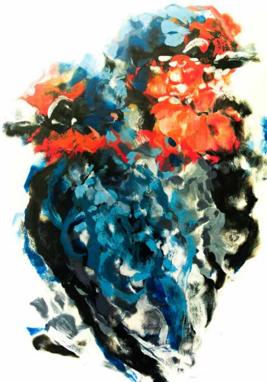
Swallow Couple , 2017 Encaustic wax on mdf, pine cradled 90 x 60 cm