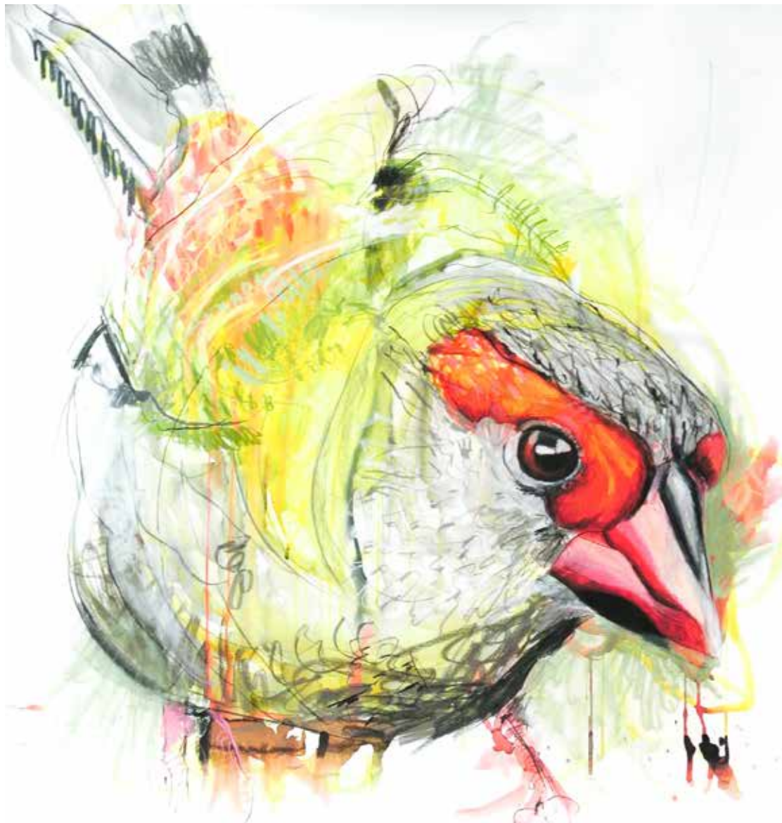
The Lines Between Recognising (Red Browed Finch) 2, 2017 Watercolour, ink and charcoal on paper. 100 x 100 cm