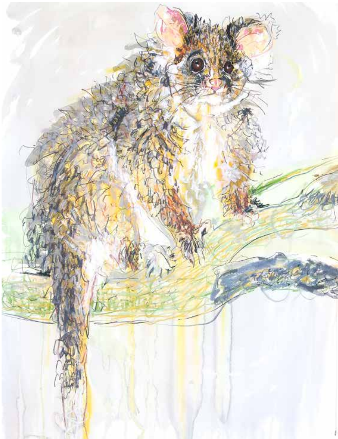
Ringtail Possum , 2017 Watercolour, ink and charcoal on paper 119 x 90 cm