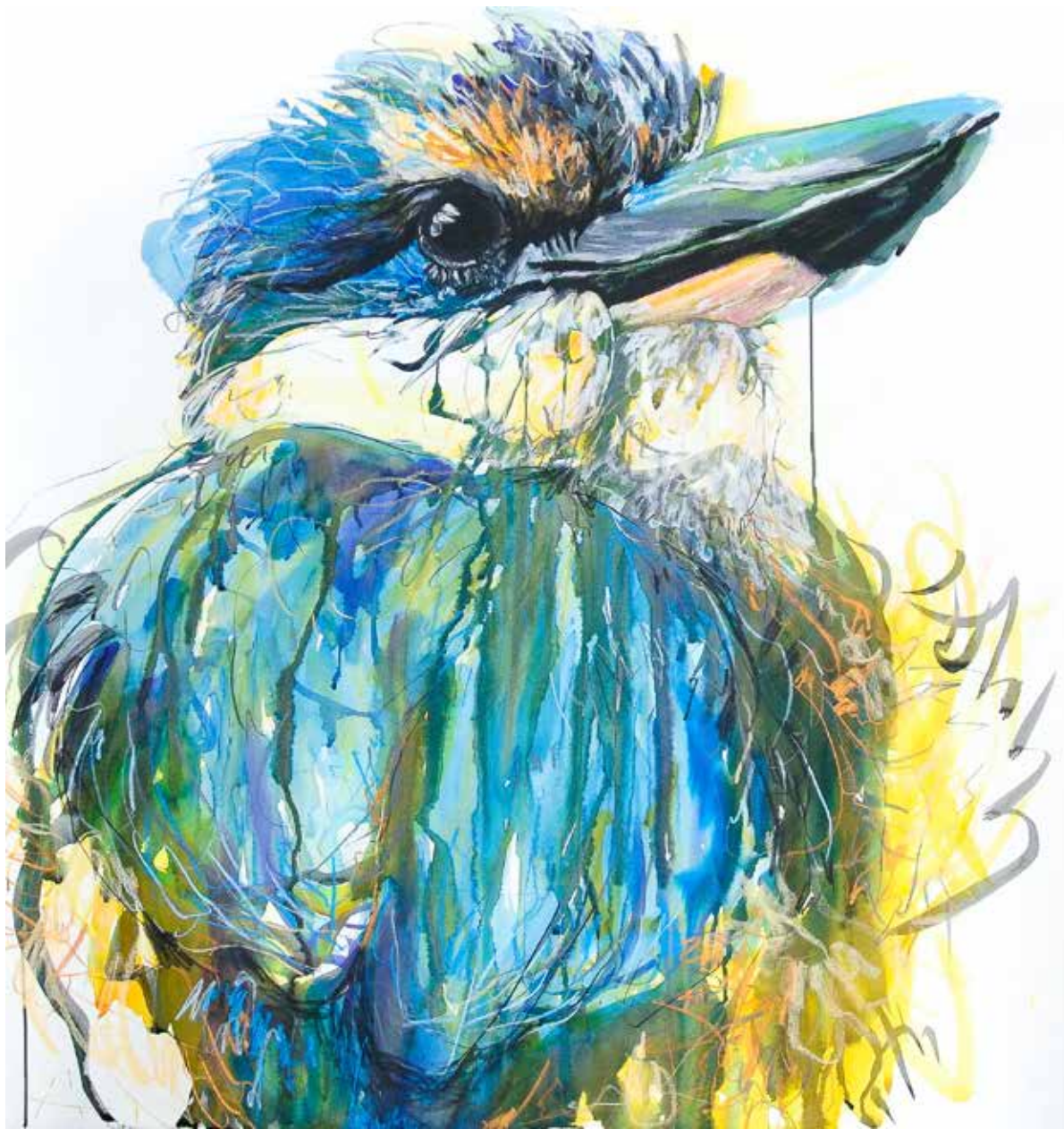
Sacred Kingfisher 2 , 2017 Watercolour, ink and charcoal on paper. 90 x 90 cm