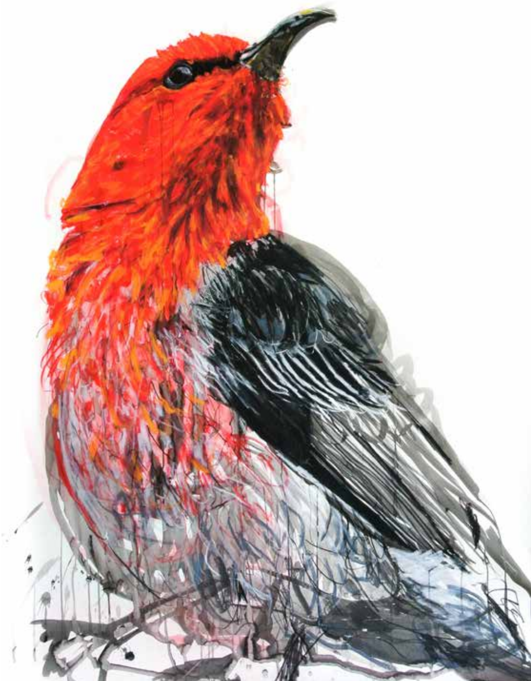
Scarlet Honeyeater , 2017 Watercolour, ink and charcoal on paper. 150 x 114cm