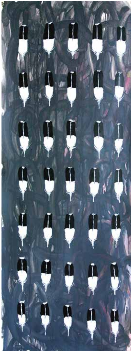
Meditating on Chaos, Infinity and Nature, 2017 Watercolour, ink and acrylic paint on paper. 149 x 57 cm