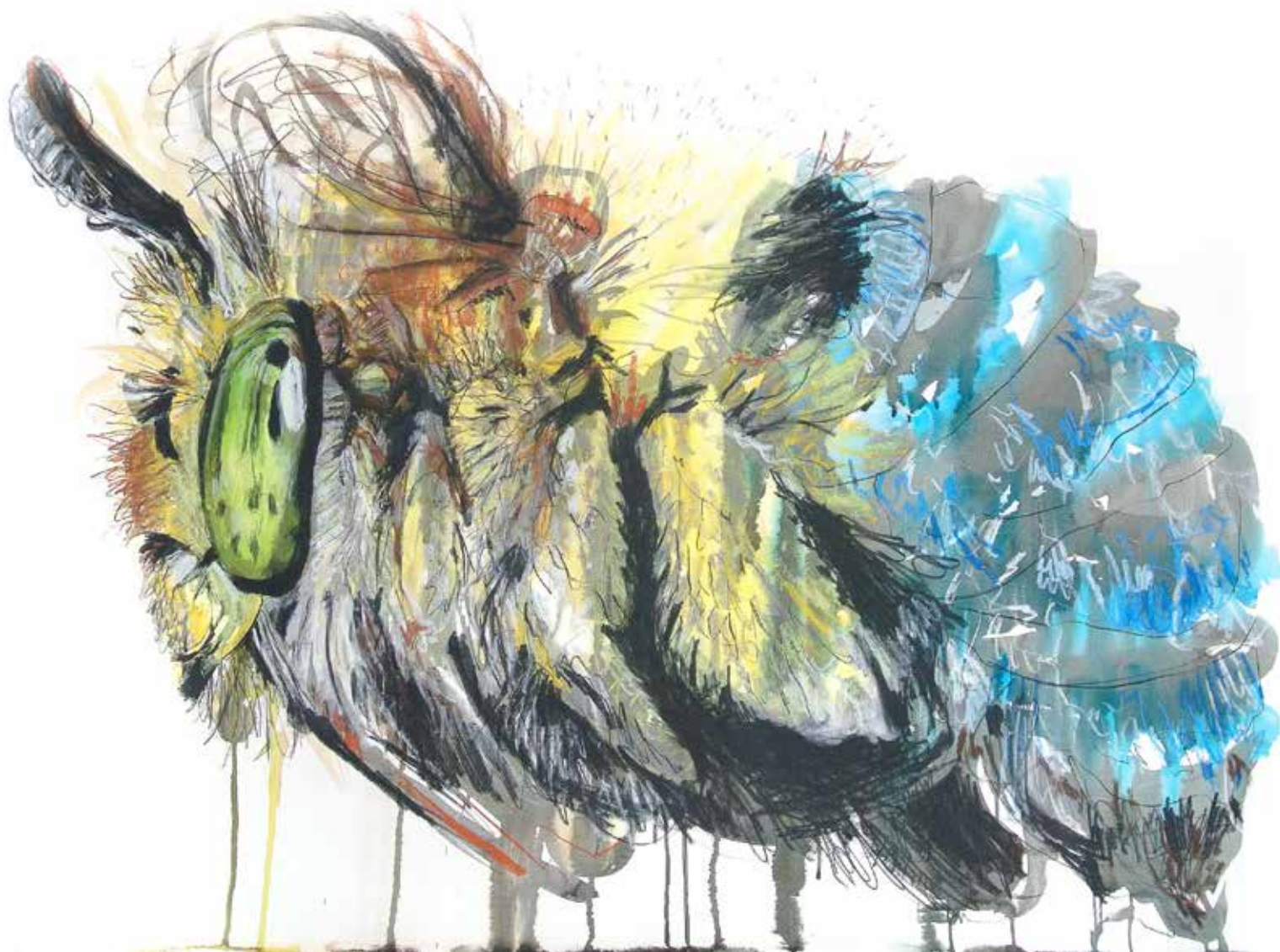
Blue Banded Bee , 2017 Watercolour, ink and charcoal on paper. 81 x 110 cm