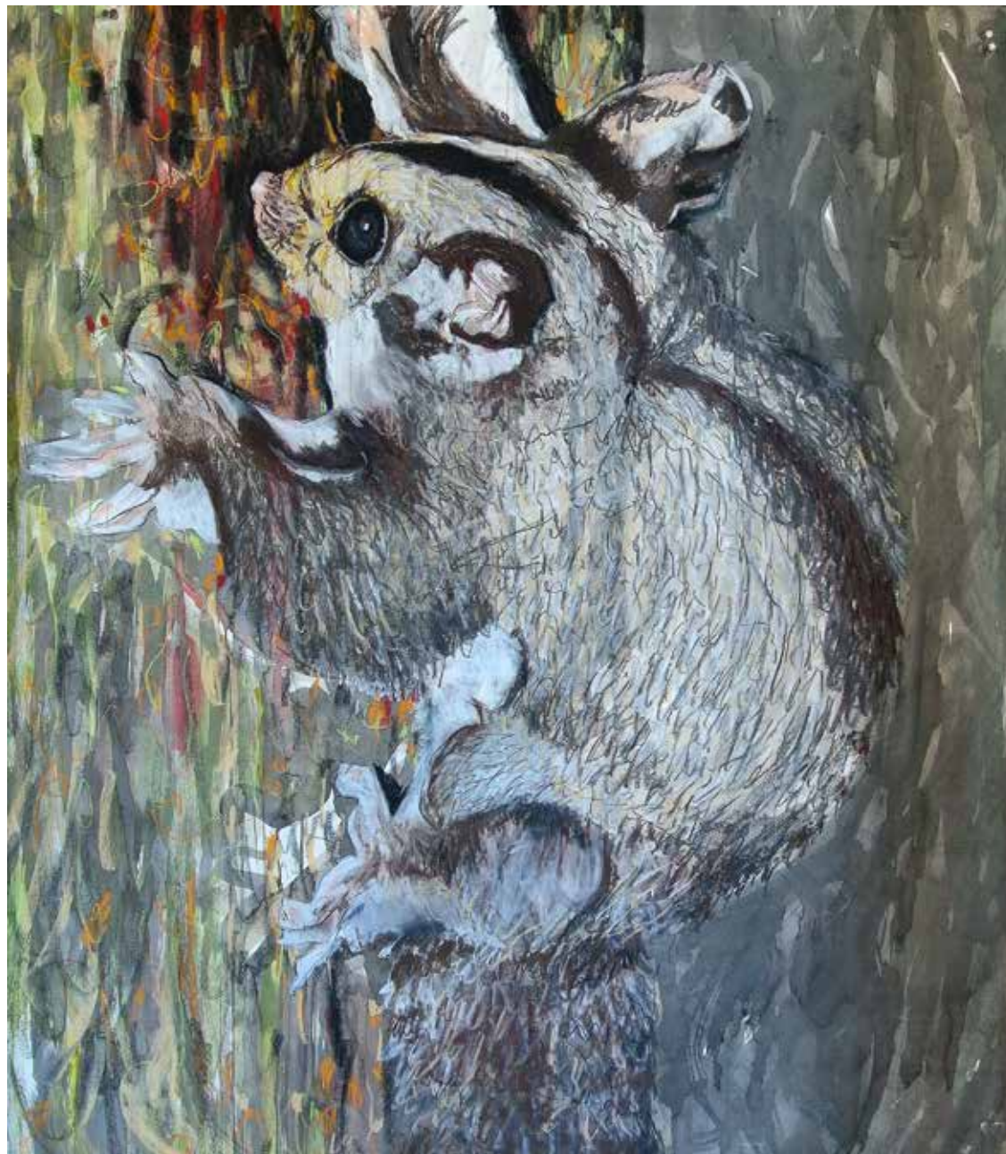
Sugar Glider , 2017 Watercolour, ink and charcoal on paper. 127 x 108 cm