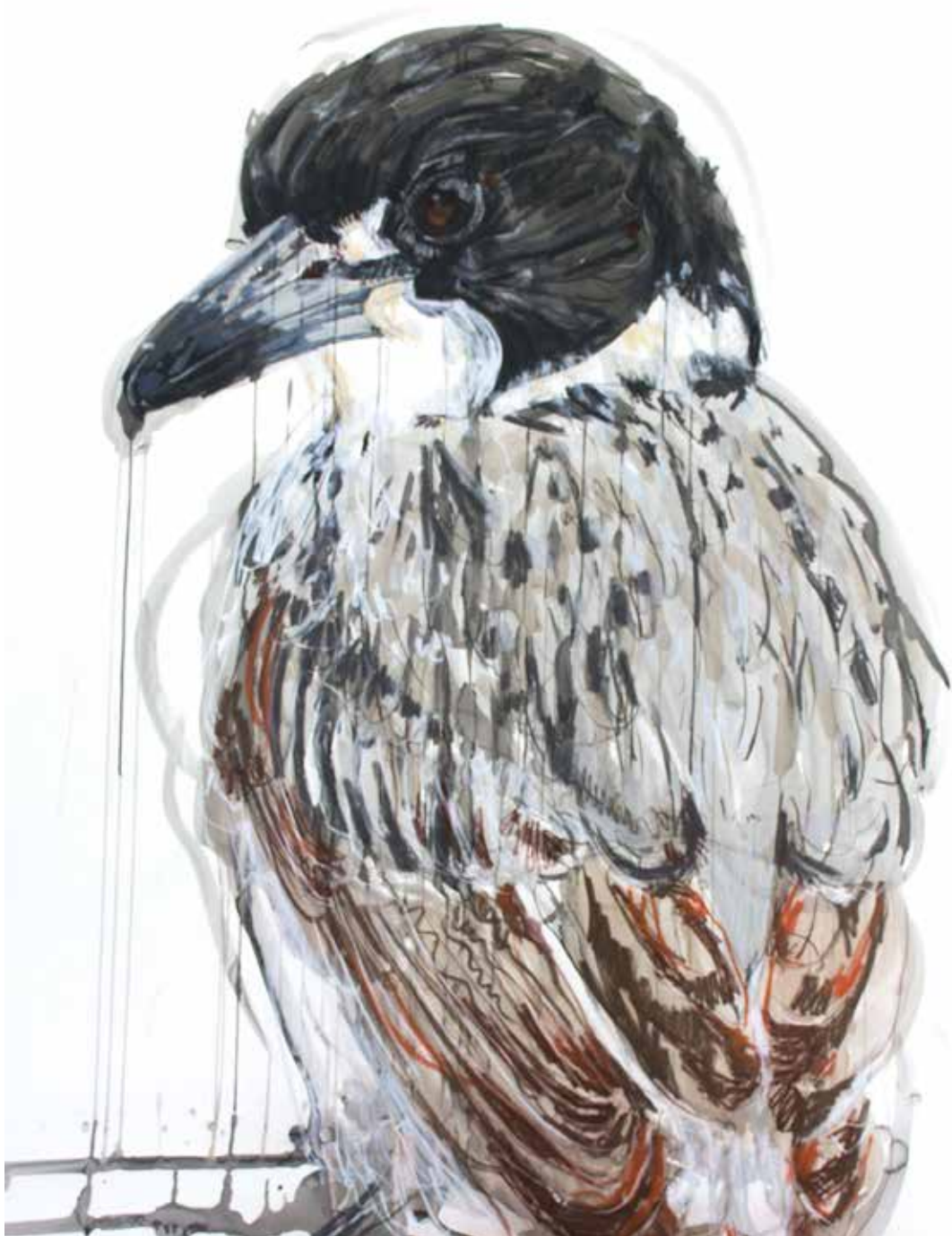
Grey Butcherbird , 2017 Watercolour, ink and charcoal on paper. 150 x 114 cm