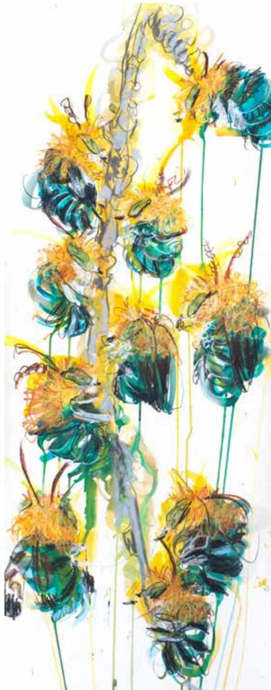
Blue Banded Bees , 2017 Watercolour, ink and charcoal on paper. 114 x 45 cm