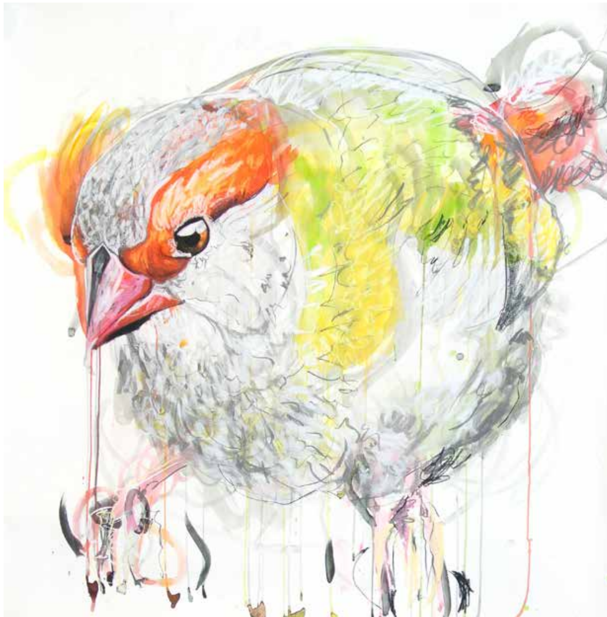
The Lines Between Recognising (Red Browed Finch) 4, 2017 Watercolour, ink and charcoal on paper. 100 x 100 cm