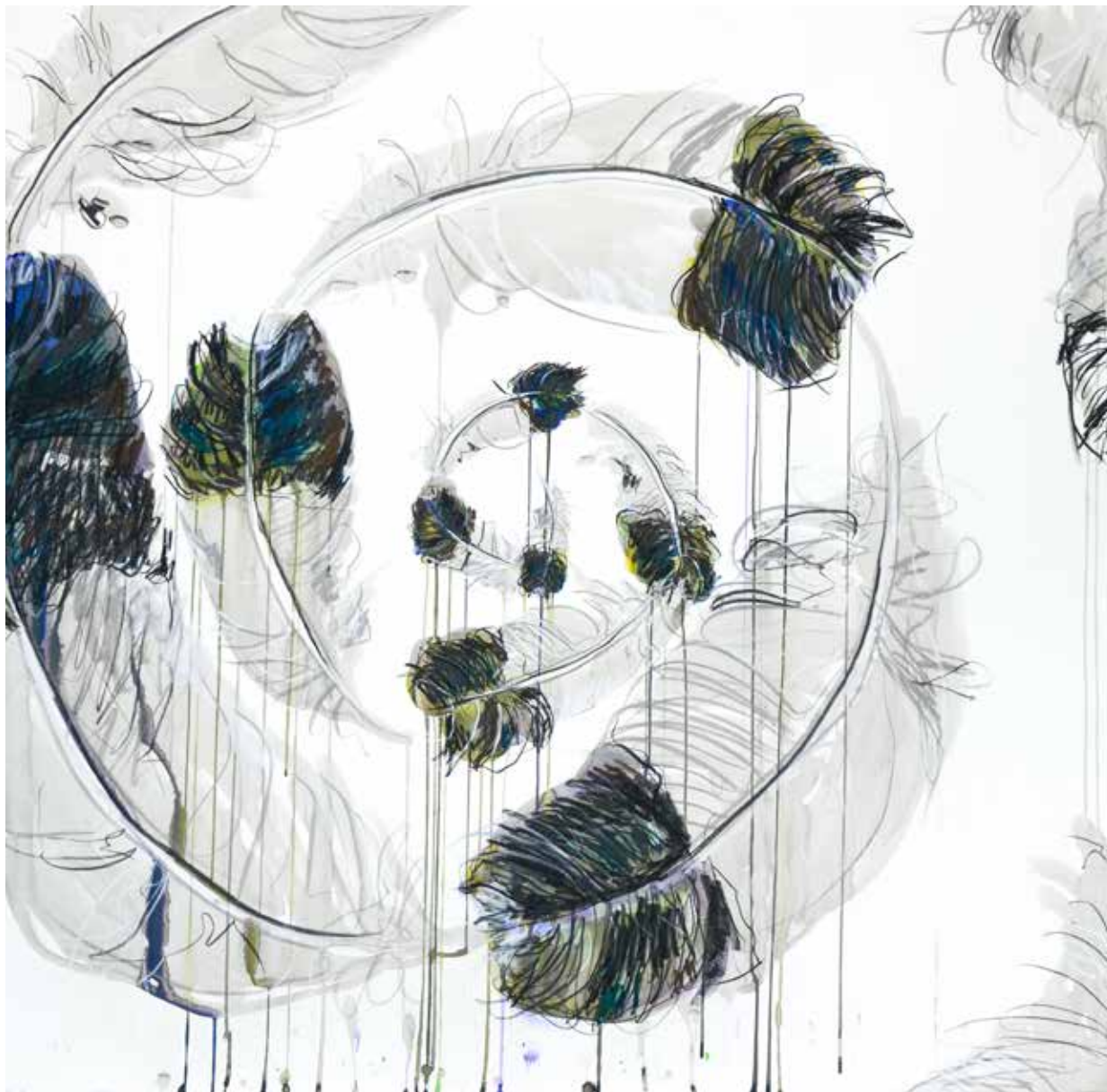
Magpie Feather... , 2017 Watercolour, ink and charcoal on paper. 114 x 114 cm