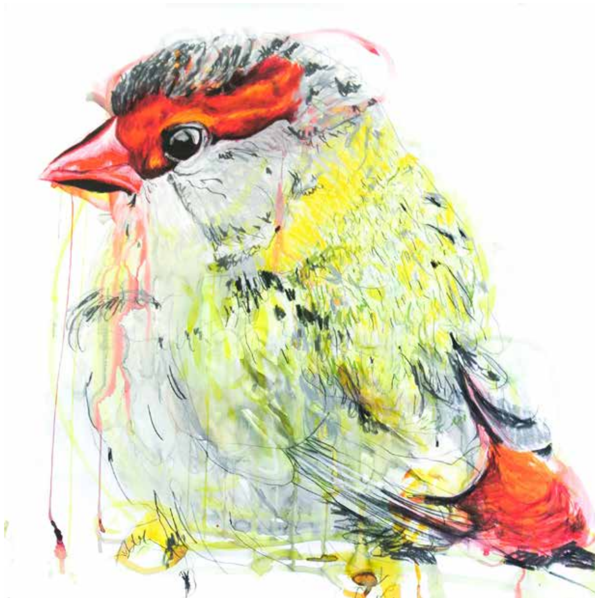
The Lines Between Recognising (Red Browed Finch) 3, 2017 Watercolour, ink and charcoal on paper. 100 x 100 cm