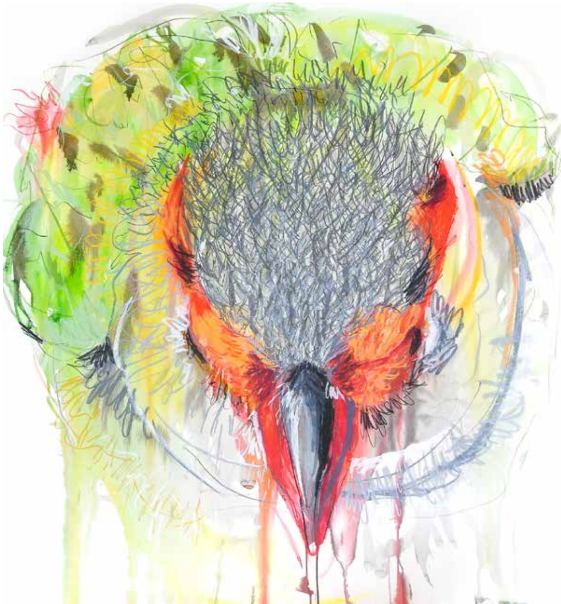
The Lines Between Recognising (Red Browed Finch) 5, 2017 Watercolour, ink and charcoal on paper. 100 x 100 cm