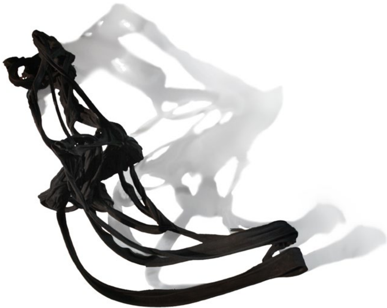
Eloise Cato Raw Artificial XVIII , 2015 Charcoal and Polyethylene