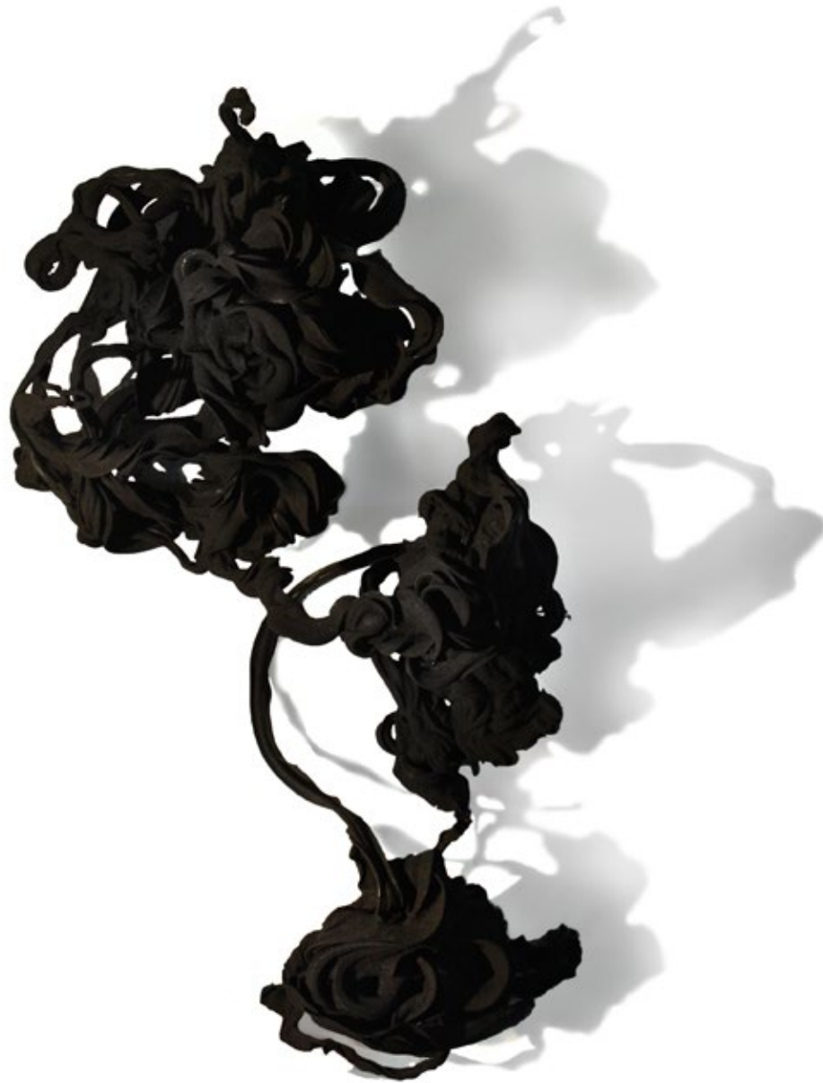
Eloise Cato Raw Artificial XVI , 2015 Charcoal and Polyethylene 54 x 40 cm