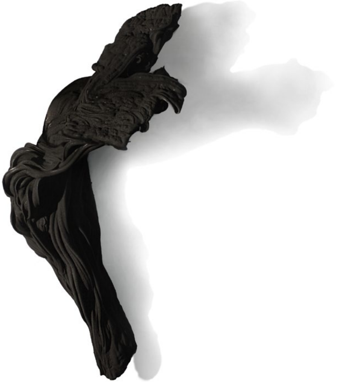
Eloise Cato Raw Artificial XVII , 2015 Charcoal and Polyethylene 35 x 42 cm