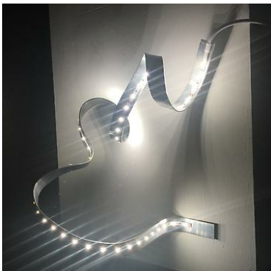
Aly Indermuhle Waves (small work series), 2016 Led lights