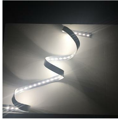
Aly Indermuhle Scar (small work series), 2016 Led lights