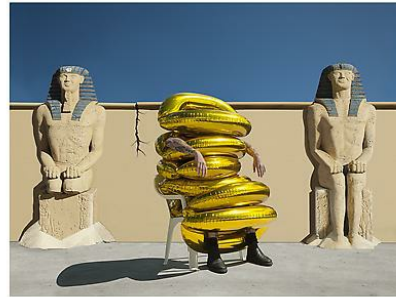
Gerwyn Davies Pyramid (ed 1/5) Fine Art Photograph 80 x 105 cm