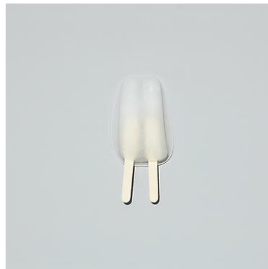
Simone Rosenbauer LA Like Ice In The Sunshine #47 (1/8), 2016 Fine Art Pigment Print 85 x 85 cm 1/8