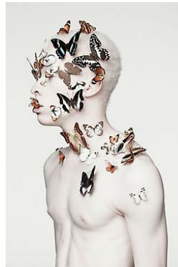
Justin Dingwall Mob I photographic print 84 x 60 cm 2/10