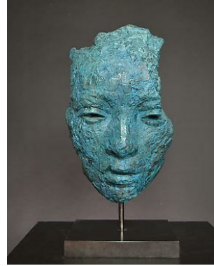
Lionel Smit Origins Broken Fragment V , 2015 Bronze 54 x 31 x 31 cm 1 of 6