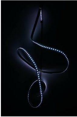
Aly Indermuhle Cirrus (sky blue to soft sunset cloud orange), 2016 Led lights 100 x 45 x 40 cm