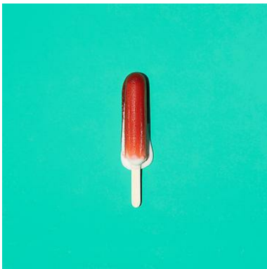
Simone Rosenbauer LA Like Ice In The Sunshine #49 (1/8), 2016 Fine Art Pigment Print 85 x 85 cm 1/8