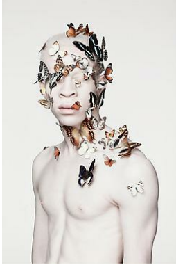
Justin Dingwall Mob II photographic print 84 x 60 cm 4/10