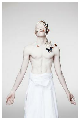
Justin Dingwall Liberty II photographic print 84 x 60 cm 4/10