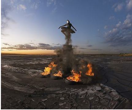
Jeremy Blincoe Trying to find a balance Lightbox 100 x 130 cm