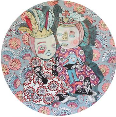
Marna Hattingh Ocean, 2015 Pigment ink, acrylic and gouache on paper 74 x 74 cm