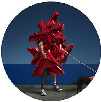
Gerwyn Davies Puppy (ed 1/5) Fine Art Photograph 100 x 100 cm