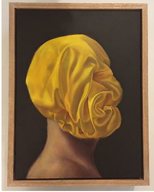
Luke Thurgate The Recruit II , 2016 Oil on board 27 x 20 cm