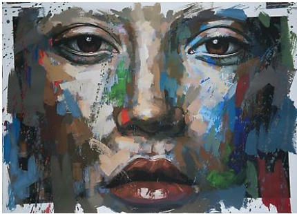
Lionel Smit Fragmented Stare , 2014 digital print on archival paper 86 x 61 cm 10 of 12