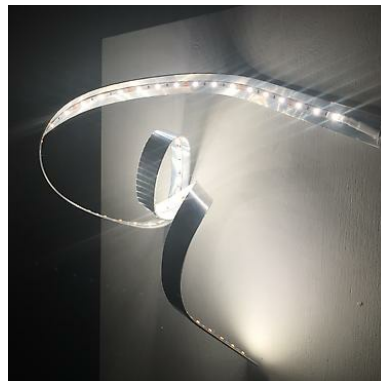
Aly Indermuhle Bliss (small work series), 2016 Led lights