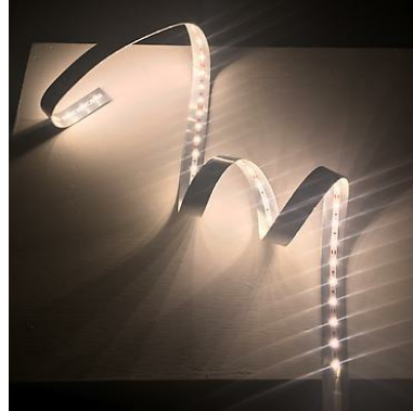
Aly Indermuhle Untitled (small work series), 2016 Led lights