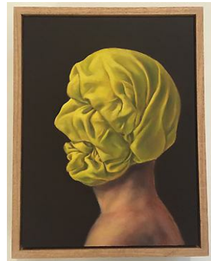
Luke Thurgate The Recruit , 2016 Oil on board 27 x 20 cm