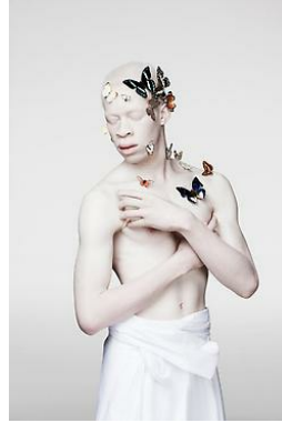
Justin Dingwall Liberty III photographic print 84 x 60 cm 4/10