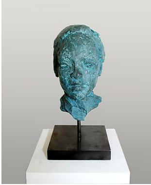
Lionel Smit Origins Broken Fragment O , 2015 Bronze 46 x 25 x 27 cm 1 of 6