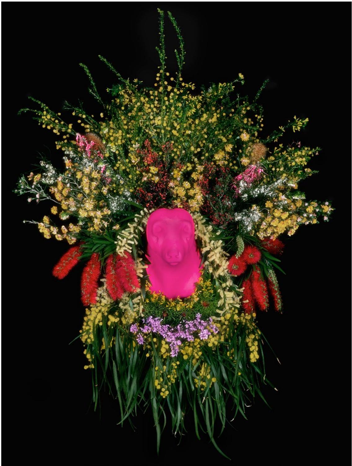
Dingo Cartouche , 2011 Pigment Print 100 x 130 cm edition of 5 + 1AP