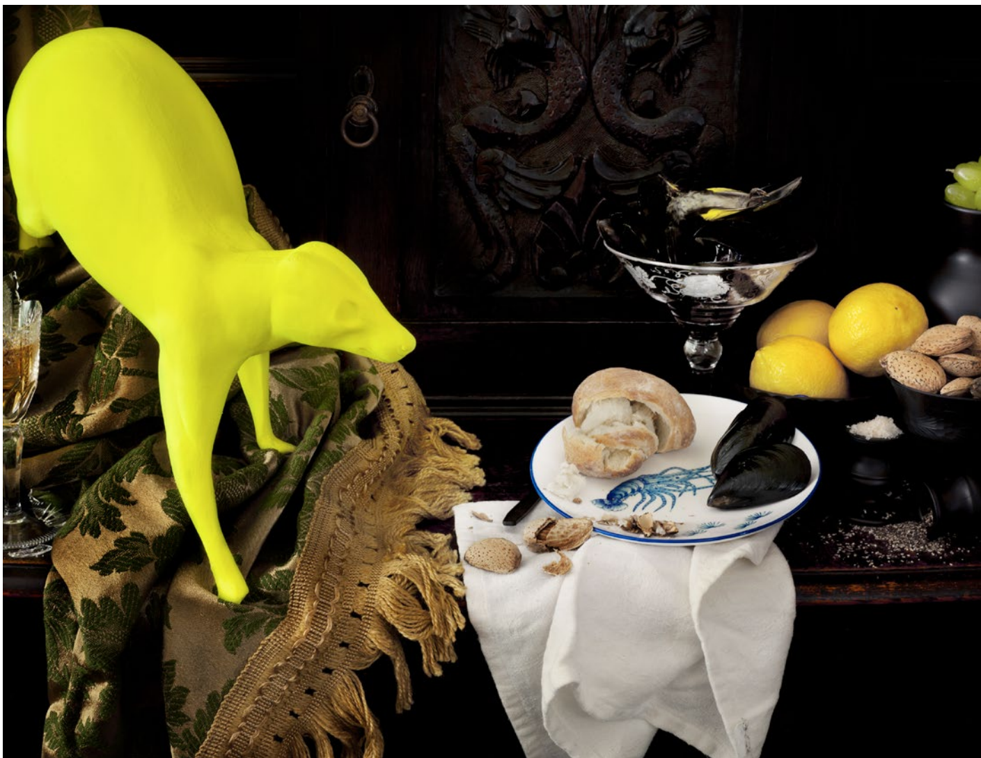
Still life with possum, mussels and New Holland Honeyeater Pigment Print 75 x 60 edition of 5 + 1AP