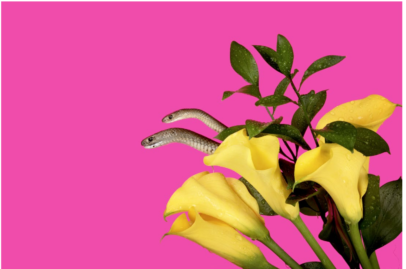
Carpetbaggers II , 2014 Pigment Print 80 x 120 edition of 5 + 1AP