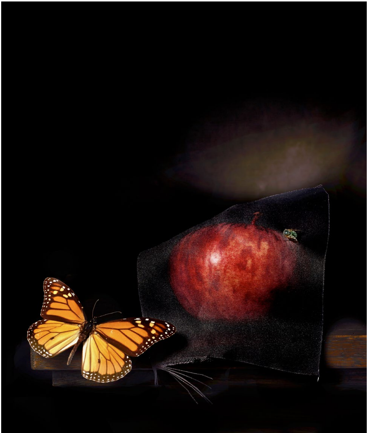
Still life with apple and green fly, 2014 Pigment Print 84.5 x 100 edition of 5 + 1AP