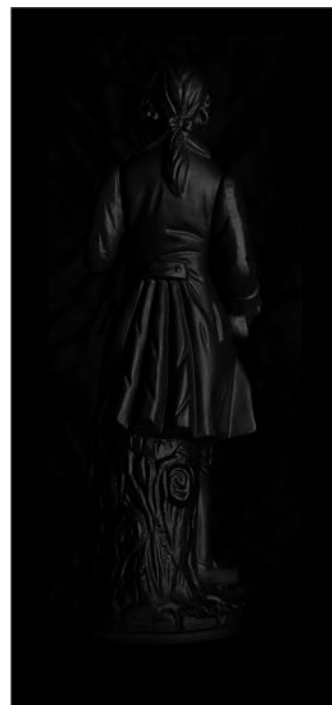
Salt (diptych, panel 1), 2013 Pigment Print 80 x 120