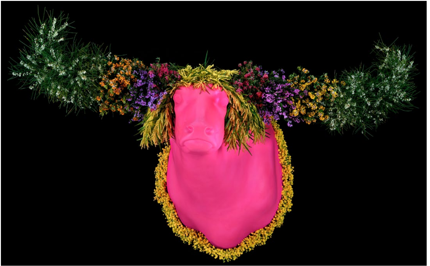
Waterbuffalo Cartouche , 2013 Pigment Print 100 x 160 cm edition of 5 + 1AP