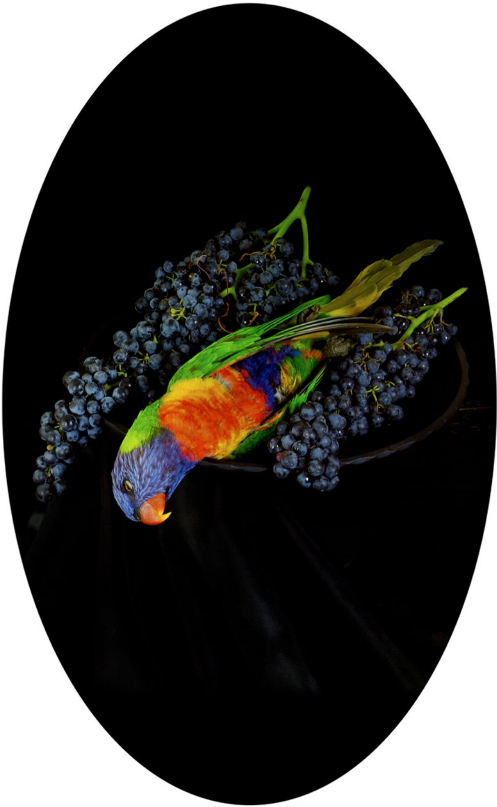
Still life with earth and air , 2014 Pigment Print edition of 5 + 1AP 60 x 37 cm