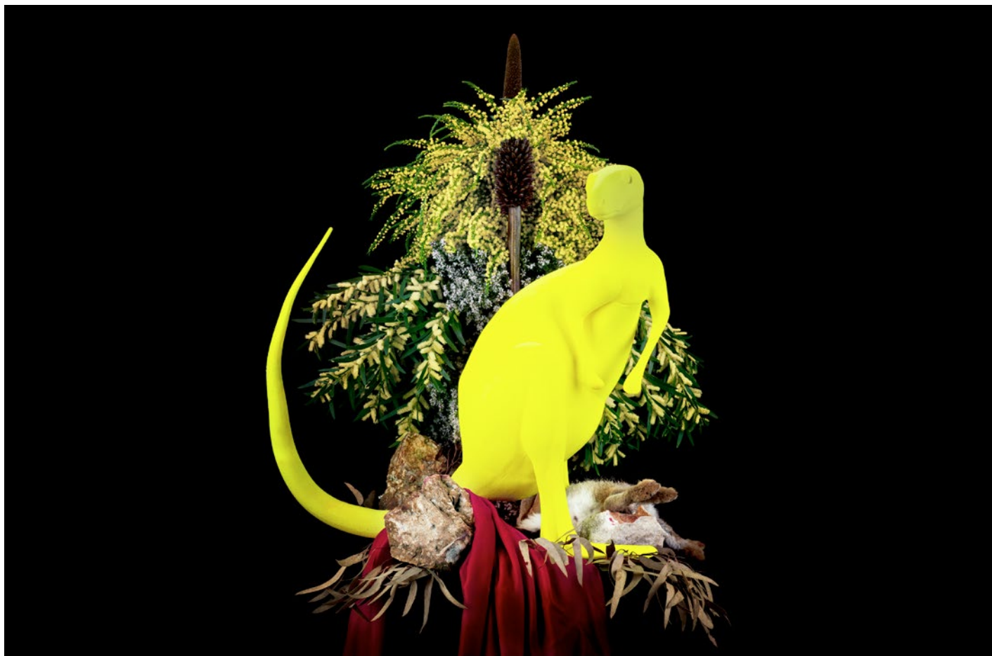
Still life with wallaby, brown rabbit, wattle cartouche, 2013 Pigment Print 122 x 80 cm edition of 5 + 1AP