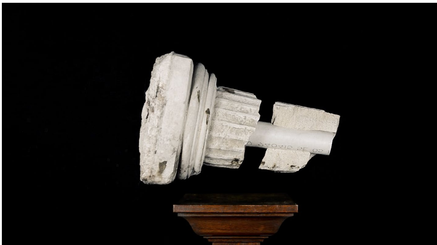
Bushcropolis #1 , 2014 16:9 HD Video 10min looped (customised presentation casing) edition of 10