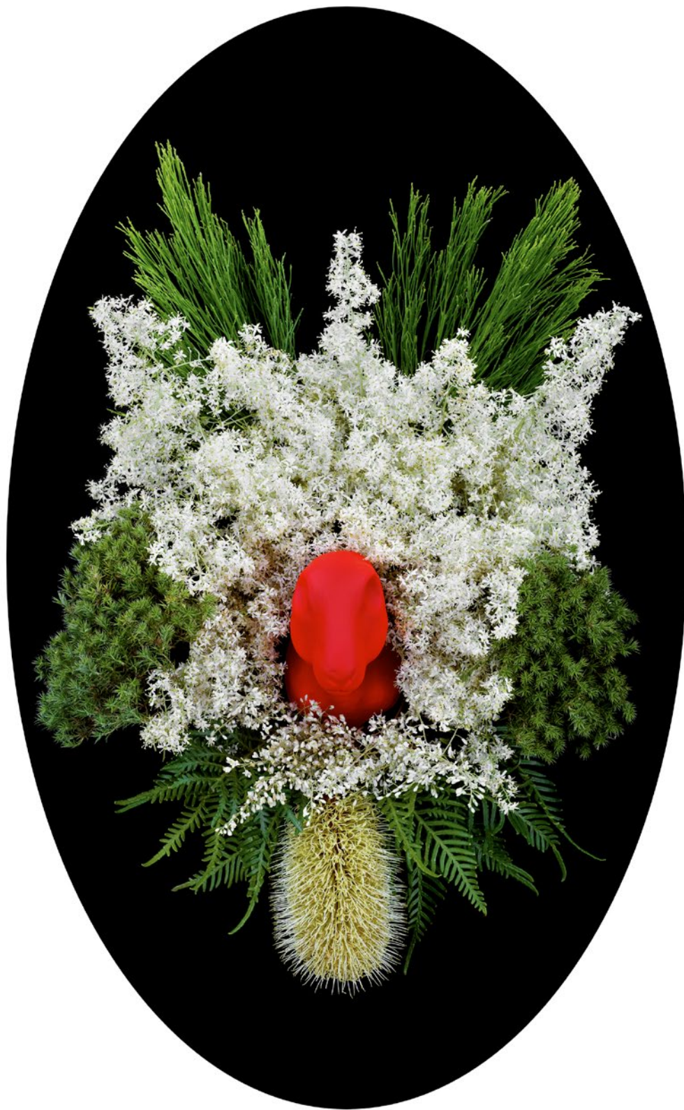
Rabbit with summer flower catouche, 2012 Pigment Print 70 x 43 cm edition of 5 + 1AP