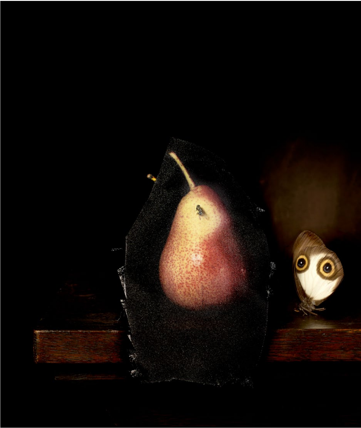
Still life with pear and housefly , 2014 Pigment Print 84.5 x 100 edition of 5 + 1AP