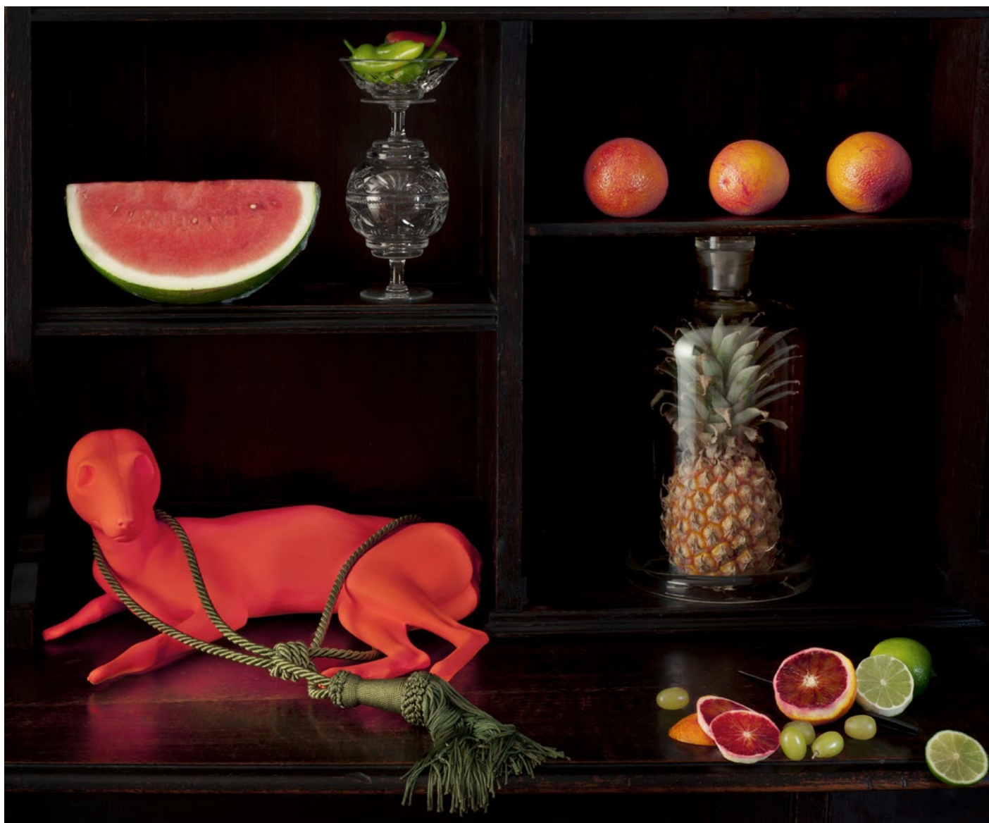
Still life with watermelon, blood orange and Thylacine Pup, 2011 Pigment Print 75 x 60 edition of 5 + 1AP