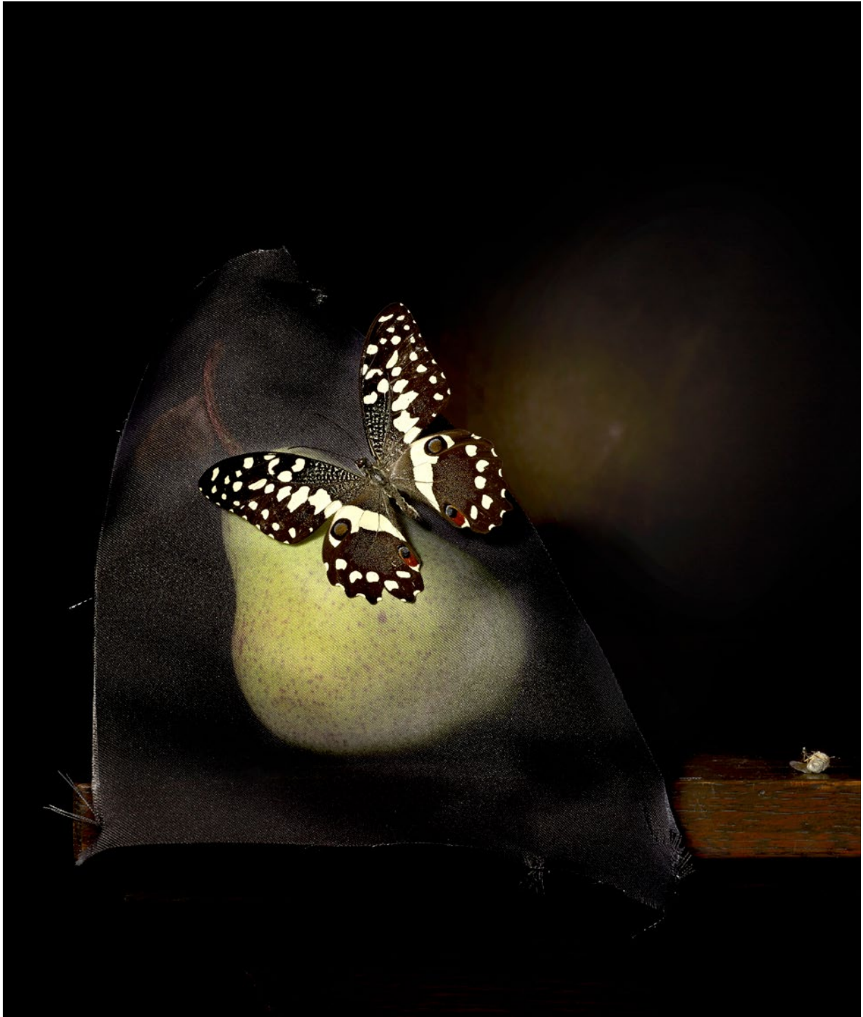
Still life with pear and bush fly , 2014 Pigment Print 84.5 x 100 edition of 5 + 1AP