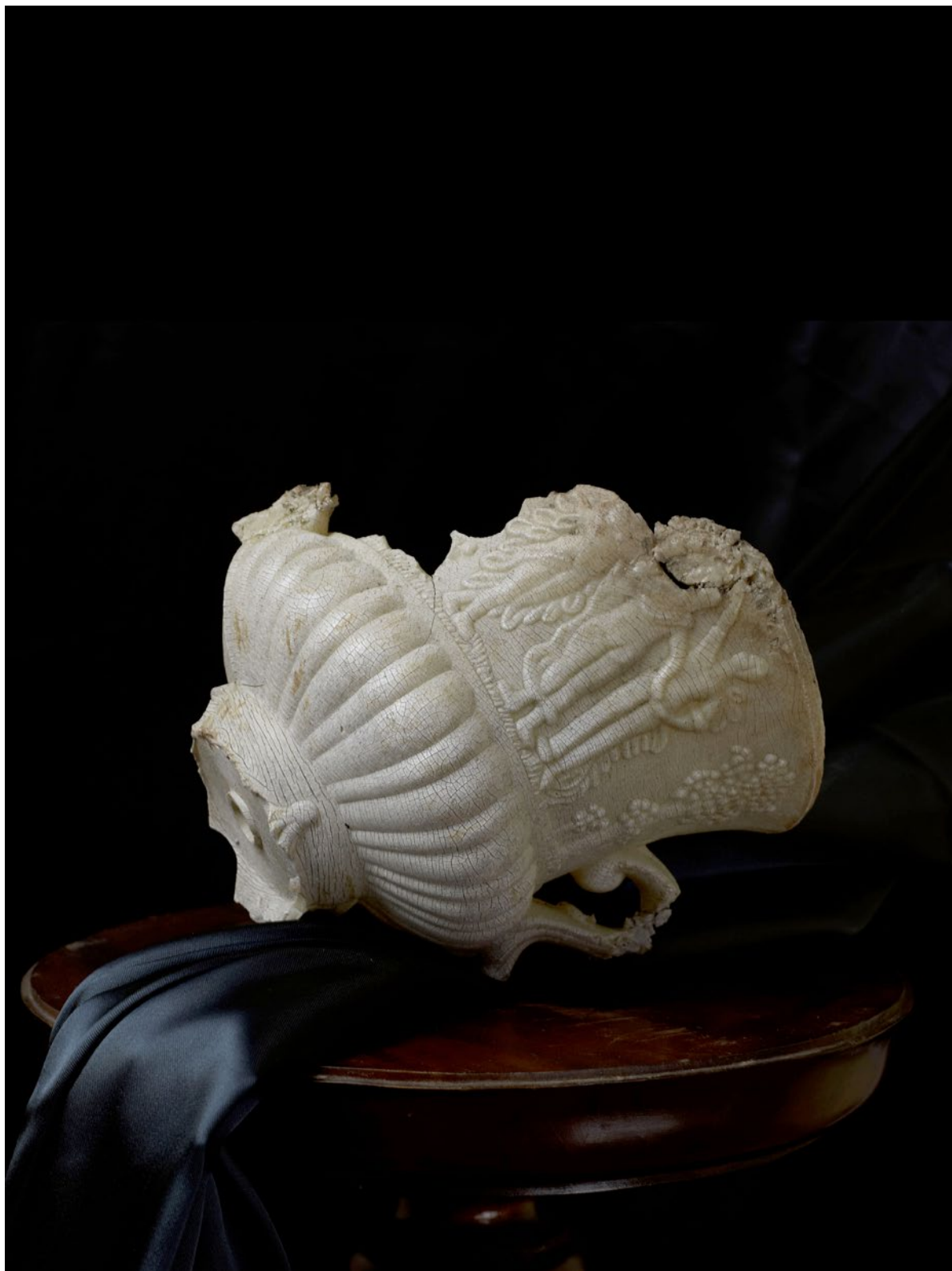
Archeology of the bush , 2013 Pigment Print 60 x 45 edition of 5 + 1AP