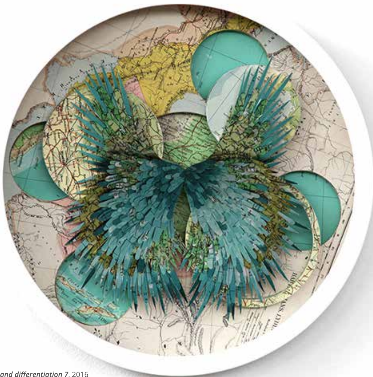
Growth and differentiation 7, 2016 Paperconstriction from handcut rephotographed maps 24.5 cm diameter