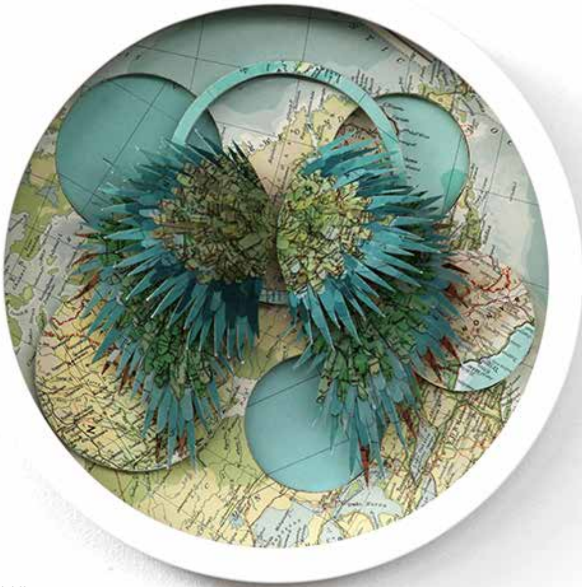
Growth and differentiation 9 , 2016 Paperconstriction from handcut rephotographed maps 24.5 cm diameter