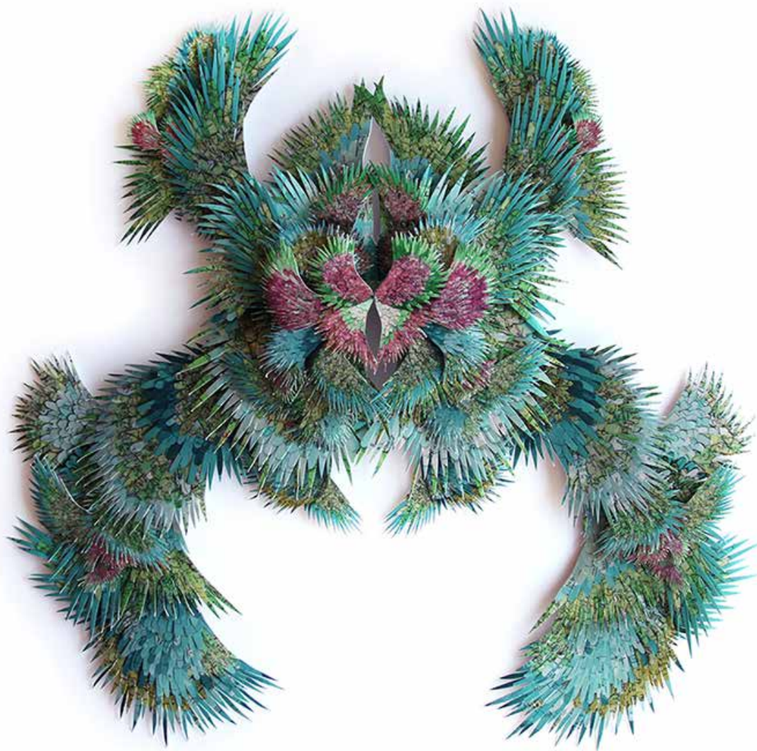
Recapitulation Theory III , 2016 Paperconstruction from handcut rephotographed maps 70 x 70 cm