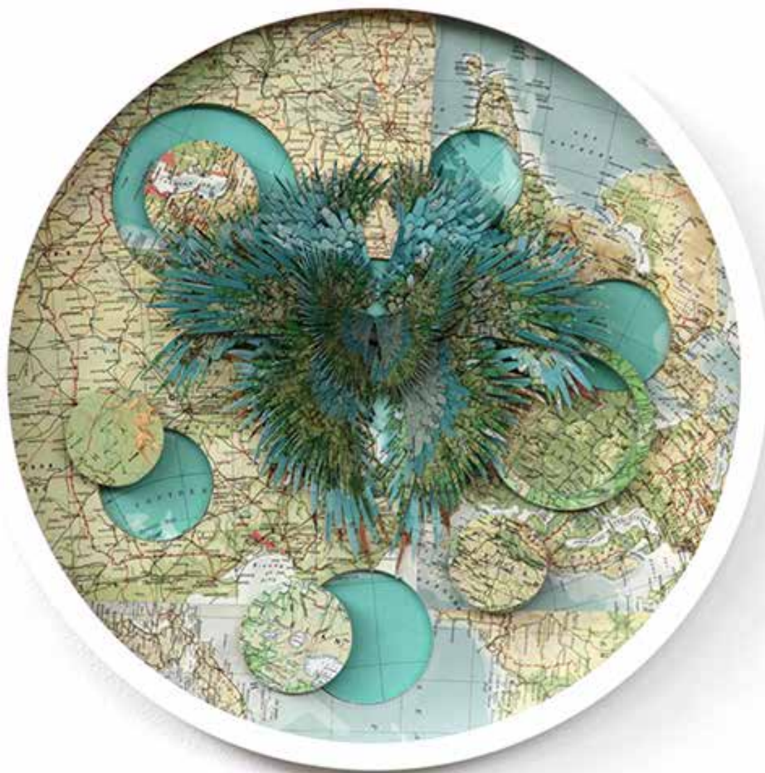
Growth and differentiation 4, 2016 Paperconstruction from handcut rephotographed maps 29 cm diameter