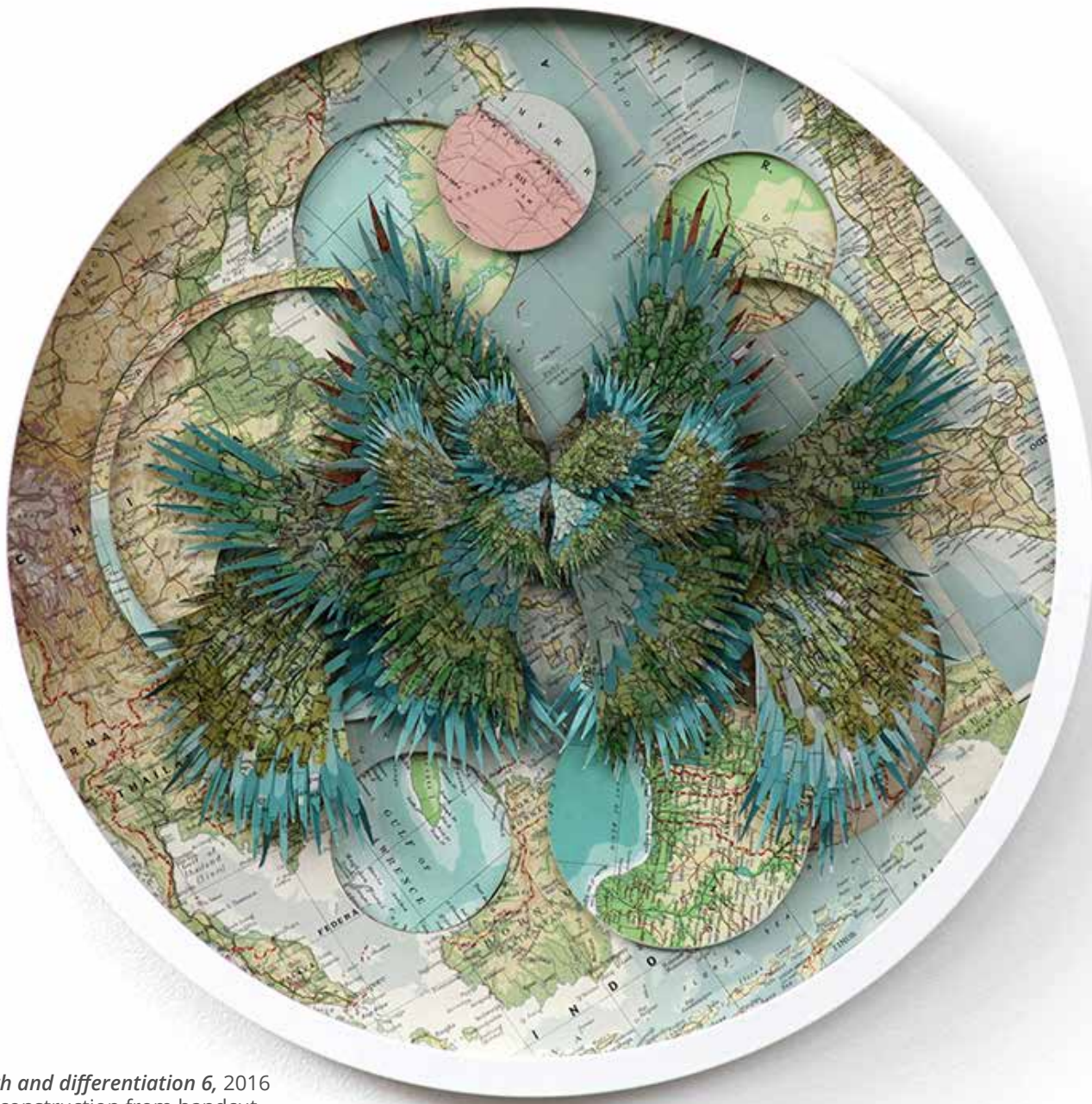
Growth and differentiation 6, 2016 Paperconstruction from handcut rephotographed maps 28 cm diameter