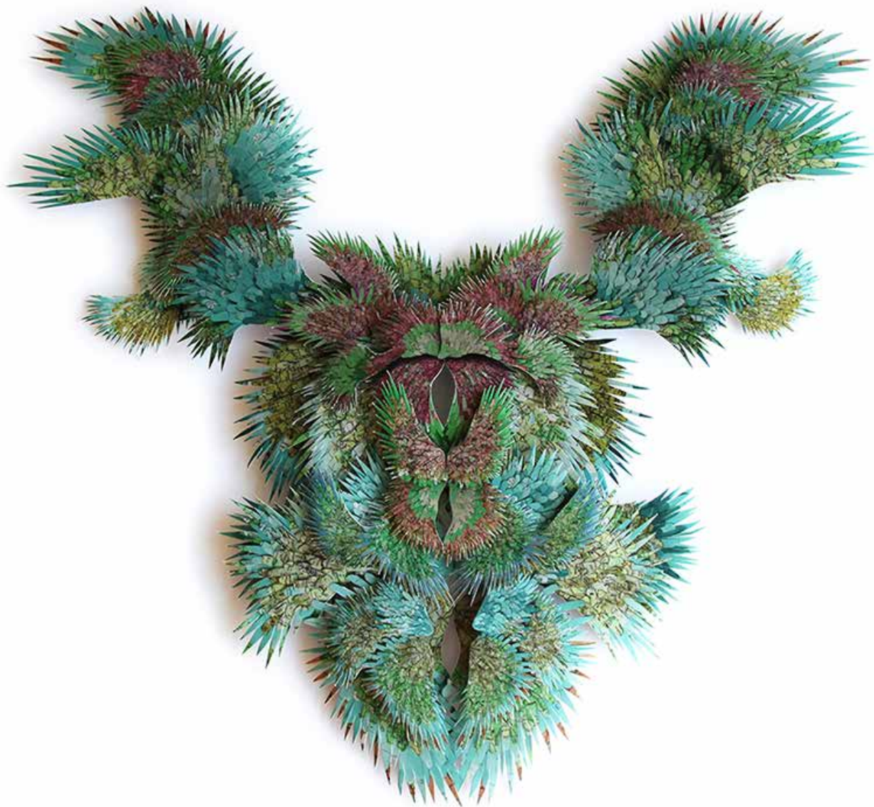
Recapitulation Theory II , 2016 Paperconstruction from handcut rephotographed maps 70 x 70 cm