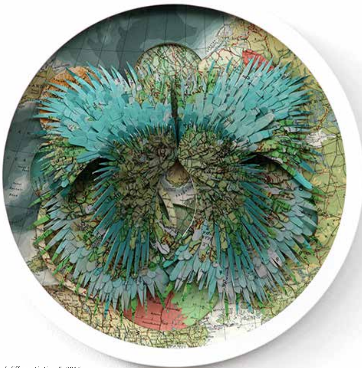
Growth and differentiation 5 , 2016 Paperconstruction from handcut rephotographed maps 29 cm diameter