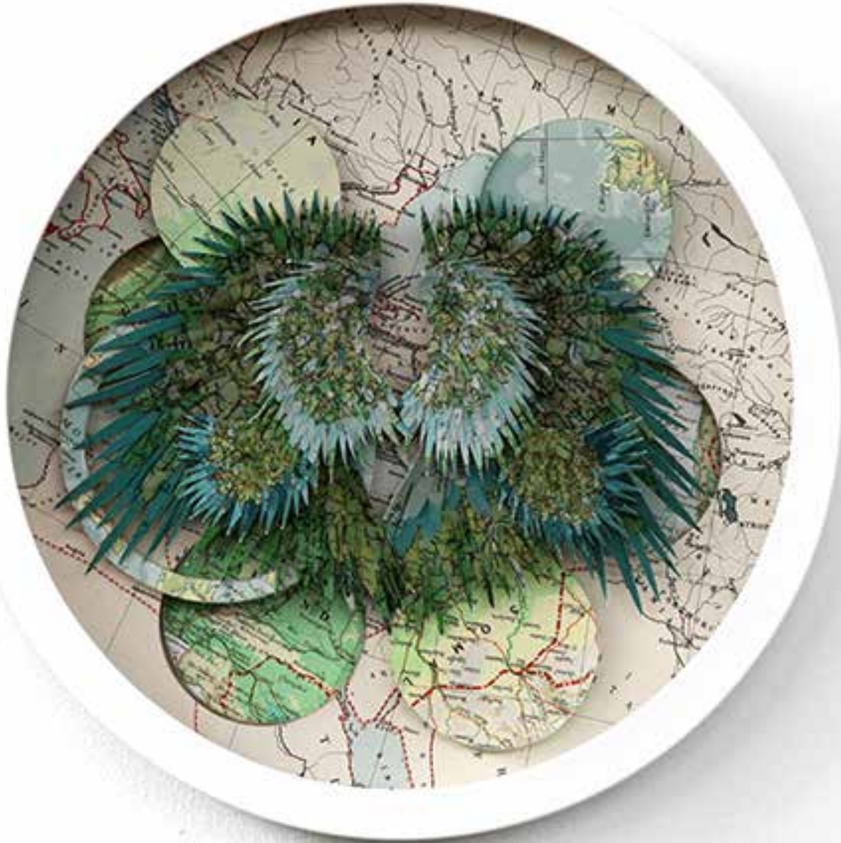
Growth and differentiation 10 , 2016 Paperconstruction from handcut rephotographed maps 24.5 cm diameter