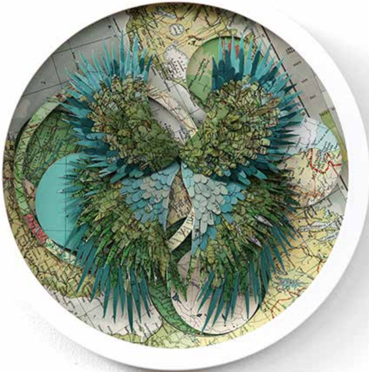
Growth and differentiation 2, 2016 Paperconstruction from handcut rephotographed maps 41 cm diameter