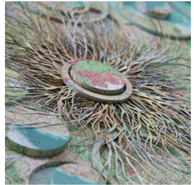
Eternal expansion , 2016 paperconstruction from handcut rephotographed maps 85cm diameter