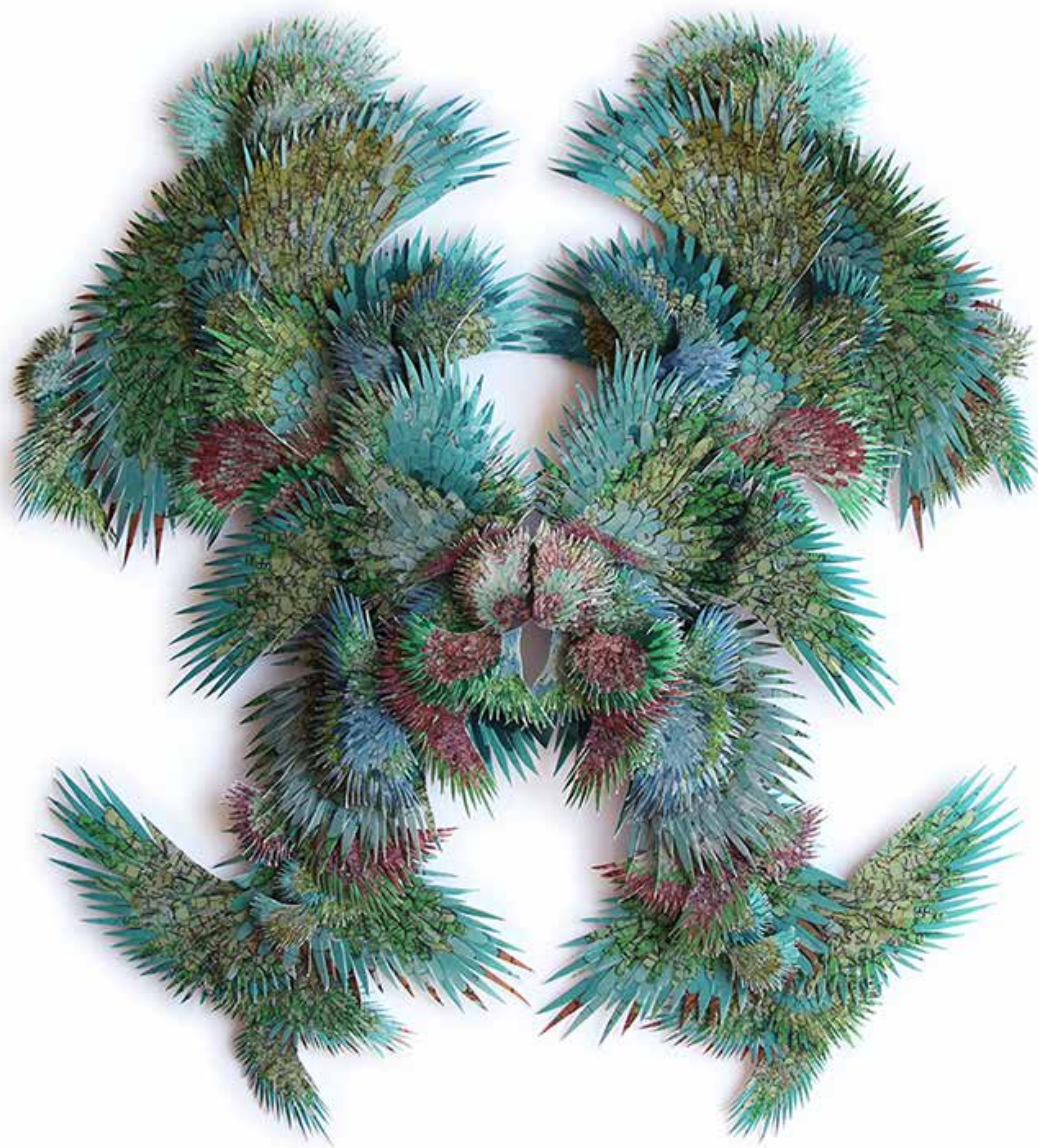
Recapitulation Theory I , 2016 Paperconstruction from handcut rephotographed maps 70 x 70 cm