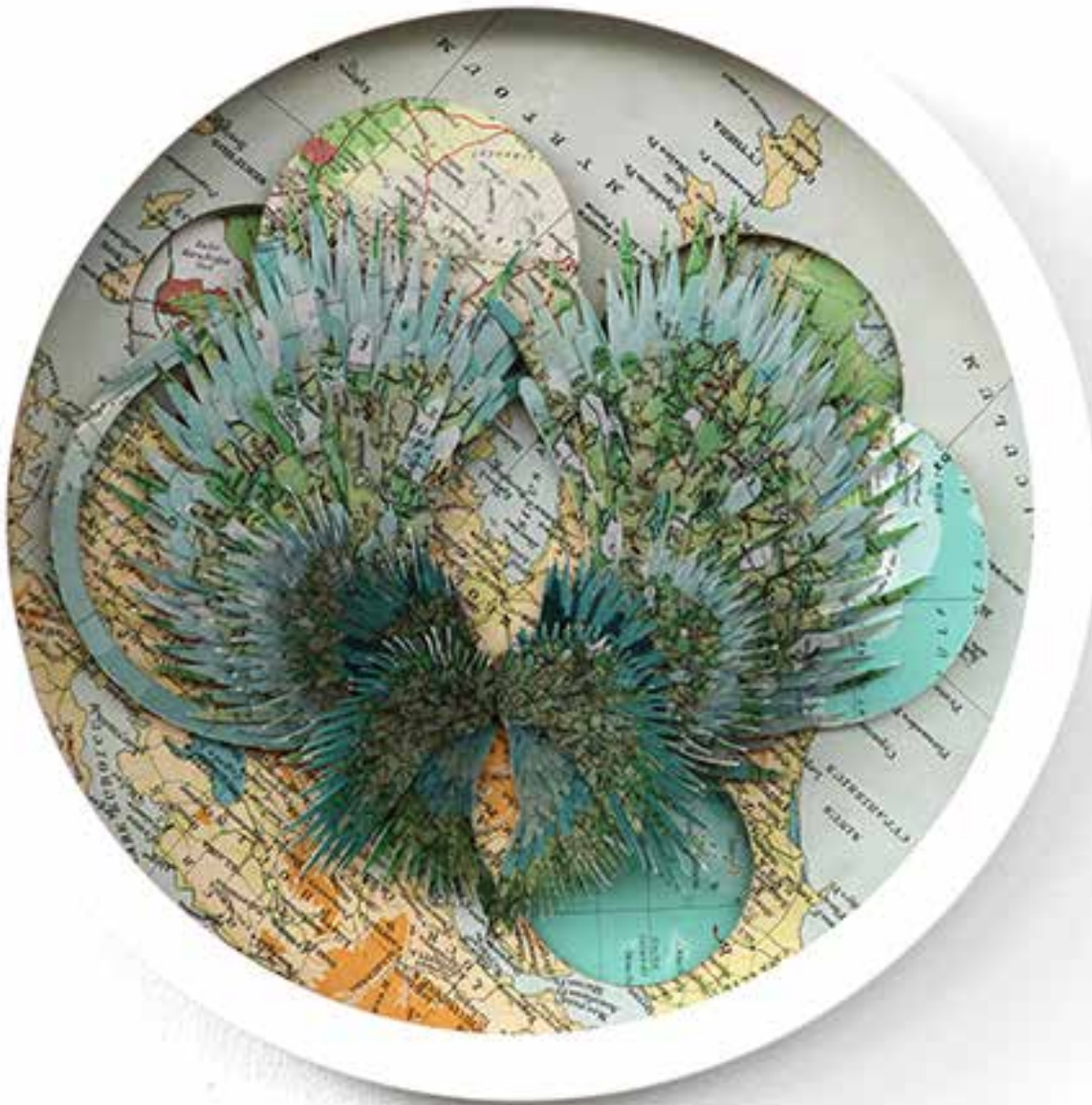
Growth and differentiation 1 , 2016 Paperconstruction from handcut rephotographed maps 41 cm diameter