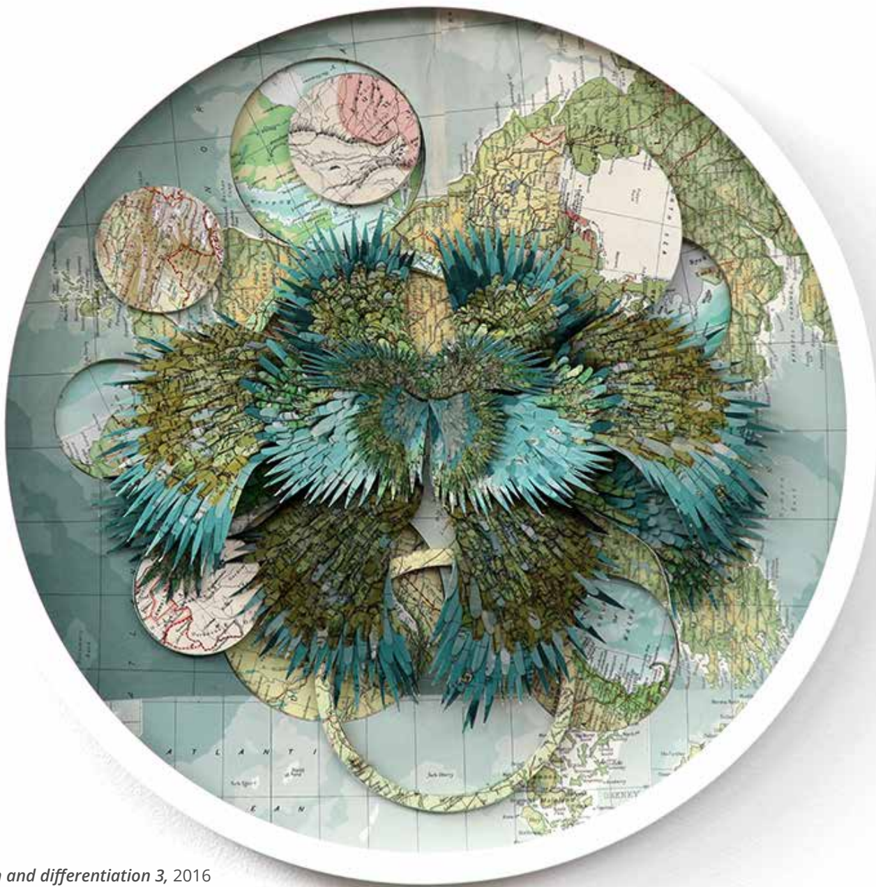
Growth and differentiation 3 , 2016 Paperconstruction from rephotographed maps 41 cm diameter