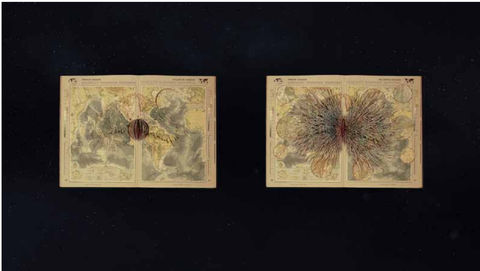
Parallel Universe , 2015 Digital animation Continuous loop