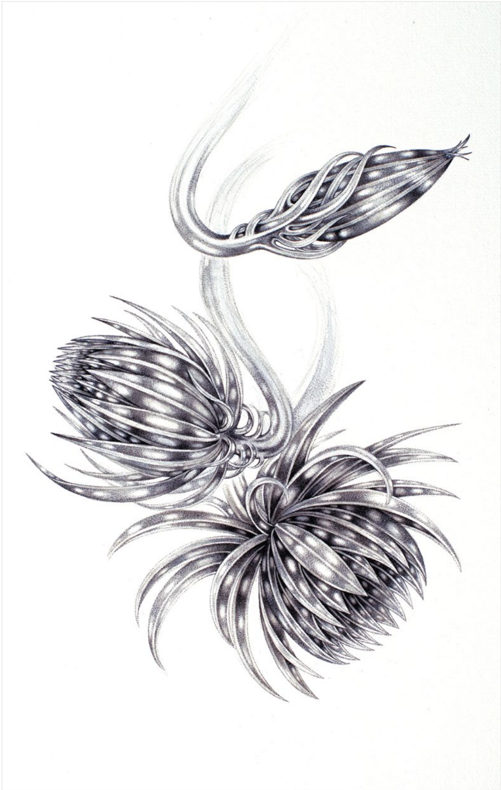
Found (Cereus Flower I) , 2014 pen, pencil and ink on archival paper 93 x 71 cm