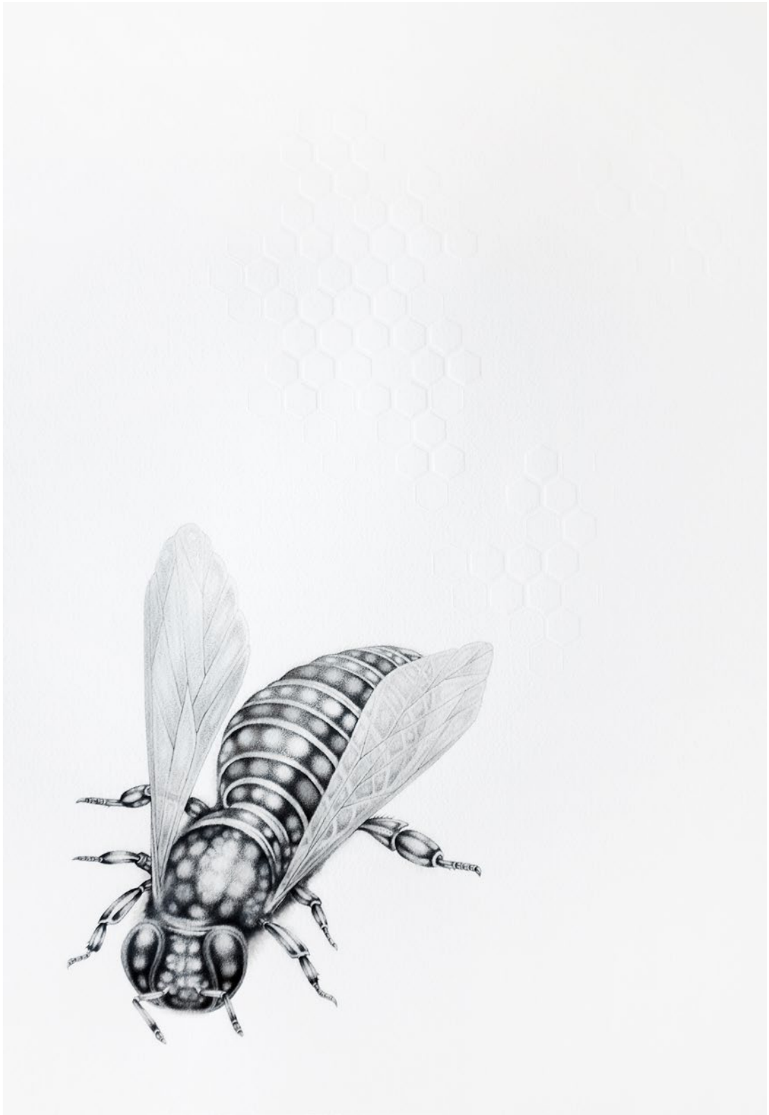
Found (Honey bee) , 2015 pen, pencil and ink on embossed archival paper 93 x 71 cm