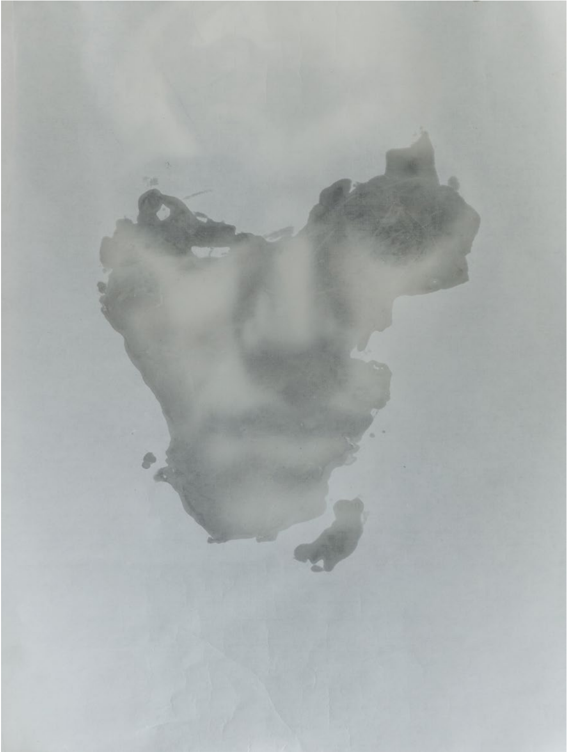
Inner Reflection , 2014 mixed media on Stonehenge, wax, mulberry paper 89 x 64 cm