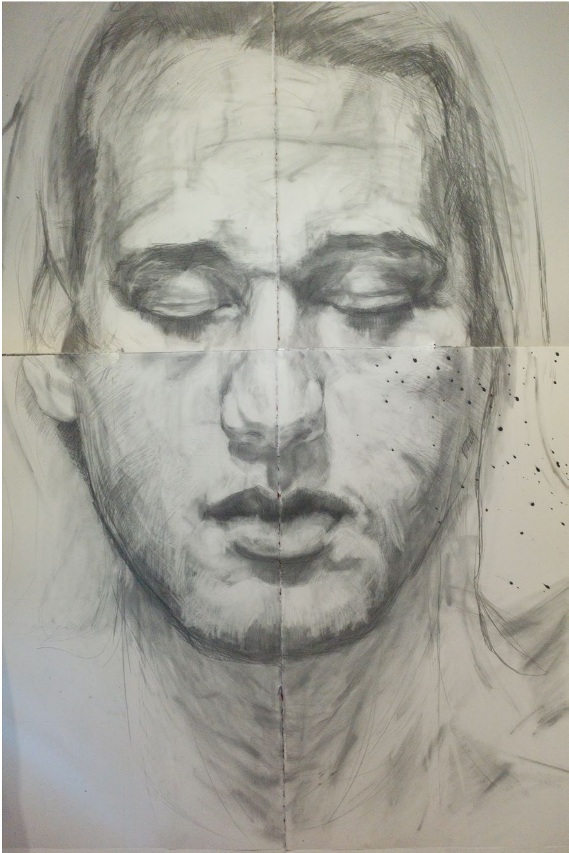
Untitled , 2015 graphite on paper 193 x 132 cm