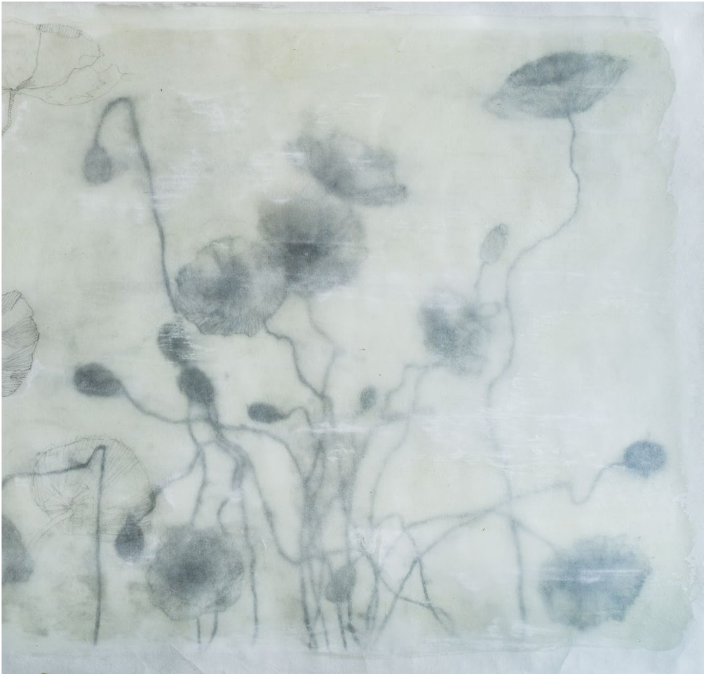
Untitled (Detail) , 2014 wax and graphite on Stonehenge 46 x 81 cm