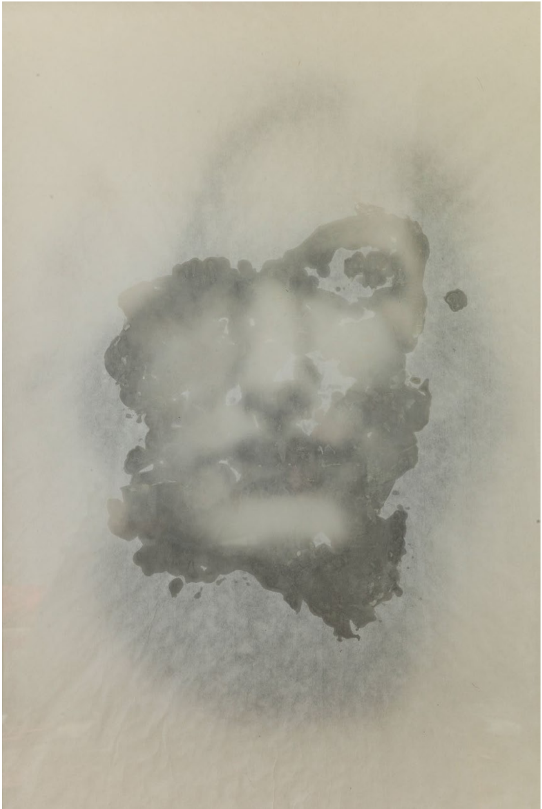
Unbound Spirit , 2014 mixed media on Stonehenge, wax on mulberry paper 115 x 88 cm