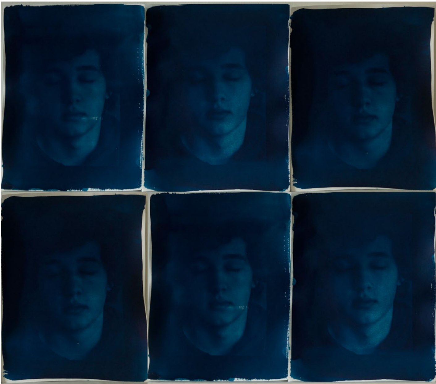
Emerge , 2015 Cyanotype 72 x 84 cm