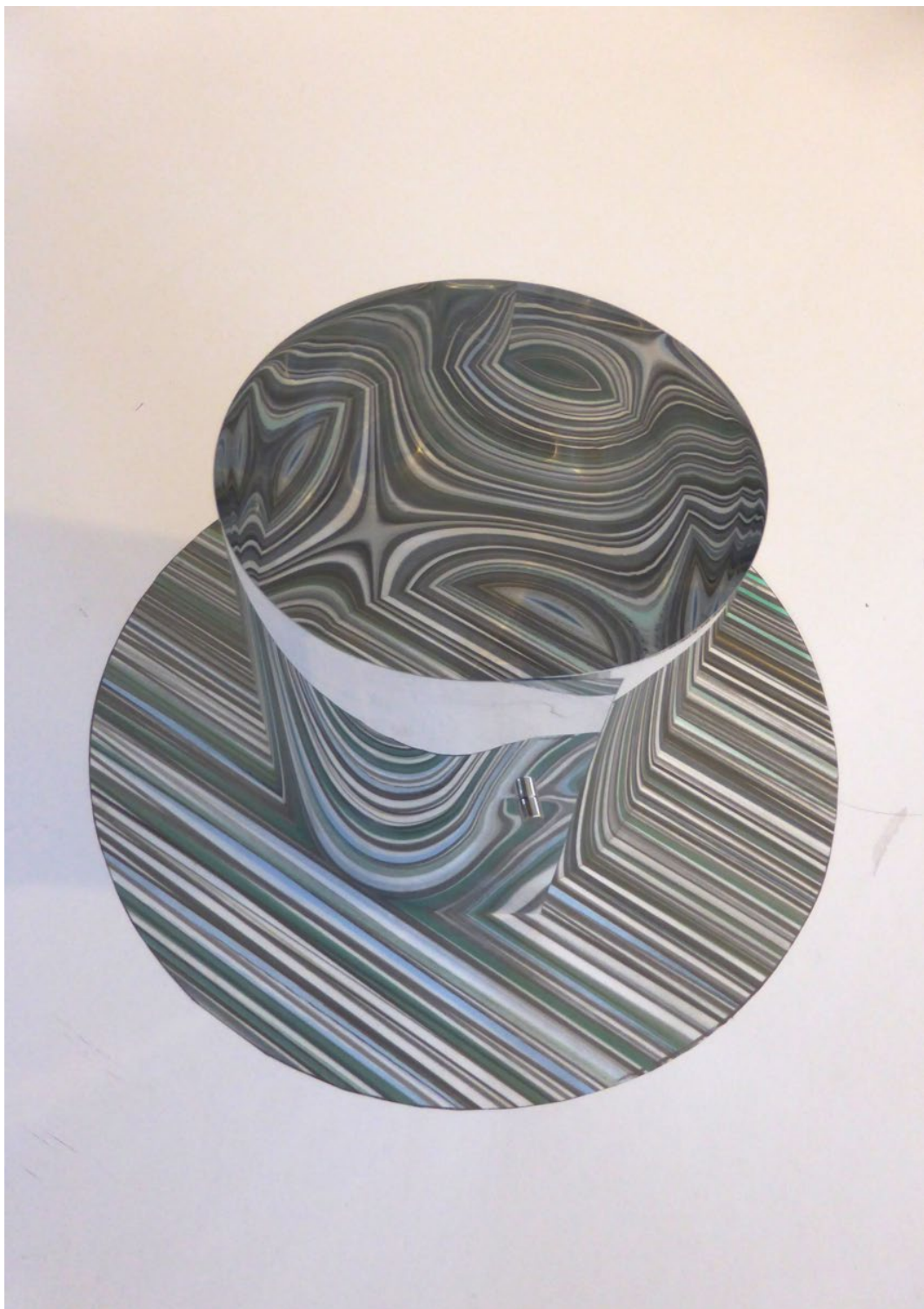
BendLine Series I , 2015 graphite, colour pencils on Mylar, reflective Mylar, magnets 23x14cm