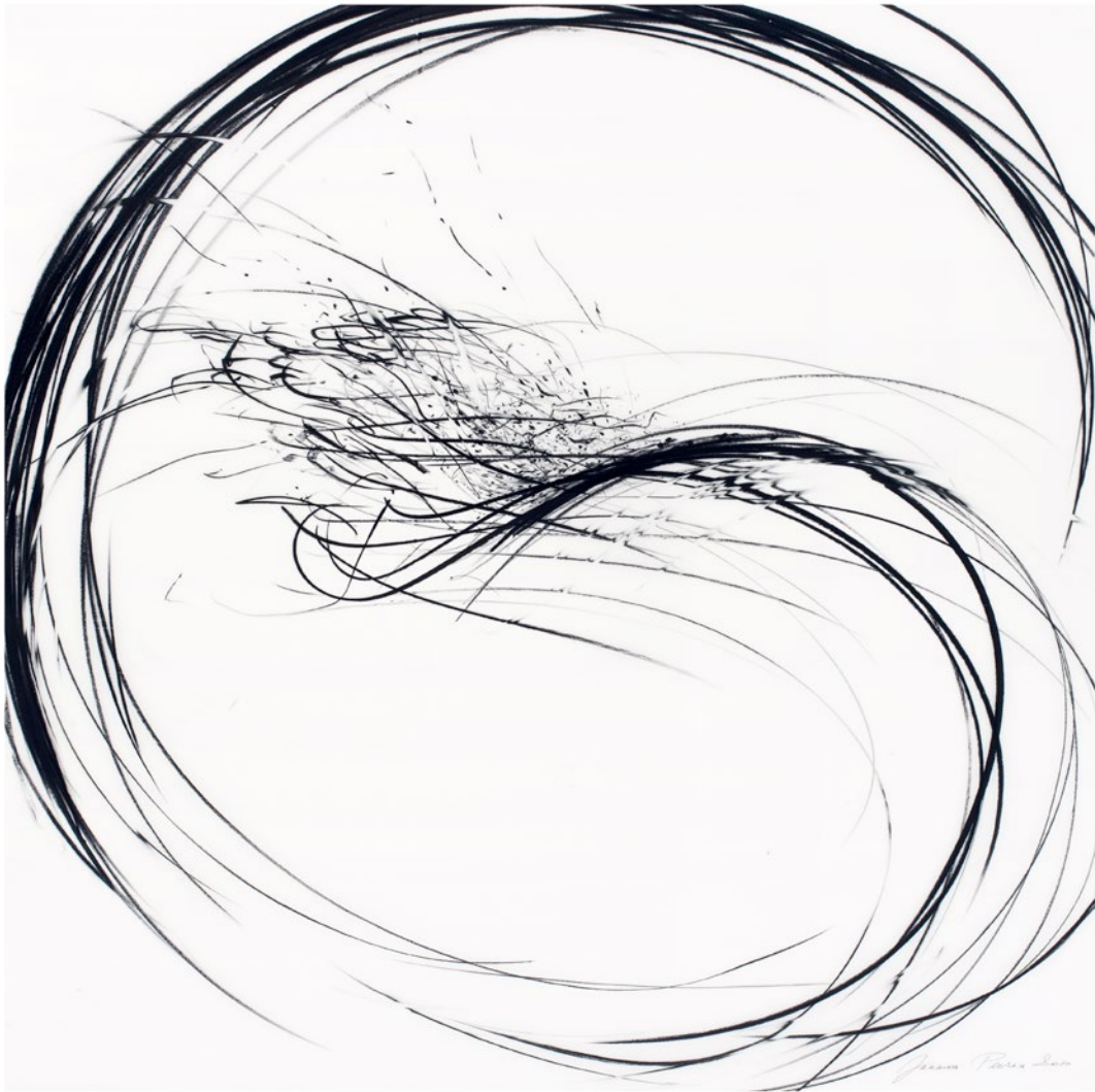
Maelstrom Series, 2013