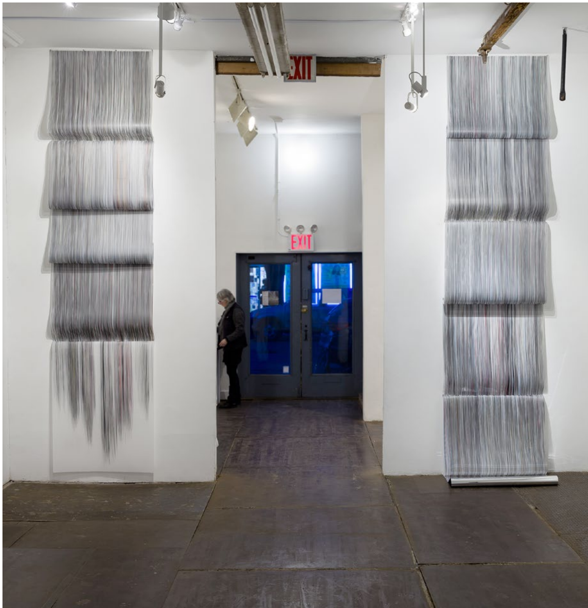
Graphite Falls III and IV , 2015 drawing installations on wall graphite, pencils on Mylar 92x230cm