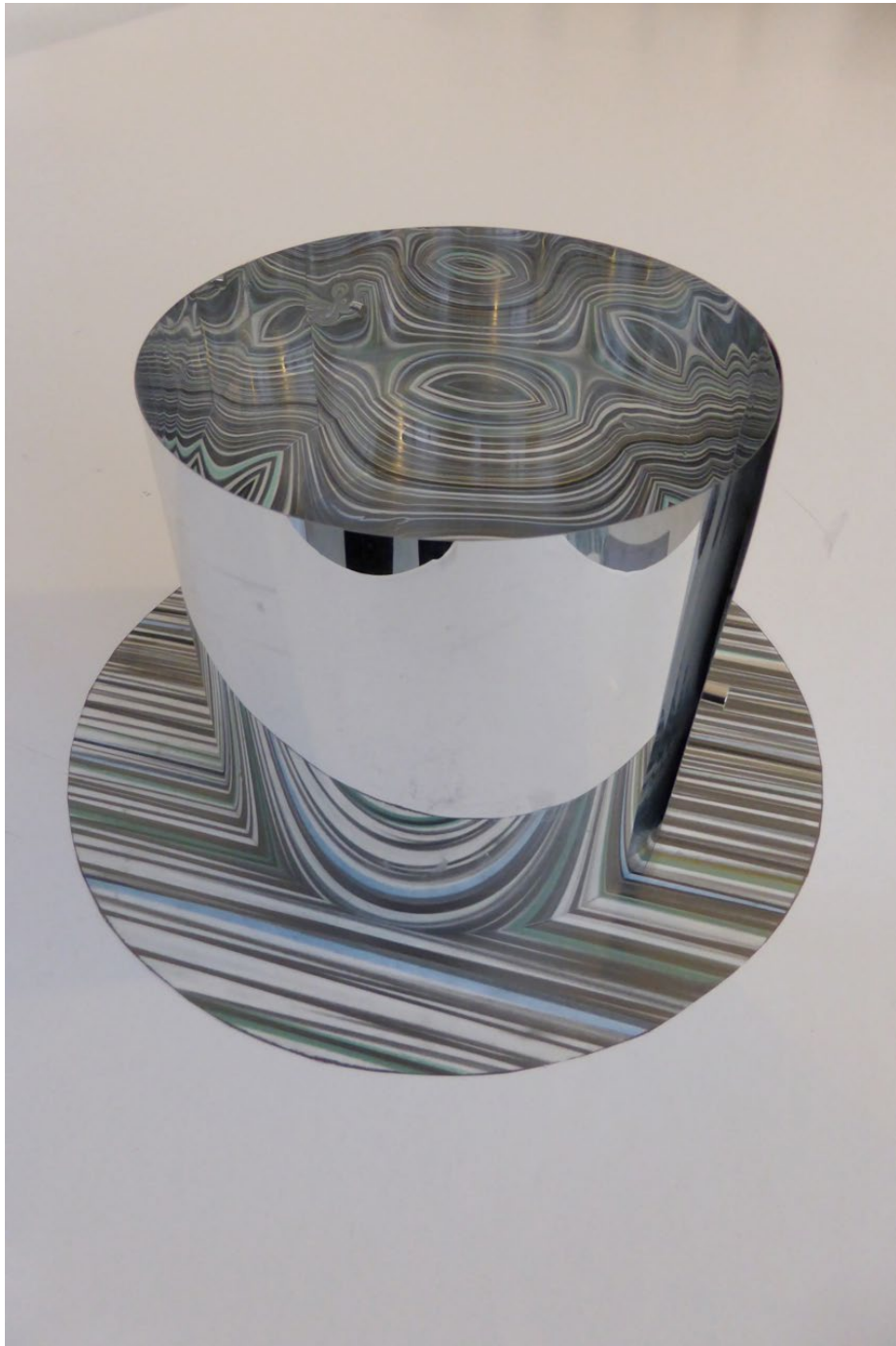
BendLine Series II, 2015 graphite, colour pencils on Mylar, reflective Mylar, magnets 29x15cm