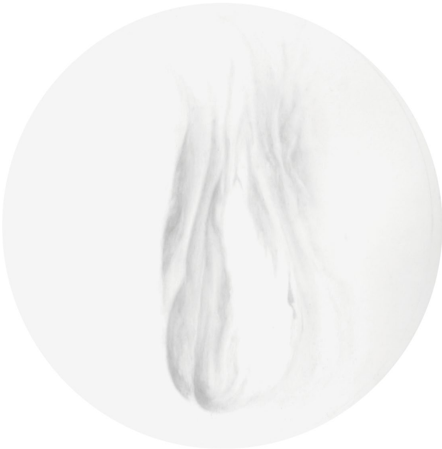
Stingray (reversed) Nebulous Bodies 2014 graphite and charcoal on paper 400 x 400 x 30mm