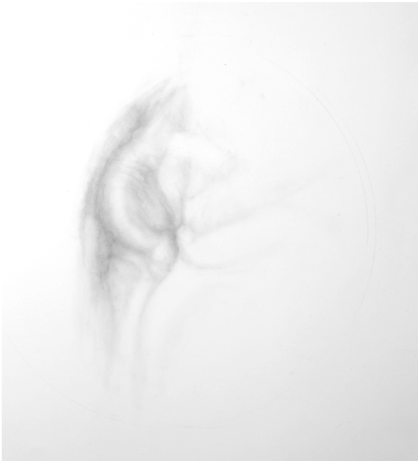
Dumbbell Nebulous Bodies 2014 graphite and charcoal on paper 606 x 730 x 30mm