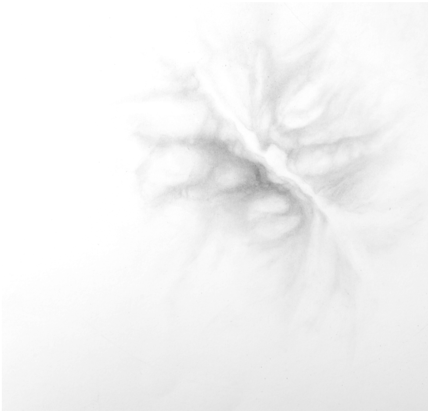
Soap Bubble Nebulous Bodies 2014 graphite and charcoal on paper 609 x 440 x 30mm