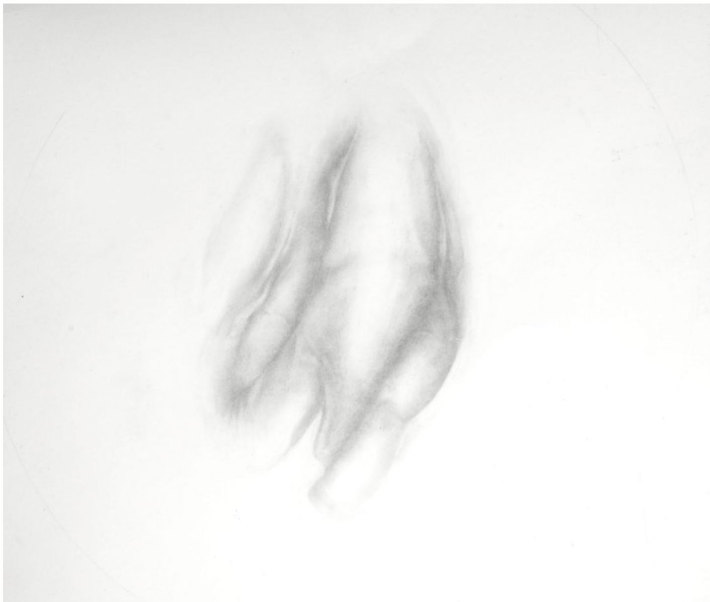
Red Spider Nebulous Bodies 2014 graphite and charcoal on paper 482 x 398 x 30mm