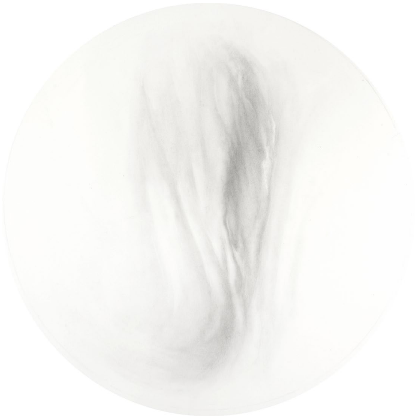
Stingray Nebulous Bodies 2014 graphite and charcoal on paper 400 x 400 x 30mm