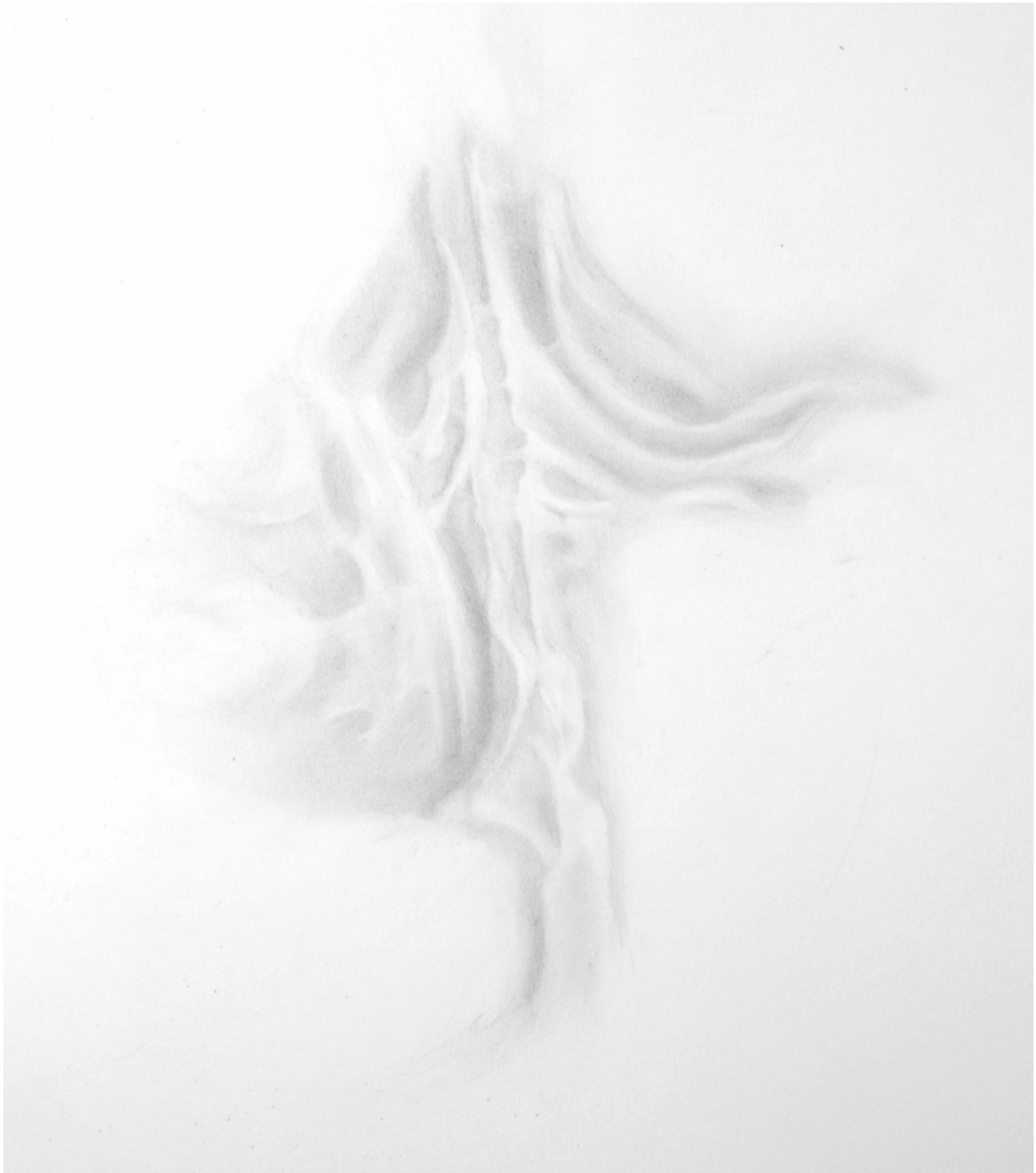
Little Ghost (reversed) Nebulous Bodies 2014 graphite and charcoal on paper 558 x 610 x 30mm