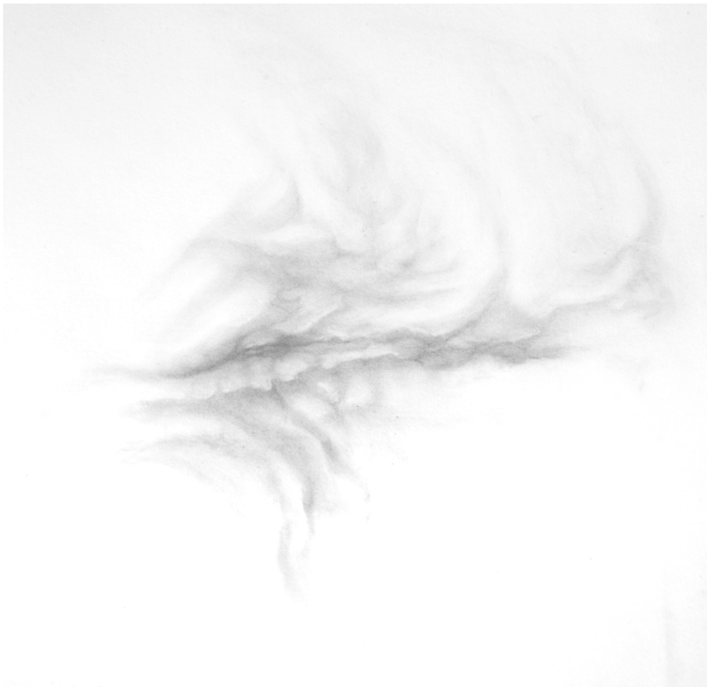
Little Ghost Nebulous Bodies 2014 graphite and charcoal on paper 428 x 379 x 30mm