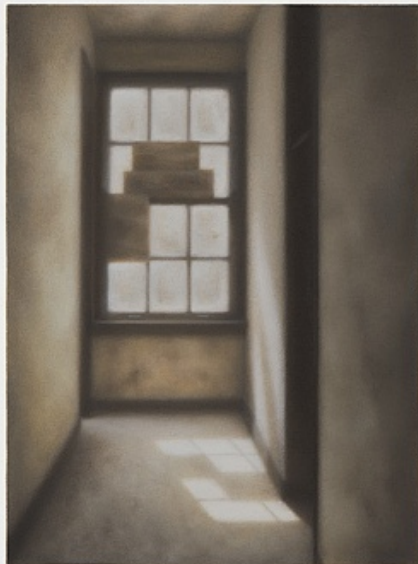
Kirrily Humphries GNH Interior XIX , 2018 Oil on arches huile 35.50h x 28w cm