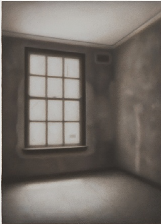
Kirrily Humphries GNH Interior XX , 2018 Oil on arches huile 40.80h x 30.50w cm