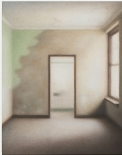
Kirrily Humphries GNH Interior XVII , 2017 Oil on arches huile 45.50h x 35.50w cm