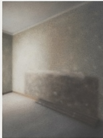
Kirrily Humphries GNH Interior XII , 2017 Oil on arches huile 35.50h x 28w cm