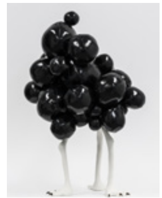
Archaea No.08, 2017