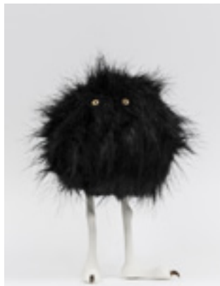
Archaea No.06, 2017