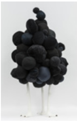
Archaea No.01, 2017