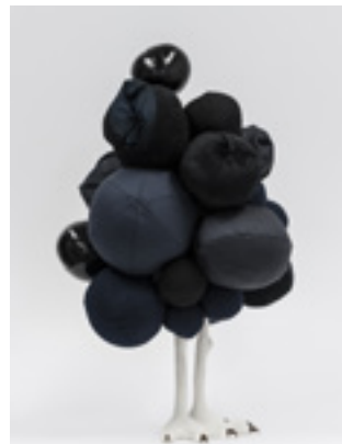
Archaea No.07, 2017