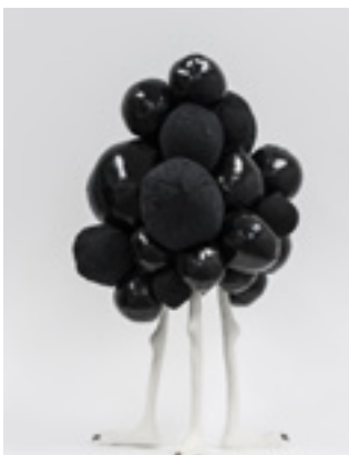
Archaea No.09, 2017