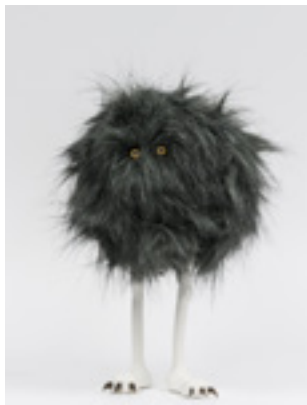
Archaea No.02, 2017