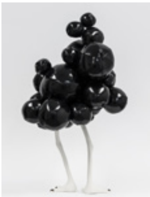
Archaea No.05, 2017