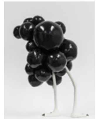
Archaea No.04, 2017